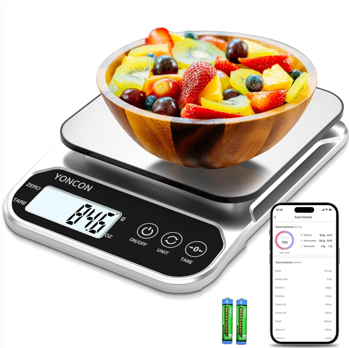
Image 1.1: The Yoncon Smart Food Scale with a bowl of fruit, demonstrating its use for weighing food. The scale displays a digital reading, and a smartphone screen shows nutritional data from the Wealhub app.