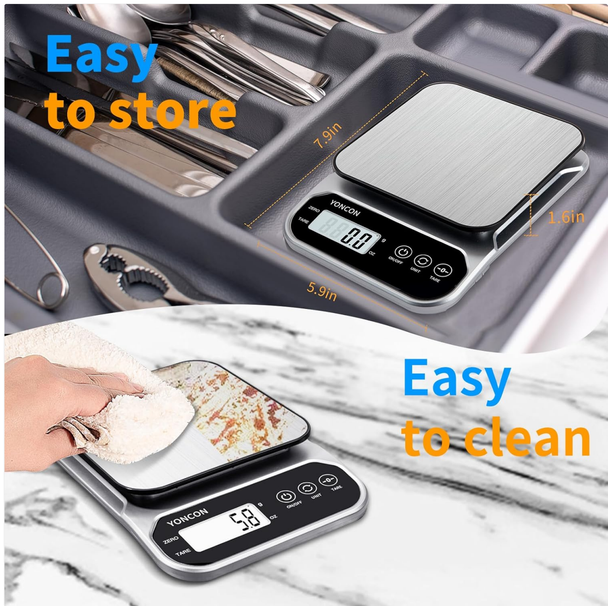
Image 6.1: The Yoncon Smart Food Scale being cleaned with a cloth and shown stored neatly in a kitchen drawer, emphasizing its easy-to-clean surface and compact design for convenient storage.