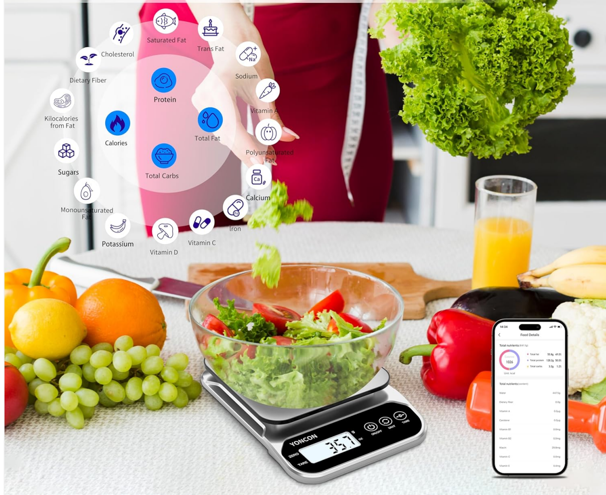
Image 5.3: The Yoncon Smart Food Scale in use, with a smartphone displaying the "Wealhub" app's interface, highlighting its capability for 19 types of nutritional analysis and a comprehensive food database.

A healthy diet plays a vital role in strengthening the immune system, which helps fight infections, diseases.