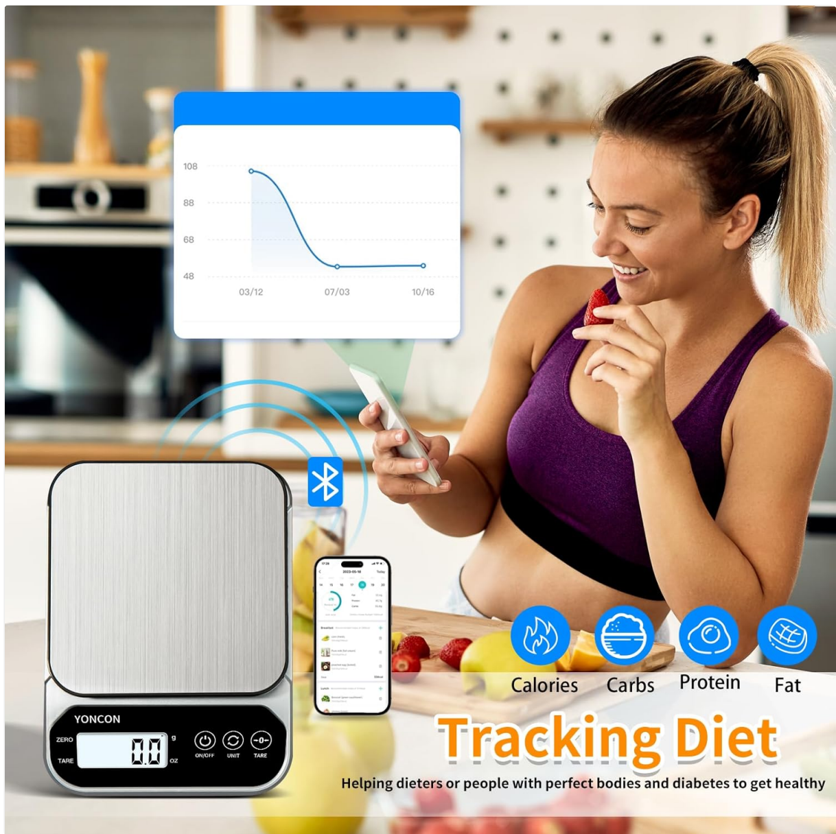
Image 5.4: A user interacting with the Yoncon Smart Food Scale and the Wealhub app, demonstrating how the scale assists in tracking diet metrics like calories, carbs, protein, and fat for health management.