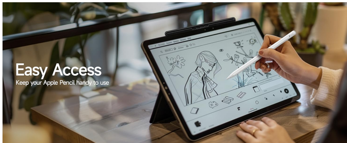
Image: The holder easily snaps onto the magnetic case, providing a secure spot for the Apple Pencil.

Video: Official Dracool video demonstrating the installation of the Pencil Holder case for Apple Pencil.