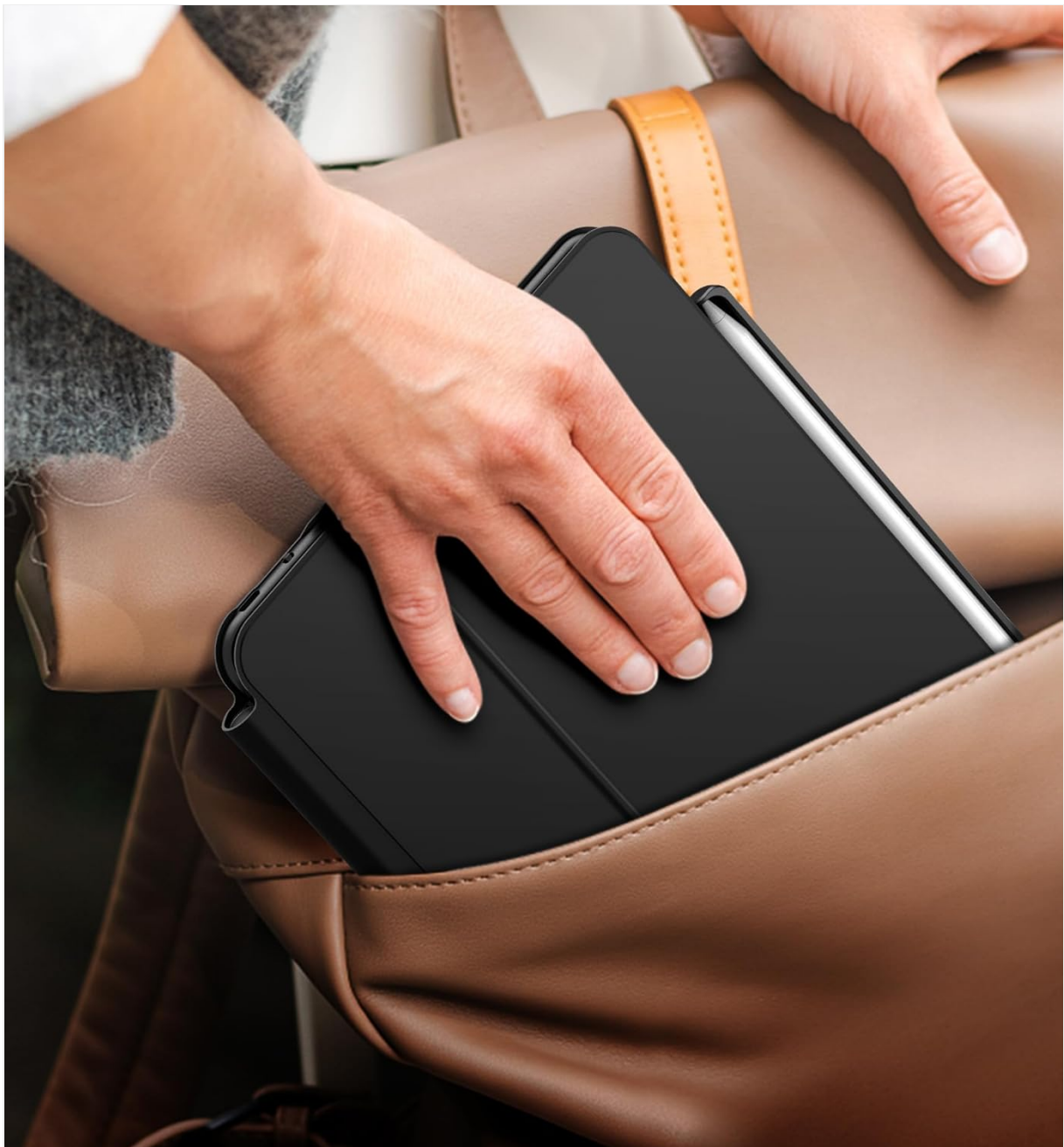
Image: The slim design allows for easy storage of your iPad and pencil in a bag, protecting the pencil from damage.