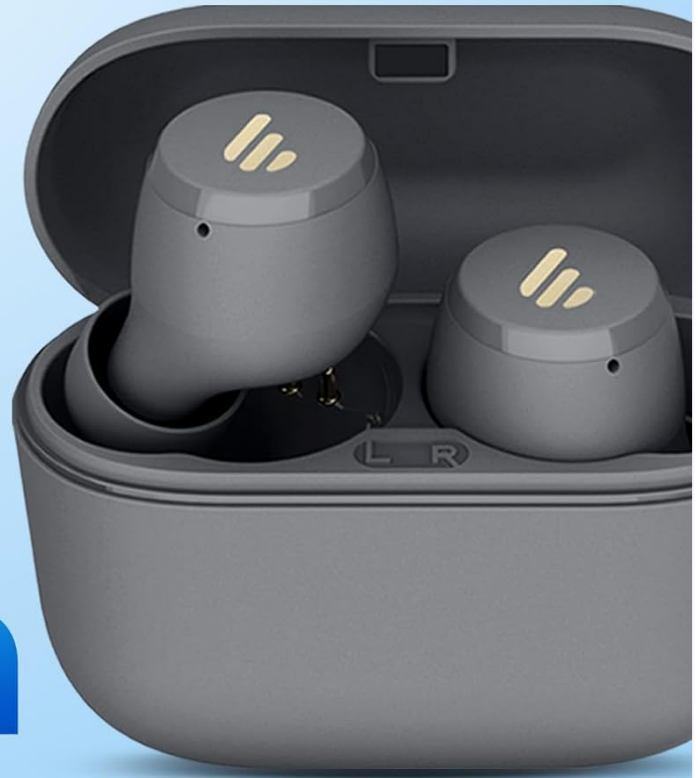
Image: A graphic showing the earbuds and charging case, with icons for "Approx. 6H single battery life" and "Approx. 24H total battery life," emphasizing the extended playback time.