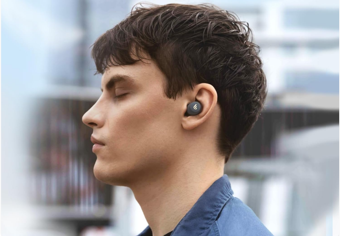
Image: A man wearing an earbud, with a graphic overlay indicating AI-powered noise reduction for clear calls.

Equipped with a 6mm driver, delivers perfectly balanced highs, mids and bass.