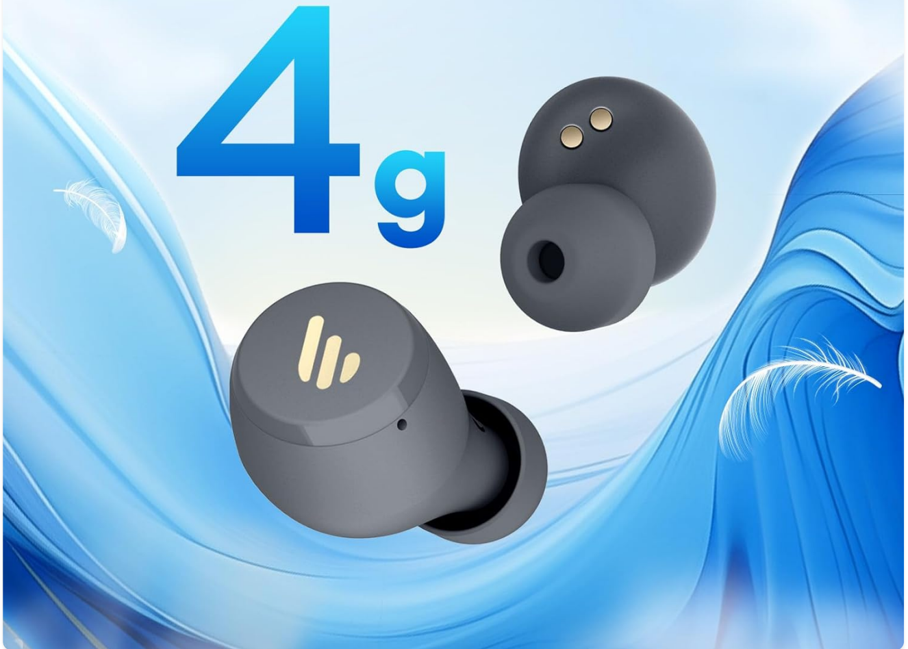
Image: A graphic illustrating the lightweight nature of the earbuds, showing "4g" and feathers, indicating a comfortable fit.

Each earbud weighs only 4g, ensuring that every listening session is a carefree delight.