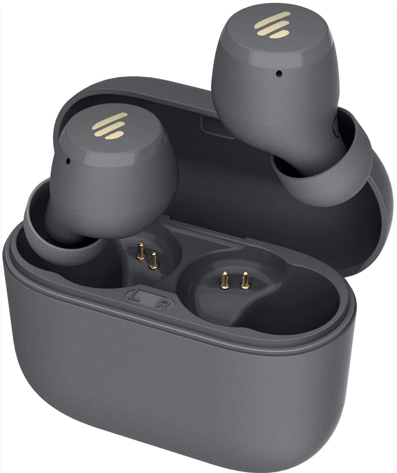
Image: The Edifier X3 Lite earbuds resting inside their charging case, showcasing their compact design and the charging pins.