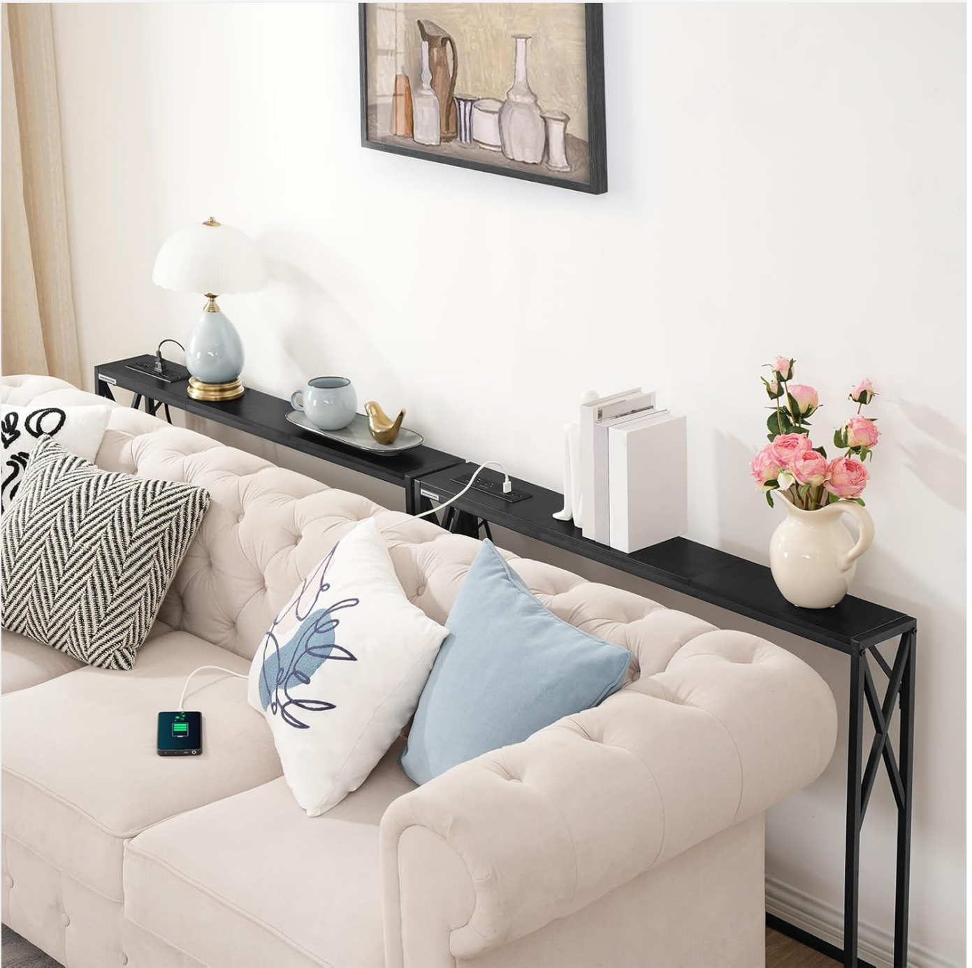
Image: Sofa table in use, demonstrating charging capabilities.