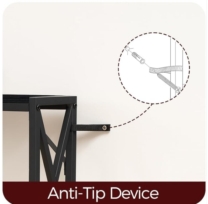
Image: Detailed view of key structural and safety features.