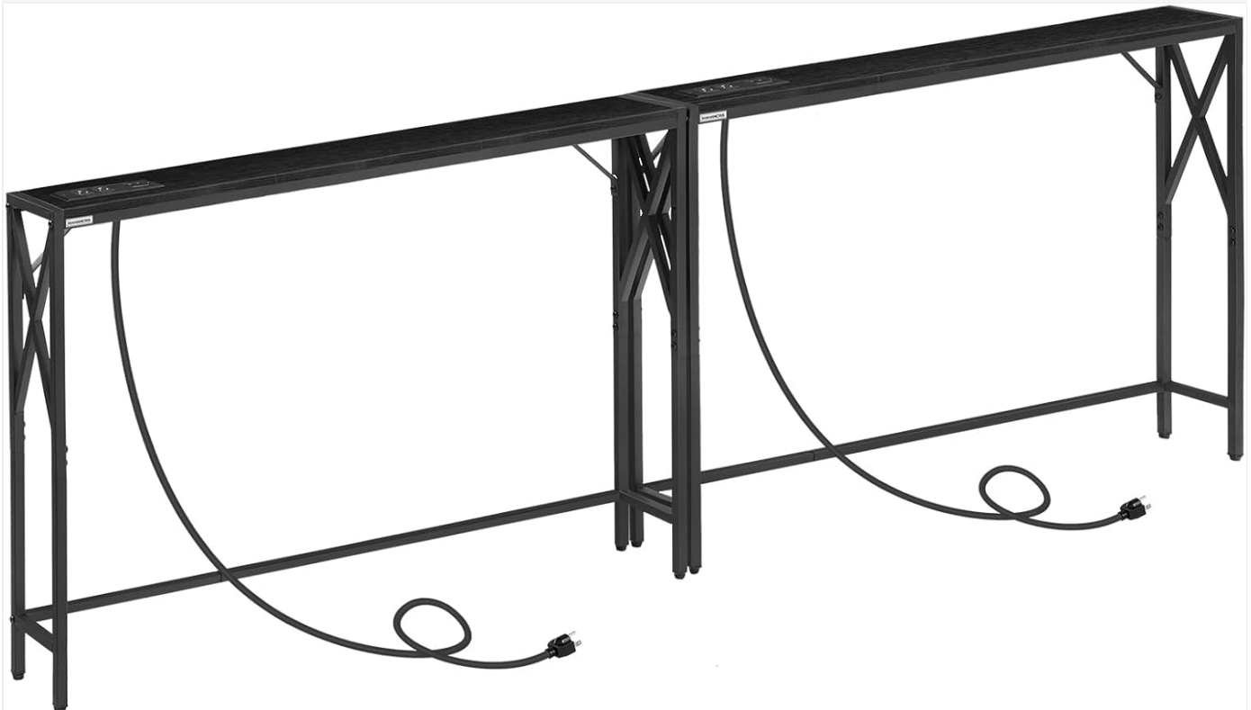
Image: Overview of the MAHANCRIS 2 Pack Sofa Table with Charging Station.

The MAHANCRIS 2 Pack Sofa Table with Charging Station is designed to provide convenient surface space and power access in narrow areas such as behind sofas, in entryways, or hallways. Its slim design and integrated charging features make it a practical addition to any living space.