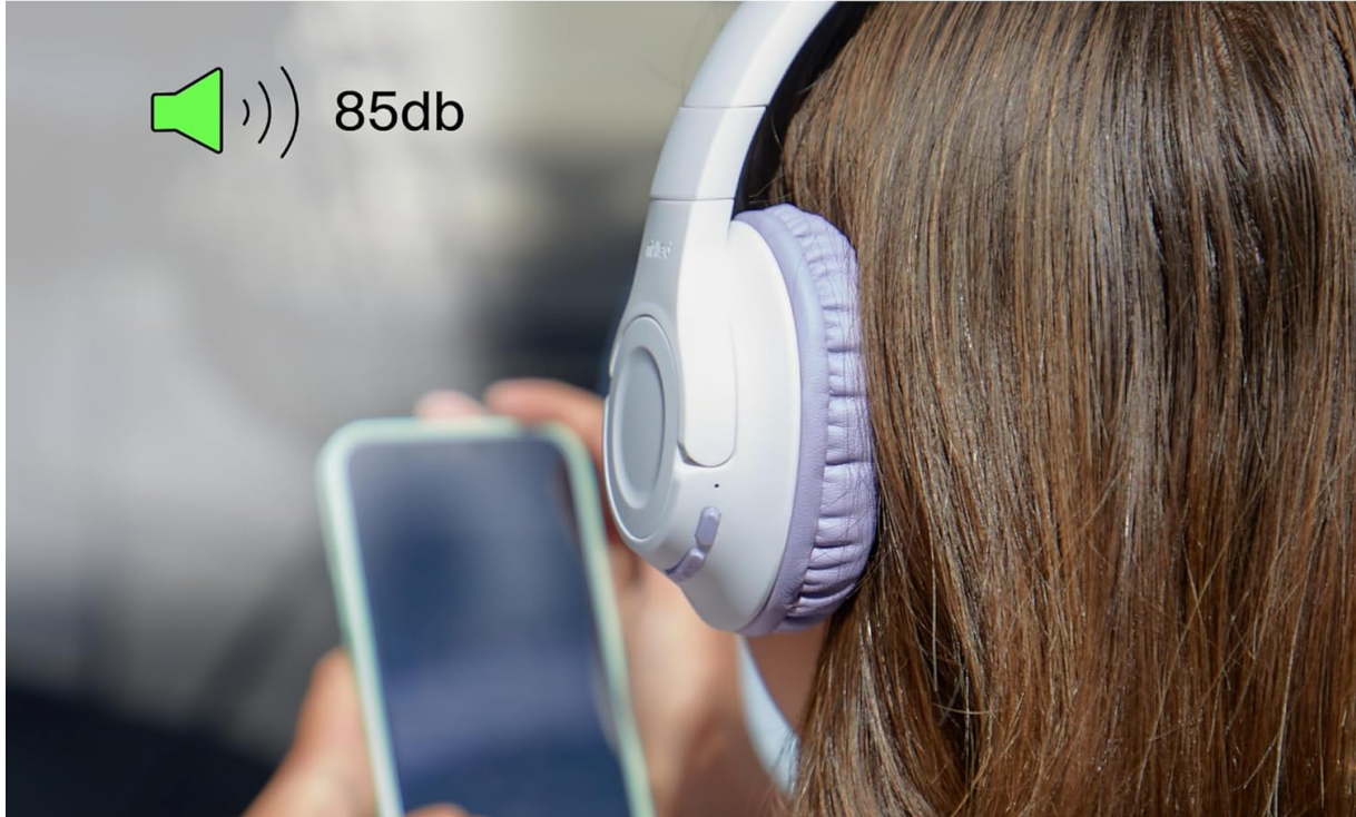
Image: A child wearing the headset, highlighting the 85dB safe listening volume feature.

A Safe Sound volume cap of 85 decibels protects sensitive hearing while kids listen, learn, and play.