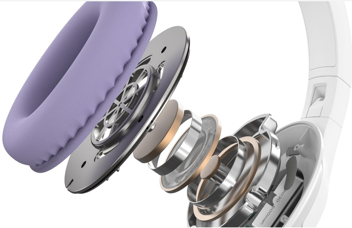
Image: An exploded view illustrating the 40mm drivers within the headset, designed for high-fidelity audio.

40mm drivers bring full, rich high-fidelity audio. Belkin Signature Sound features audio tuned specifically for kids.