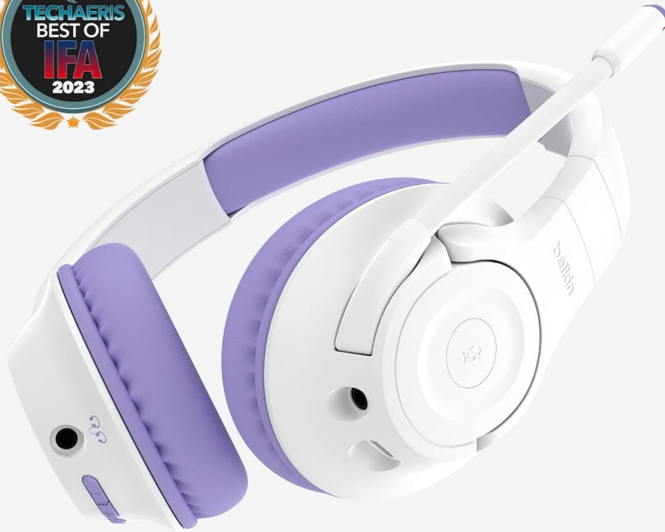
Image: The Belkin SoundForm Inspire Wireless Over-Ear Headset in lavender color.