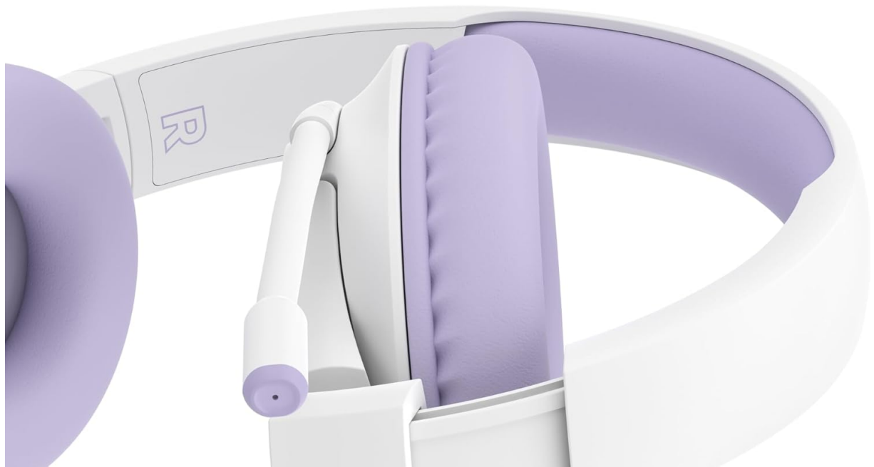
Image: Close-up of the headset's soft earcups and adjustable headband, designed for comfort and portability.

The soft, adjustable headband folds up for portability, and smaller ear cups fit better than adult-sized headphones. Polyurethane (PU) leather for the ear cushions makes cleaning easy.