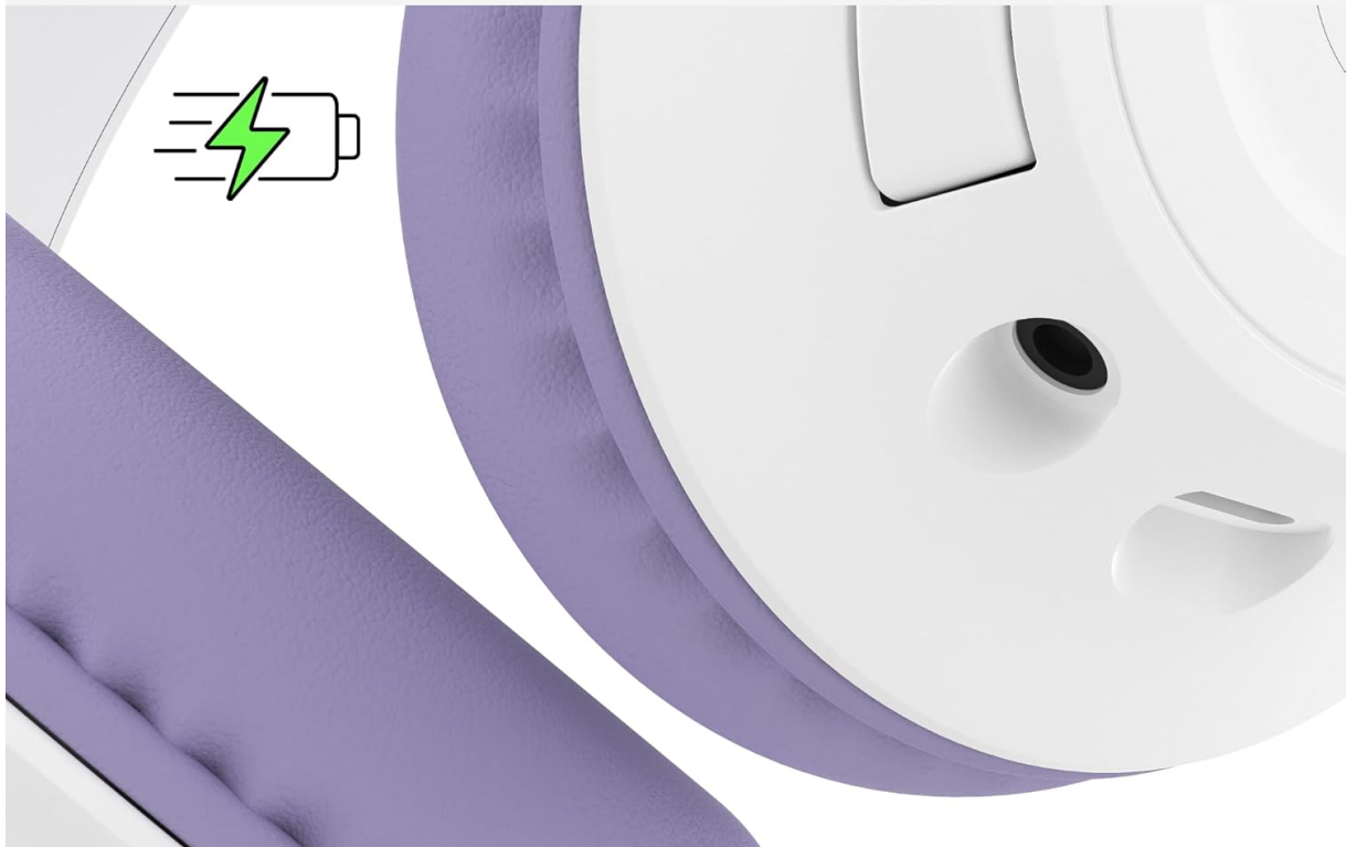
Image: Close-up view of the USB-C charging port on the headset.

Convenient USB-C port for fast charging and wired audio input.