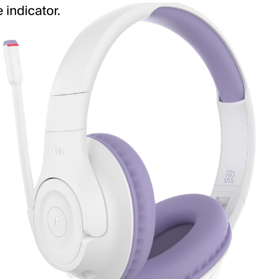
Image: The headset with its flip-up boom microphone, showing the LED mute indicator.