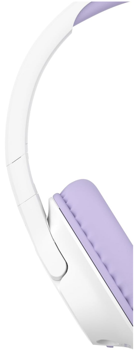
Image: The Belkin SoundForm Inspire headset shown with a smartphone, illustrating Bluetooth connectivity.