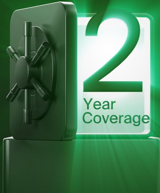
Image: Belkin's product protection graphic, indicating a 2-year coverage.