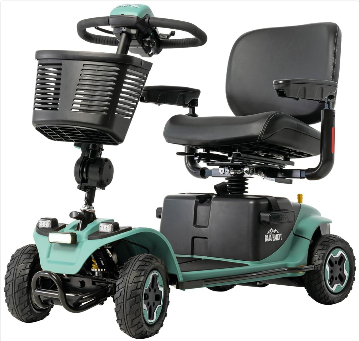
Figure 1: Fully assembled Pride Mobility Baja Bandit BA140 Mobility Scooter.