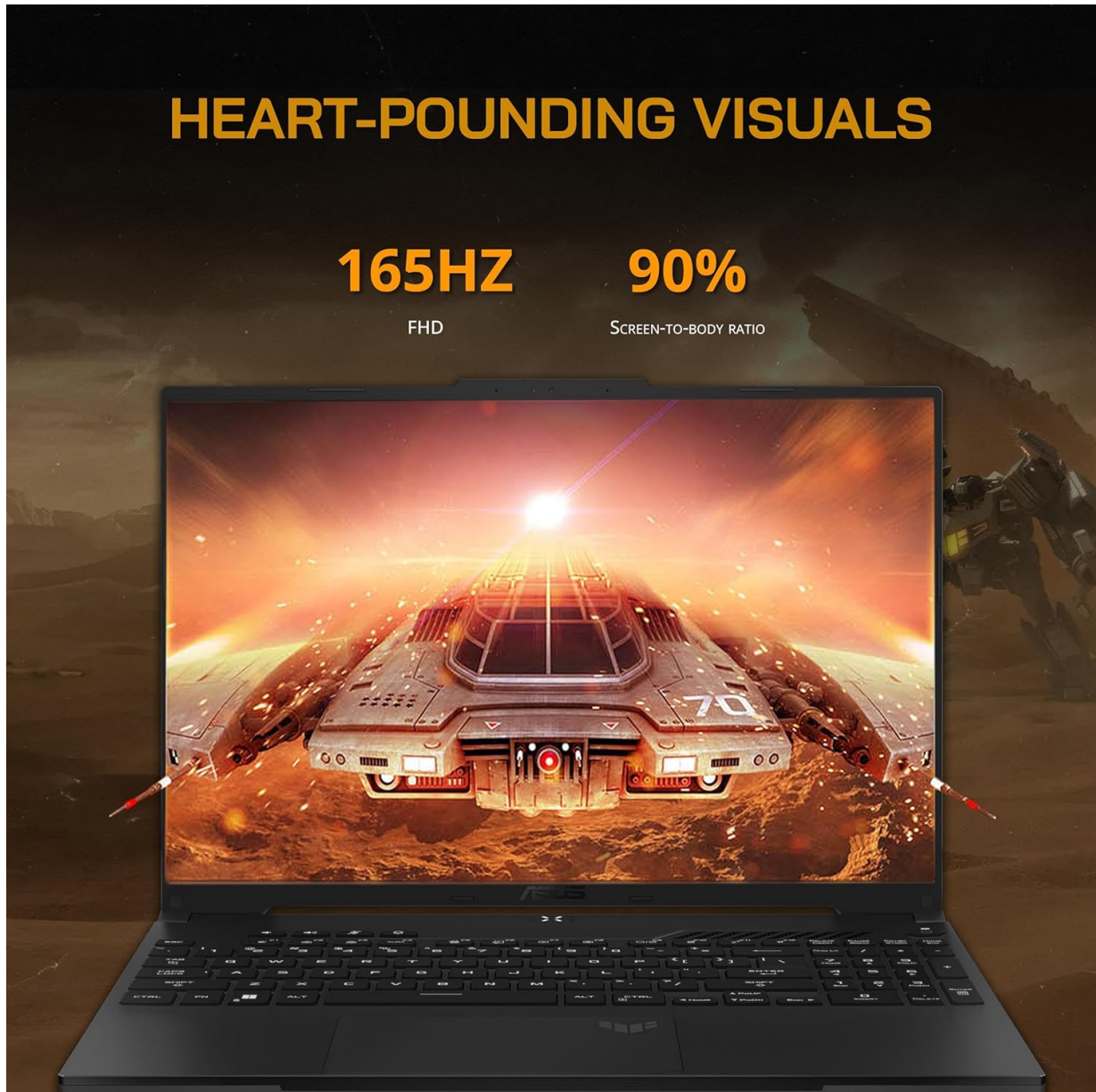
Image: The laptop screen highlighting its 165Hz FHD refresh rate and 90% screen-to-body ratio for heart-pounding visuals.

The 16-inch Full HD (1920x1080) display offers a 165Hz refresh rate, providing smooth visuals for gaming and multimedia. The display also features a high screen-to-body ratio for an immersive viewing experience.