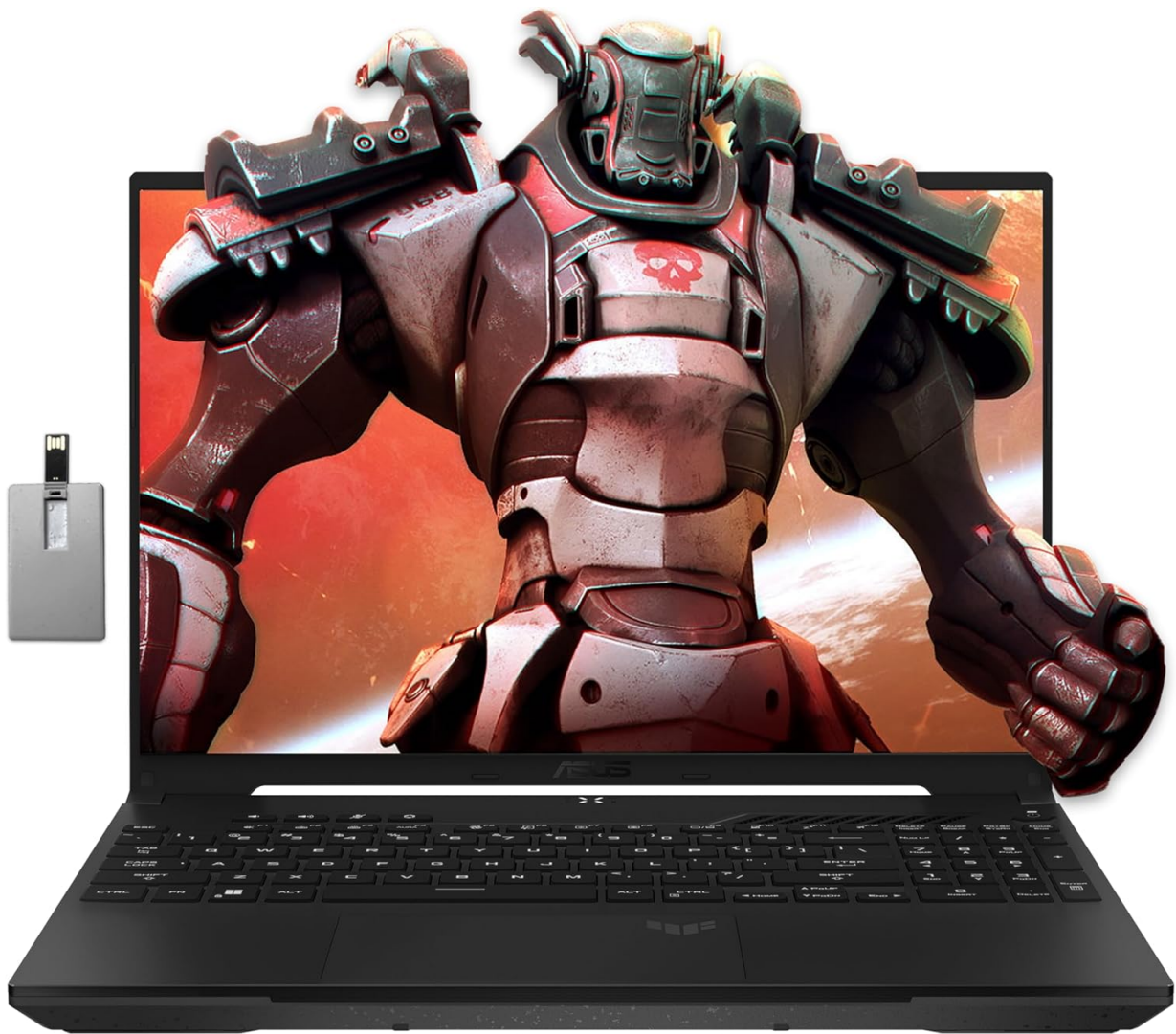
Image: The ASUS TUF A16 gaming laptop displaying a game character on its 16-inch screen.