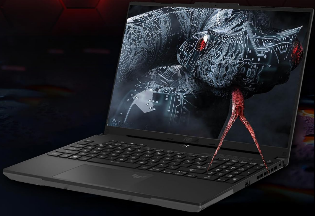
Image: The ASUS TUF A16 laptop showcasing its design and highlighting key specifications like AMD Ryzen 7 7735HS CPU, AMD Radeon RX7600S V8G GPU, 16GB DDR5 RAM, 512GB PCIe SSD, and 16" FHD display.