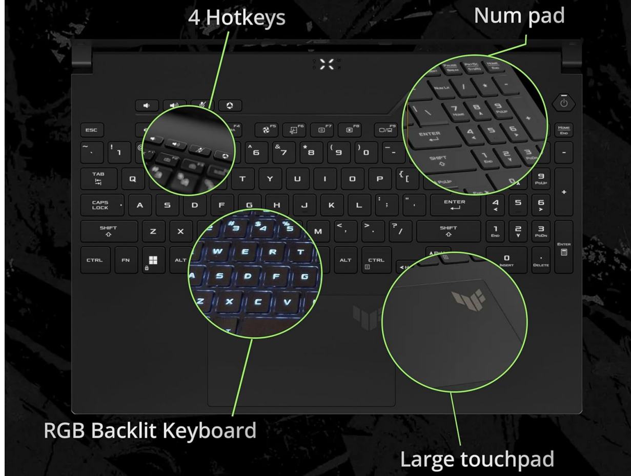
Image: A close-up of the ASUS TUF A16 keyboard, showing RGB backlighting, dedicated hotkeys, a numeric pad, and a large touchpad.

Triggering earlier means faster, effortless inputs with greater accuracy.