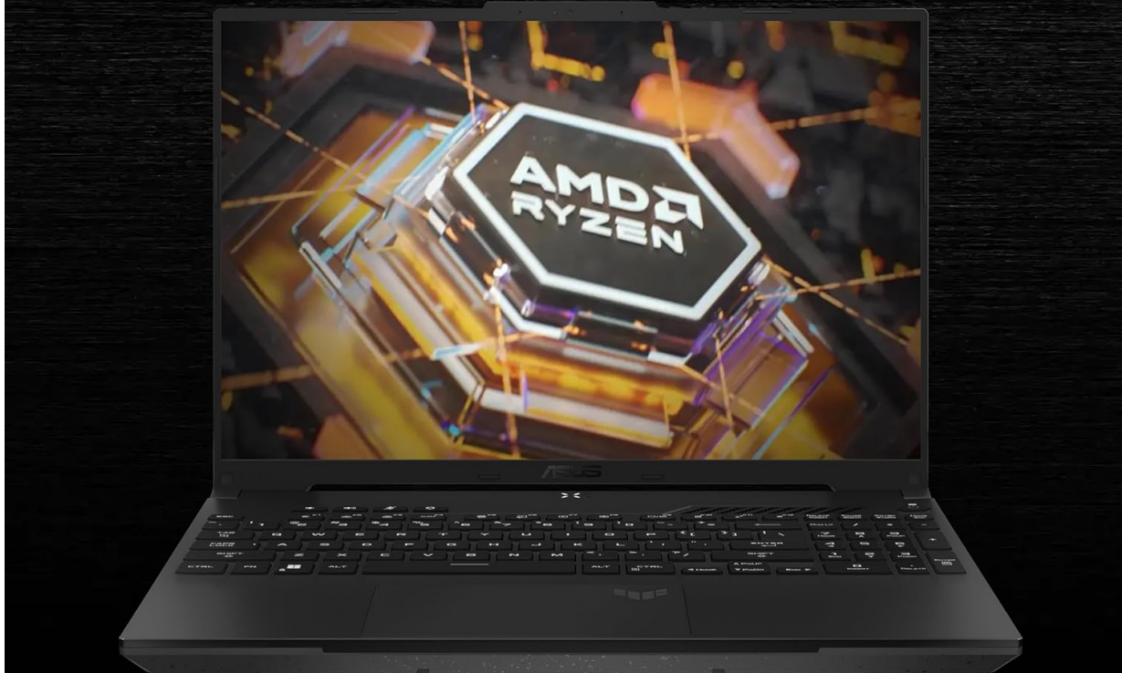
Image: The laptop screen displaying "Ultimate Immersion" and detailing the AMD Ryzen 7 7735HS CPU and AMD Radeon RX7600S V8G GPU.

AMD Radeon RX7600S V8G for an ultrafast GPU to fuel your games.