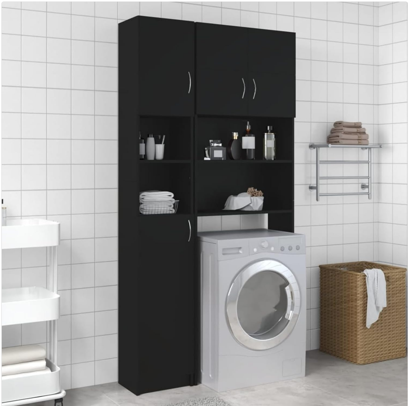
Image 1.1: The ZEYUAN Bathroom Cabinet, shown here in a bathroom environment, demonstrating its potential for integration with other furniture like a washing machine and additional storage units.