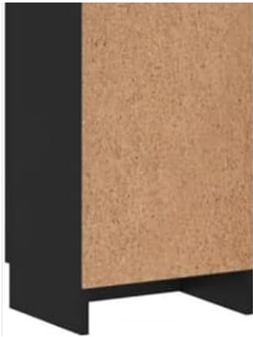
Image 3.1: Rear view of the ZEYUAN Bathroom Cabinet, showing the particle board construction and the general structure before assembly.