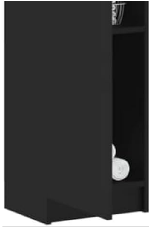
Image 5.1: The ZEYUAN Bathroom Cabinet with its doors open, revealing the internal shelving and demonstrating its capacity for storing various bathroom essentials.