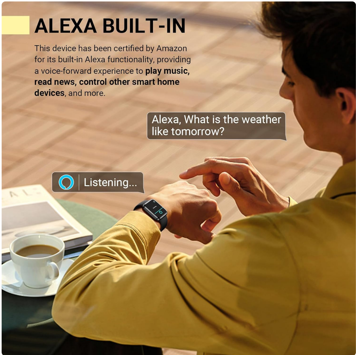
Image: A user interacting with the smartwatch, demonstrating the Alexa voice assistant feature by asking about the weather.