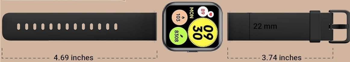
Image: The smartwatch display, highlighting its 1.8-inch size and showing typical information like time, steps, and heart rate. Also includes wrist size compatibility.