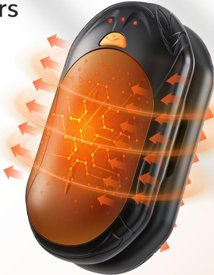
Image: Two UNIHAND AI Smart Rechargeable Hand Warmers illustrating their ability to be used separately or combined for enhanced warmth, highlighting features like 360° heating and rapid heating.