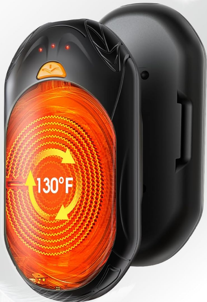
Image: This graphic illustrates the three distinct heat settings of the hand warmers, showing the temperature ranges and approximate duration for each level.