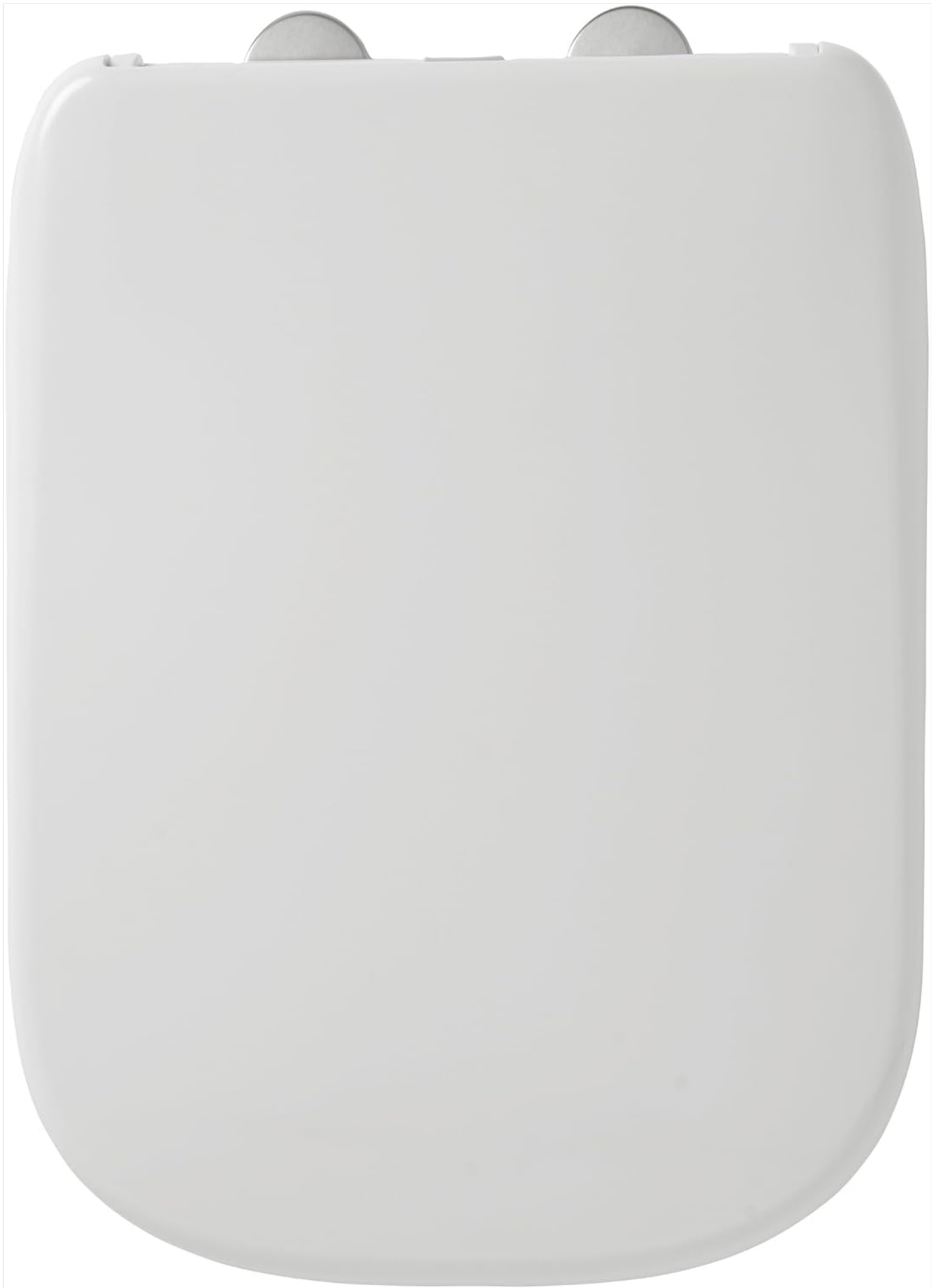
Figure 1: Top view of the BEMIS Teramo Rectangular Toilet Seat in closed position.