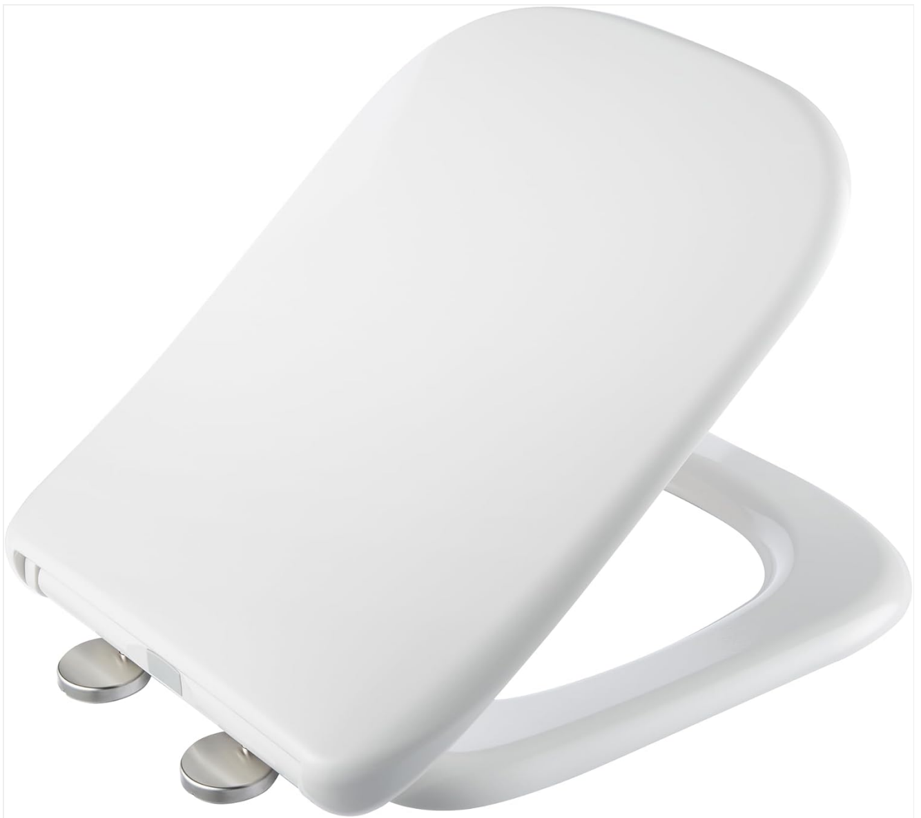
Figure 4: Angled view of the BEMIS Teramo toilet seat, demonstrating its sleek design.