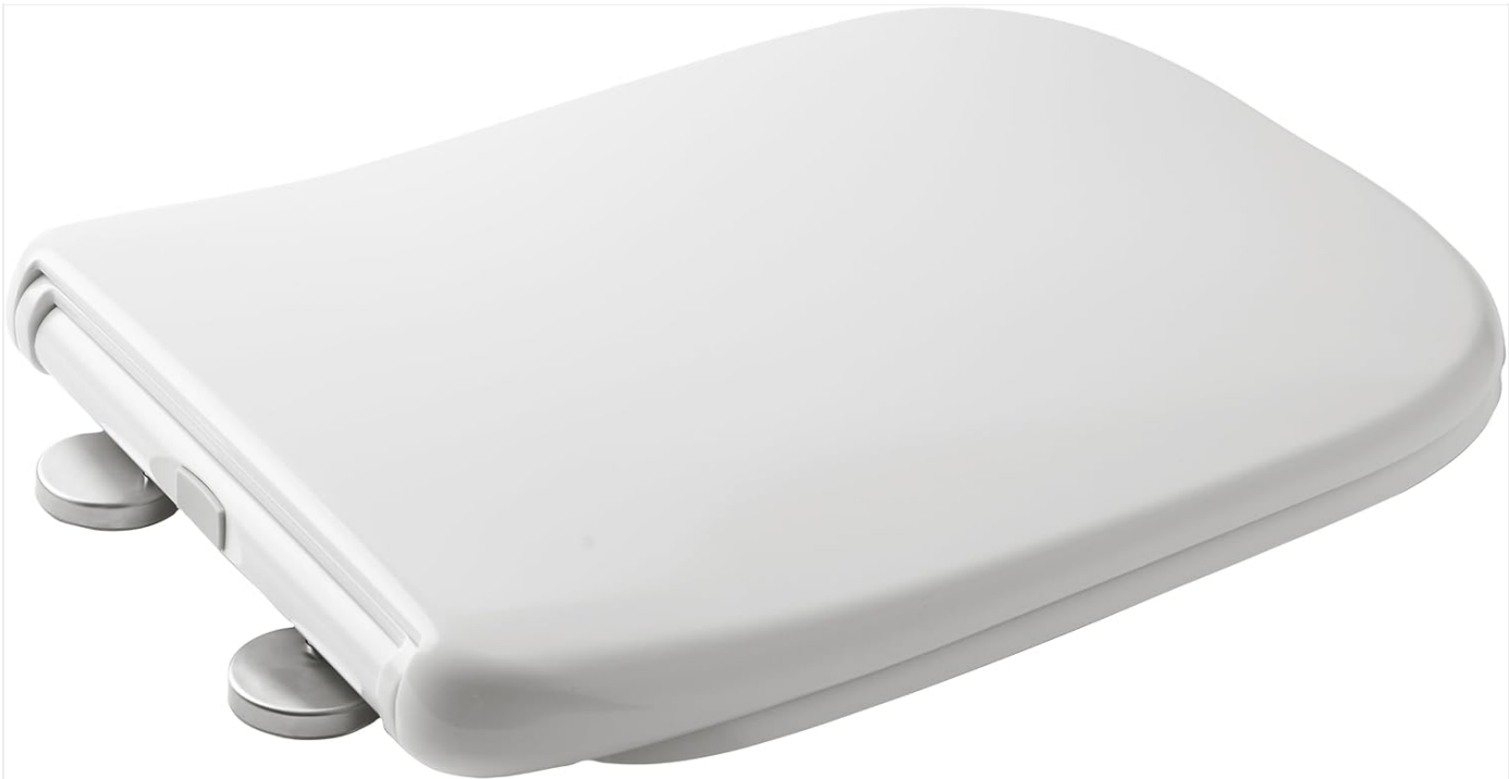
Figure 5: Side view of the BEMIS Teramo toilet seat, illustrating its low profile when closed.

The BEMIS Teramo toilet seat is equipped with an integrated soft-close mechanism. To activate, simply push the lid or seat down gently. The soft-close hinges will automatically lower the lid and seat slowly and quietly, preventing slamming and reducing wear and tear. Do not force the lid or seat down, as this can damage the soft-close mechanism.