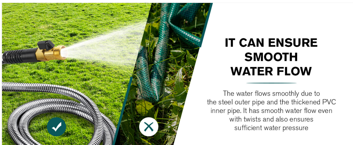
Figure 3.1: The pressure-resistant connector features a 3/4" top grade connector, a stainless steel protective outer pipe, and a thickened PVC inner tube for durability and smooth water flow. An ON/OFF switch is integrated for convenience.

Enlarged diameter of outlet to allow larger water flow