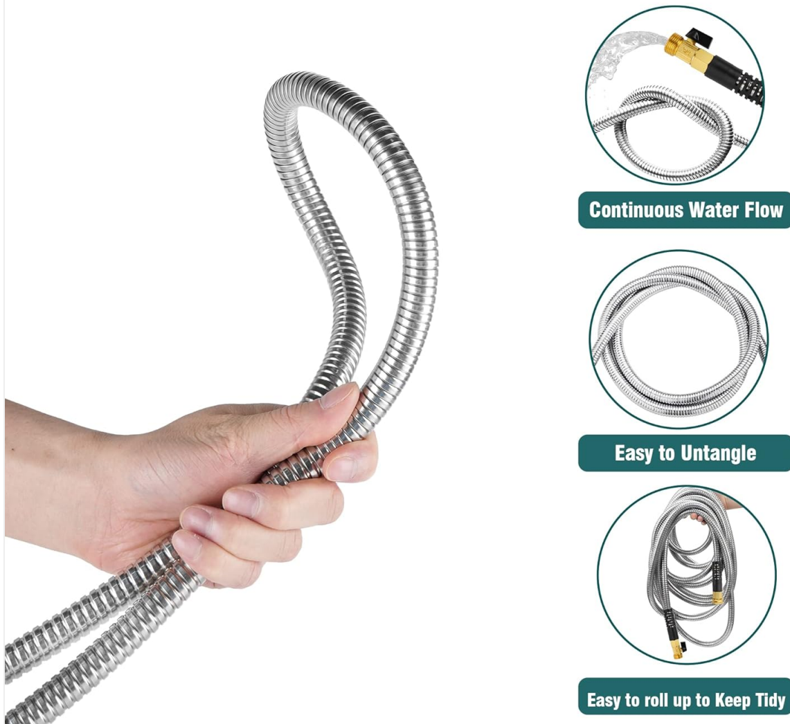
Figure 5.1: The Yofidra hose is designed to be kink-free and flexible, making it easy to untangle and roll up for tidy storage.