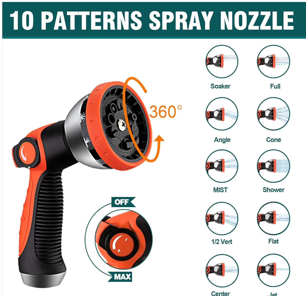
Figure 4.1: The included spray nozzle offers 10 distinct spray patterns, easily selected by rotating the head. It also features a switch to control water flow and an extended grip for comfortable use.