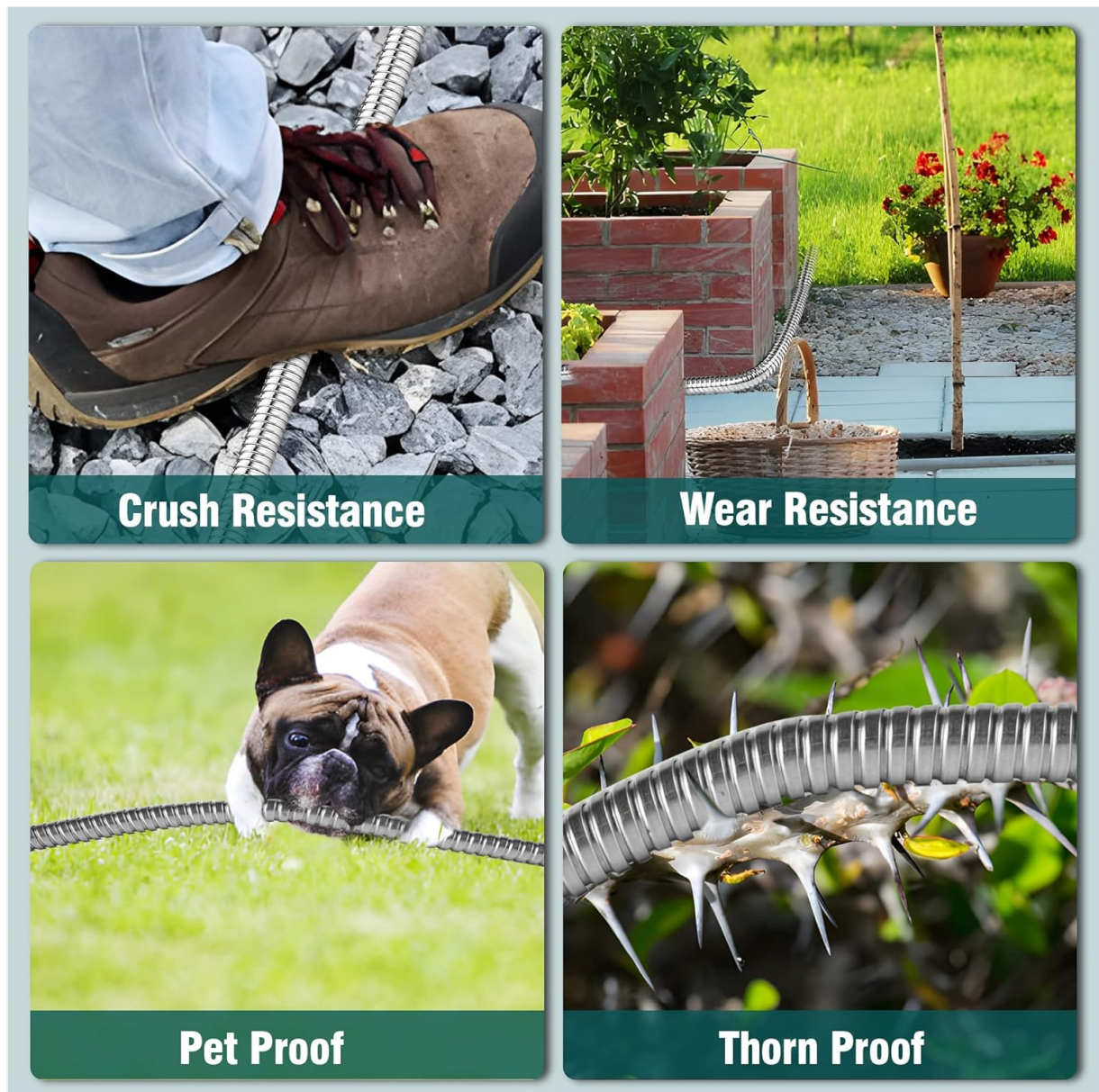
Figure 6.1: The Yofidra hose is designed for crush resistance, wear resistance, to be pet proof, and thorn proof, enhancing its durability in various garden environments.