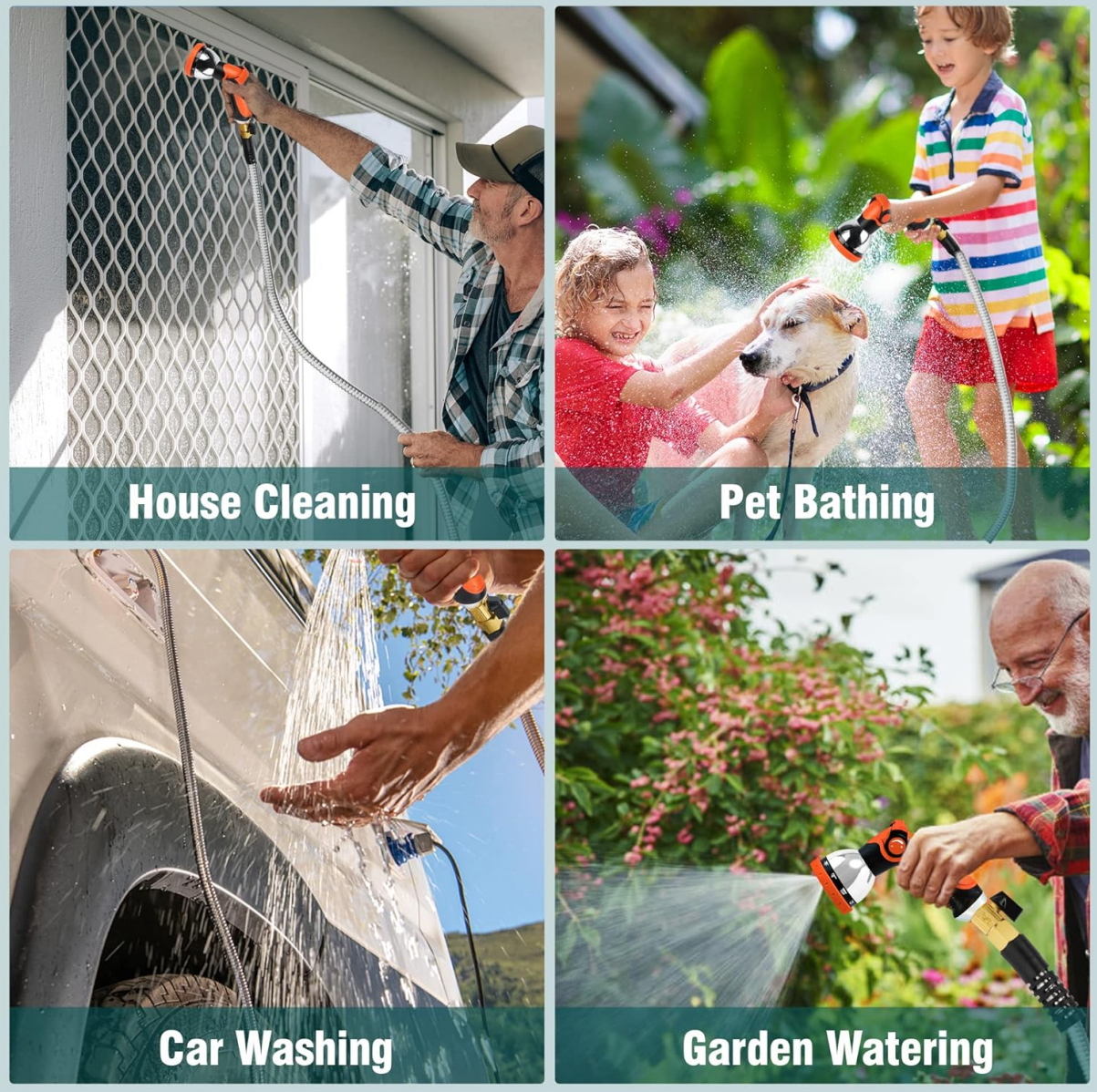
Figure 4.2: The Yofidra garden hose is suitable for various tasks including house cleaning, pet bathing, car washing, and garden watering.