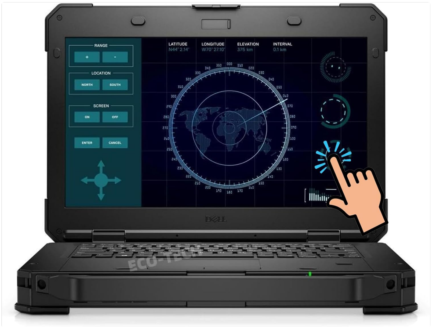
Figure 6.2: The Dell Latitude 5424 in an open position, highlighting its 14-inch FHD touchscreen and ruggedized chassis.