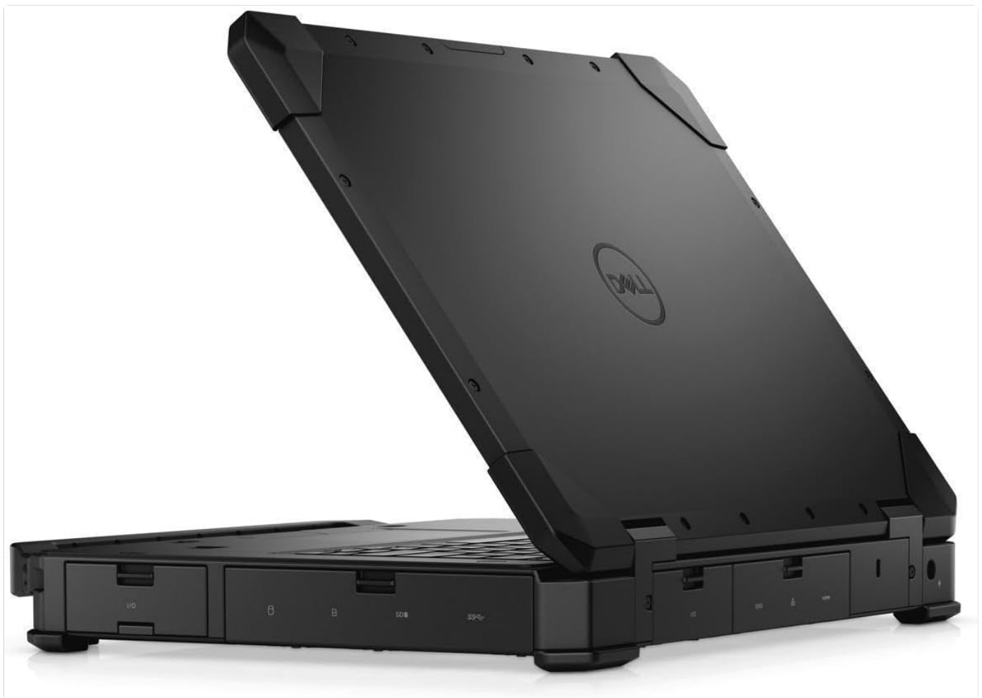
Figure 4.1: Rear view of the Dell Latitude 5424, showcasing its robust, sealed casing designed for durability.