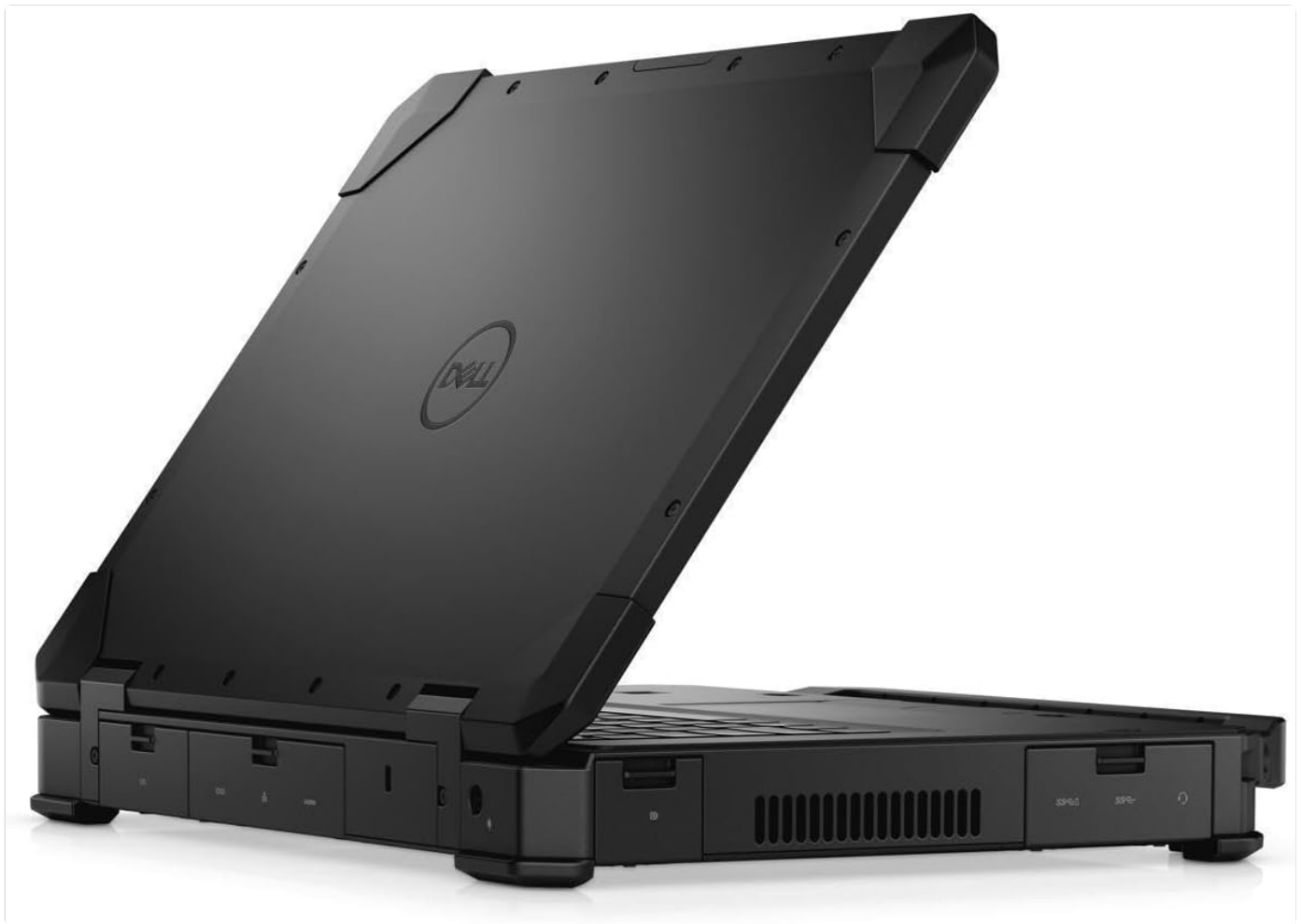
Figure 2.1: Rear view of the Dell Latitude 5424, showing the power input port (14) and other connectivity options.