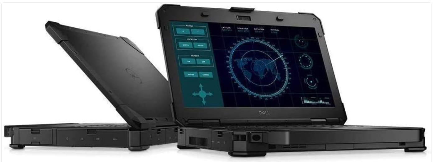
Figure 6.1: The Dell Latitude 5424's robust construction is evident from various angles, designed for extreme durability.