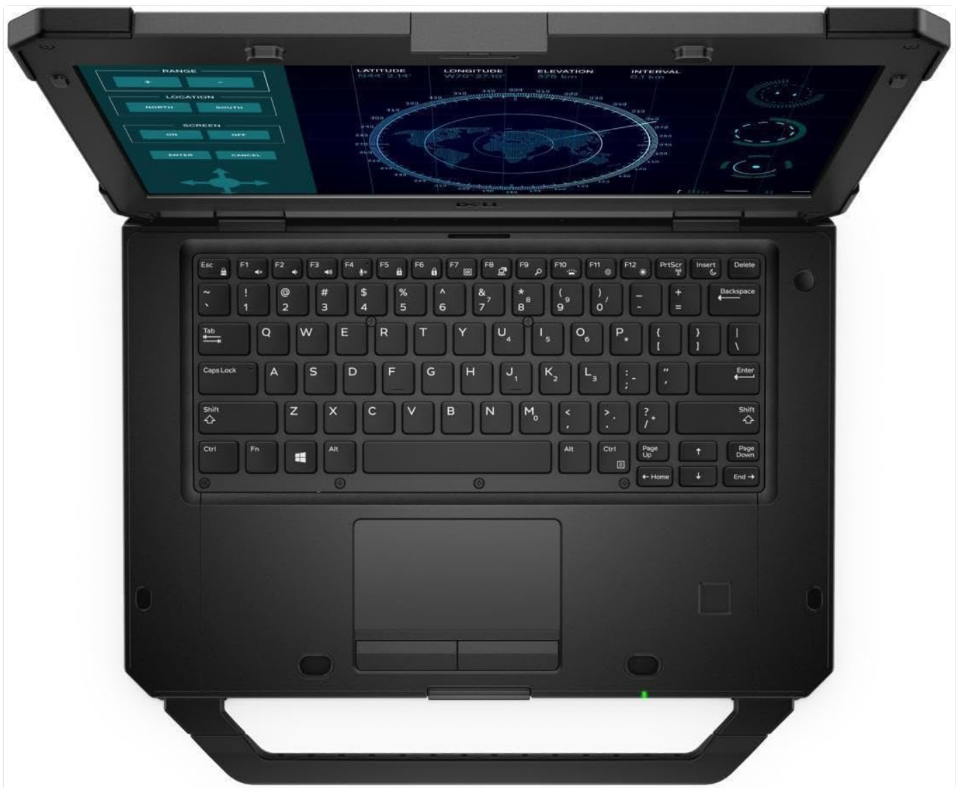
Figure 3.1: Top-down view of the Dell Latitude 5424, highlighting the full-size keyboard and responsive touchpad.