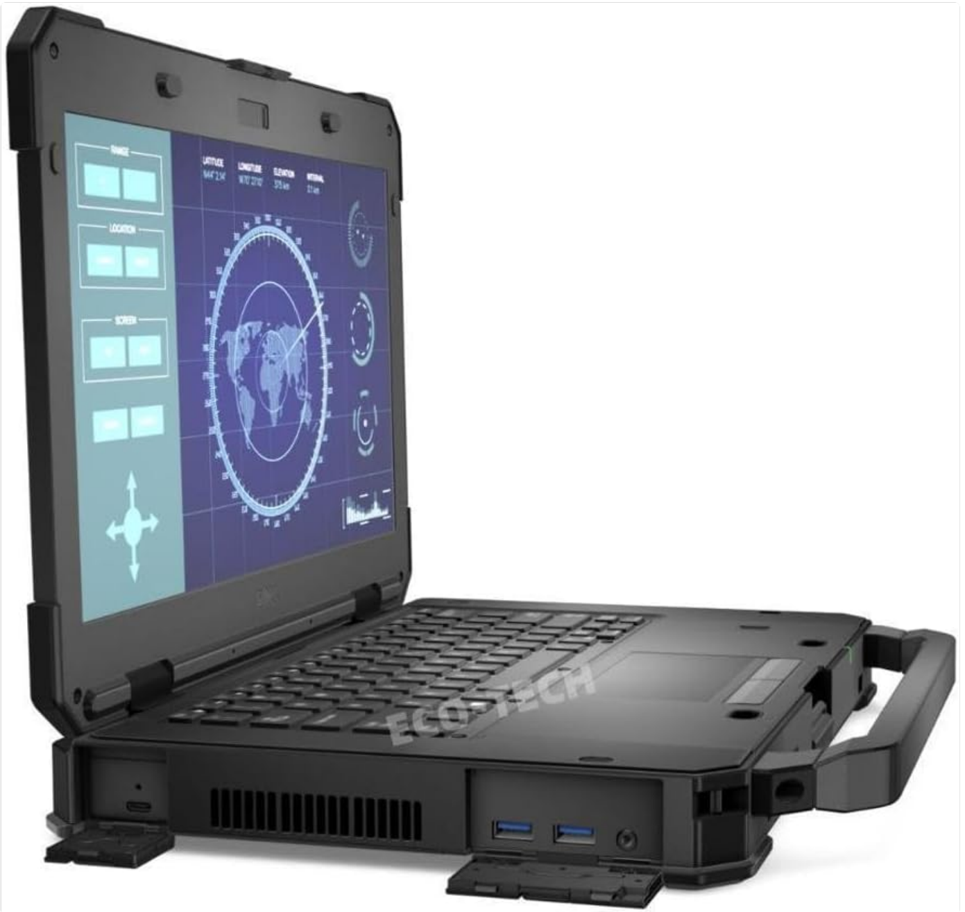
Figure 3.2: Side view of the Dell Latitude 5424 with protective port covers open, revealing USB and other connectivity options.