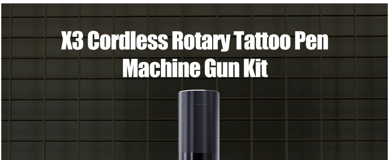
Image: Overview of the Dragonhawk X3 Wireless Tattoo Gun Kit, highlighting its sleek design.

This instruction manual provides detailed guidance for the Dragonhawk X3 Wireless Tattoo Gun Kit. Designed for both beginners and experienced artists, this rotary machine offers stable performance for various tattooing styles, including lining and shading. Please read this manual thoroughly before use to ensure proper operation, safety, and longevity of your device.