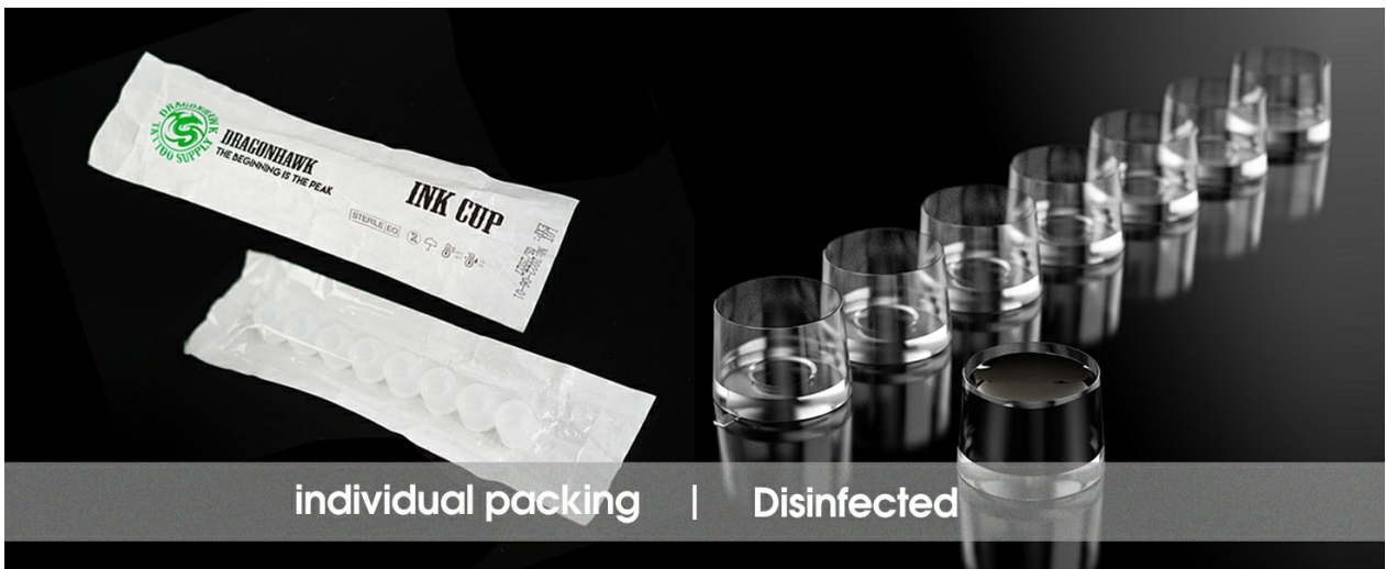
Image: Individually packaged and disinfected ink cups, ensuring hygiene.