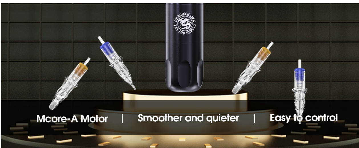
Image: Illustration of the M-core A coreless motor, emphasizing its smooth and quiet operation within the tattoo machine.