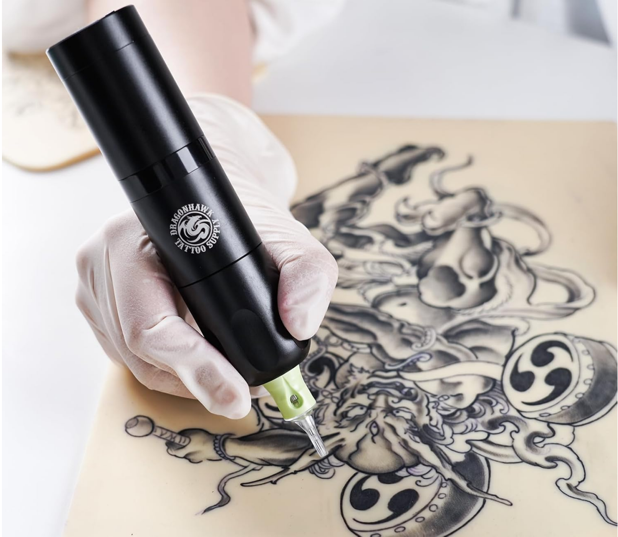
Image: The Dragonhawk X3 tattoo pen being used for shading on practice skin, showcasing its versatility.