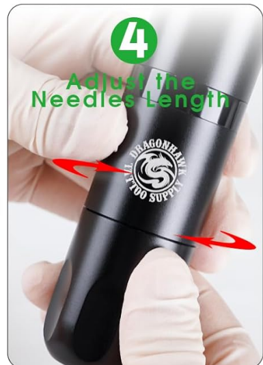
Image: Visual guide showing the four main steps for setting up the tattoo pen: installing needles, turning on power, adjusting voltage, and adjusting needle length.