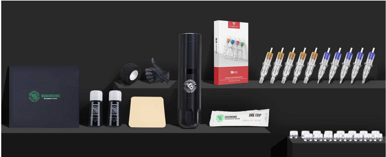
Image: All components included in the Dragonhawk X3 Wireless Tattoo Gun Kit, laid out for inspection.