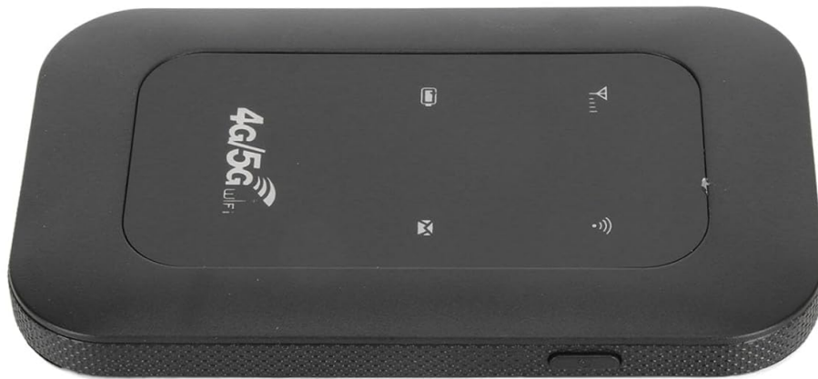
Image: The GOWENIC H806 Mobile WiFi Hotspot providing internet connectivity for a user working on a laptop and smartphone.

Simply insert a Micro SIM card (not included) and connect to WiFi on your cell phone, laptop, desktop or tablet.