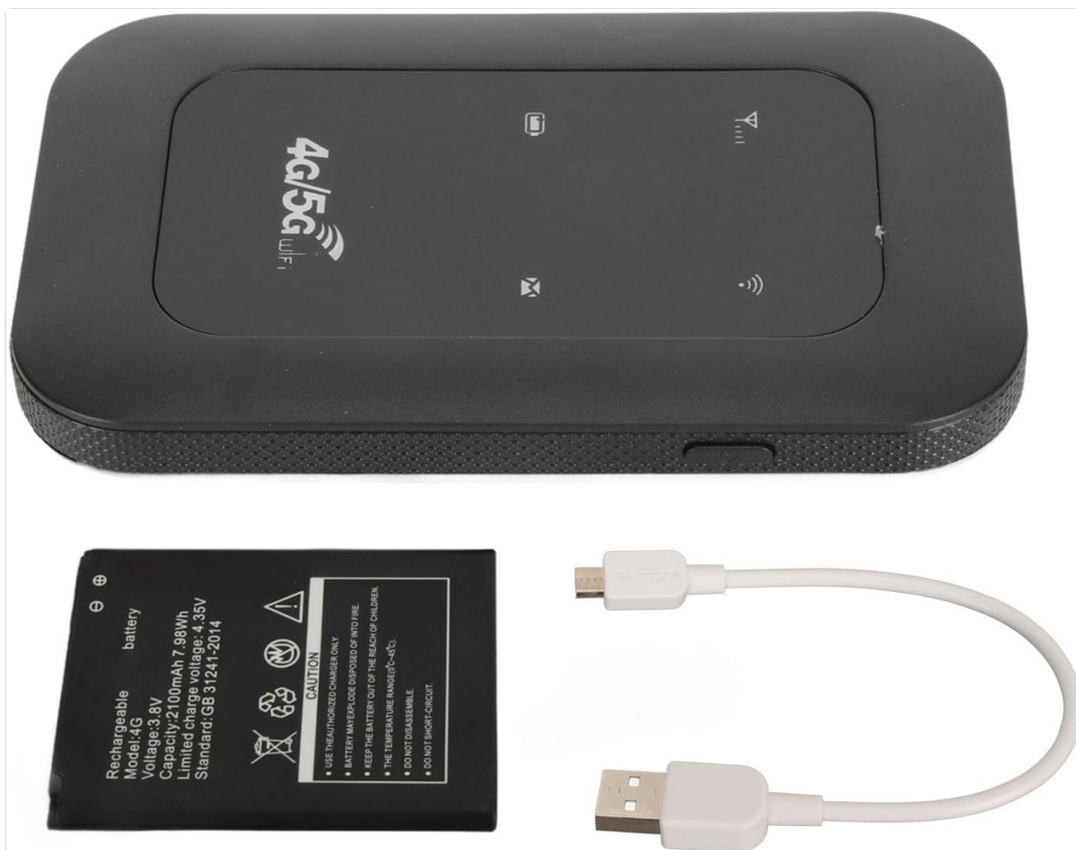
Image: Contents of the GOWENIC H806 package, including the router, battery, and charging cable.