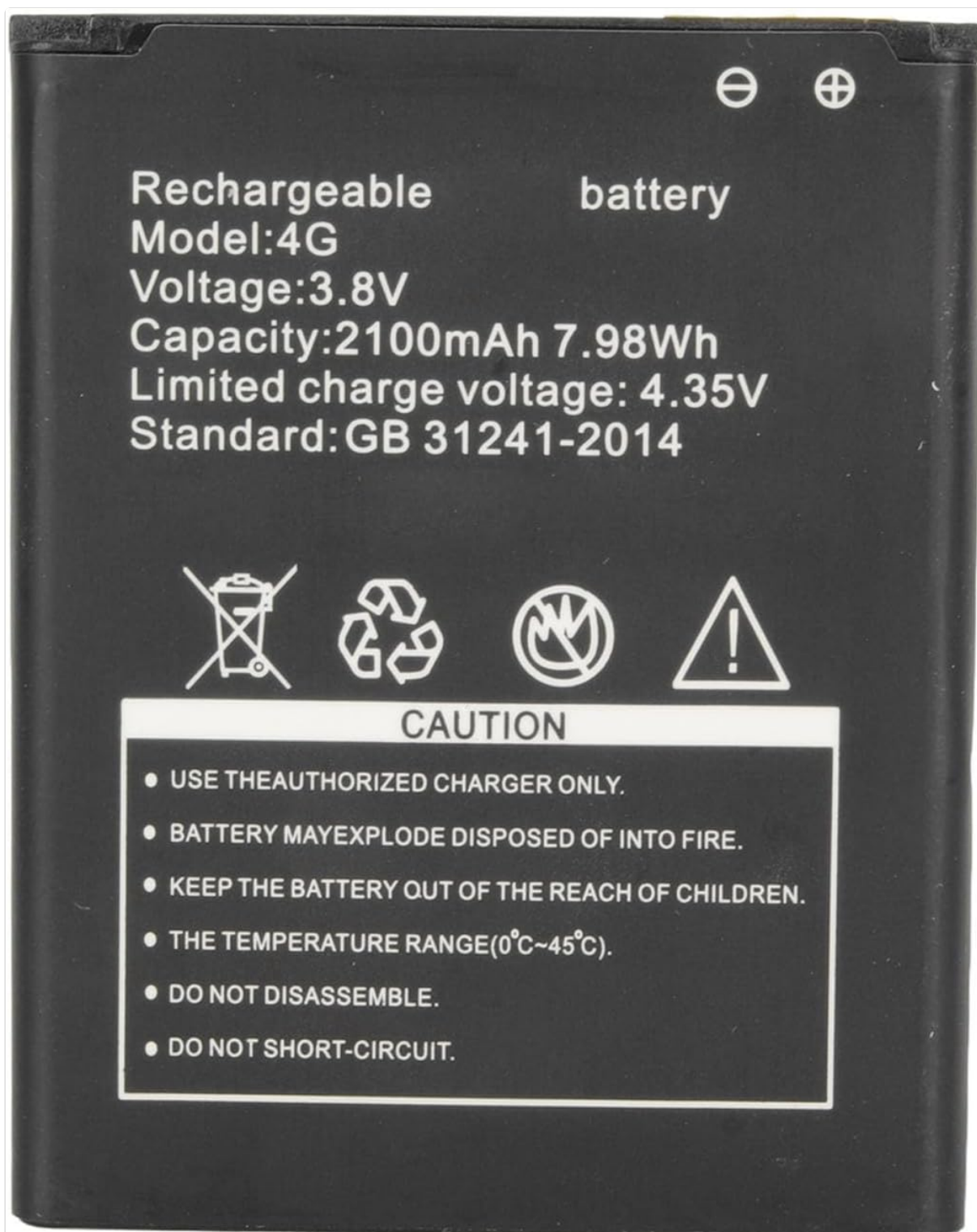
Image: The 2100mAh lithium battery for the GOWENIC H806, displaying important safety warnings and specifications.