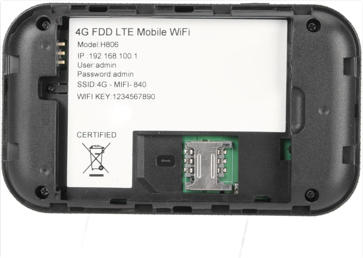
Image: Internal view of the GOWENIC H806, highlighting the Micro SIM card slot and default network information.