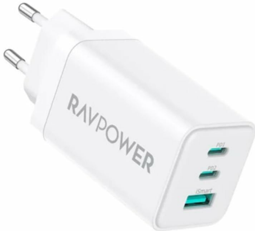
Image: The RAVPower RP-PC172 charger plugged into a wall outlet, demonstrating its 65W power delivery to a MacBook Pro. This illustrates the compact design and ease of connection.