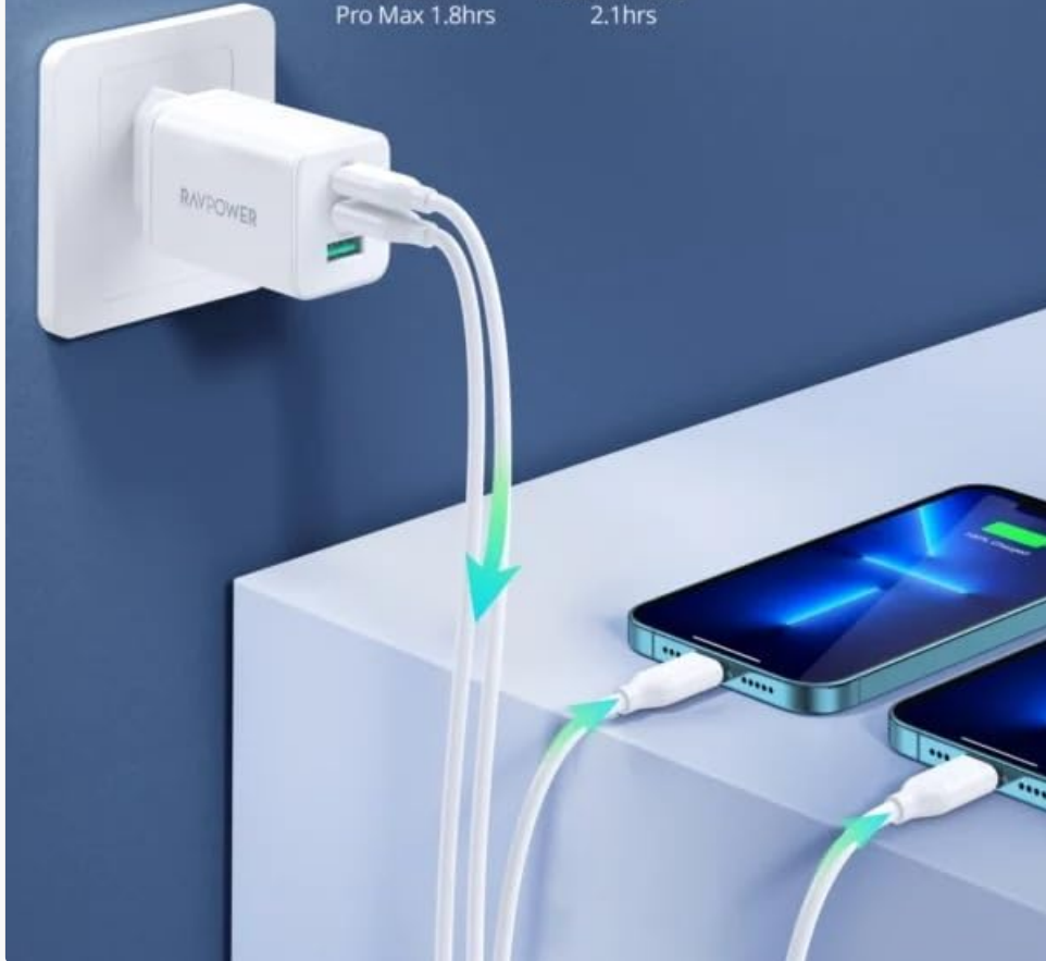
Image: A visual representation of the RAVPower RP-PC172 charger's wide compatibility, detailing compatible devices for both USB-C and USB-A ports, including laptops, tablets, and smartphones.