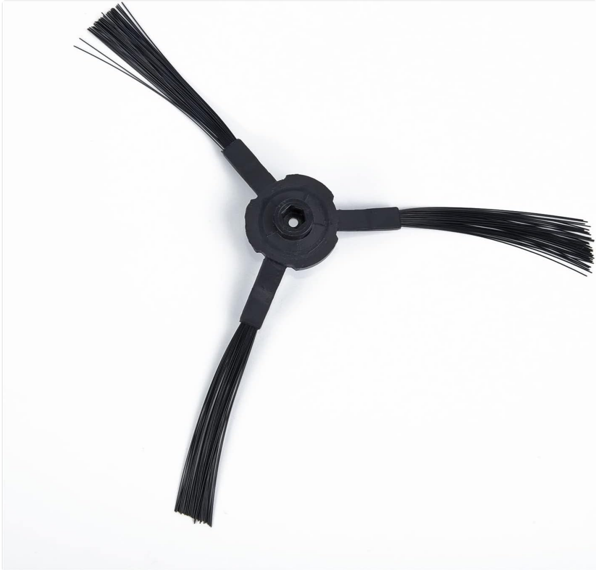
Figure 3.1: A single three-armed side brush, ready for installation. Note the central mounting point for attachment to the robot vacuum.