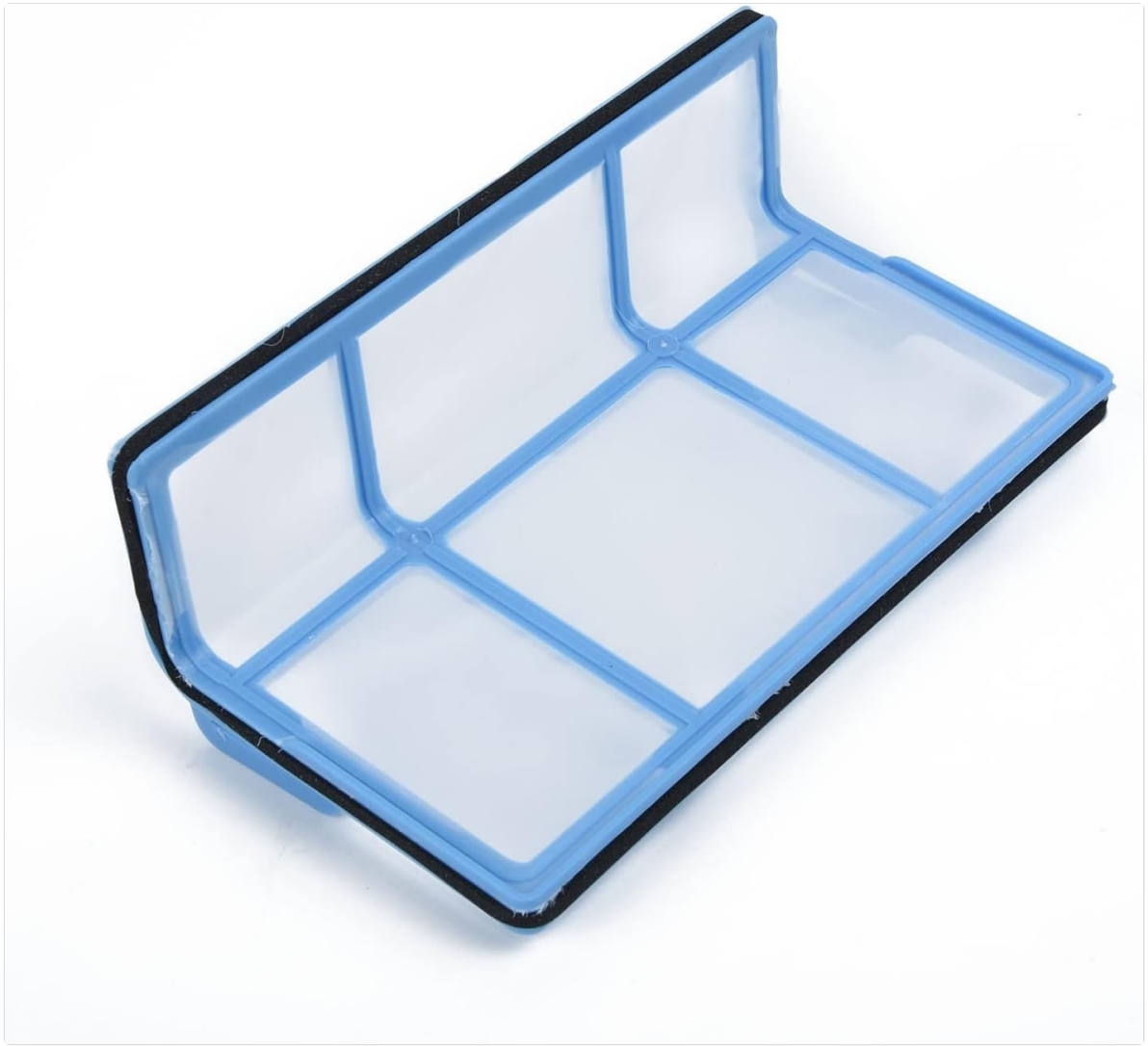
Figure 2.2: A rectangular HEPA filter with a blue frame and white pleated material. This filter is responsible for trapping fine dust particles, pet dander, and allergens, contributing to cleaner air.