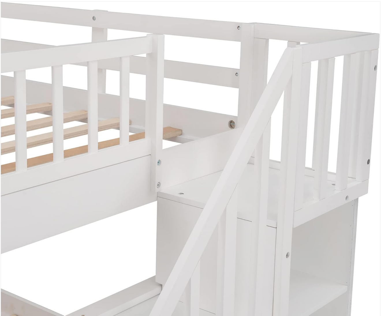
Image 5.2: A detailed view of the bunk bed's staircase, highlighting the four open storage compartments built into its side.