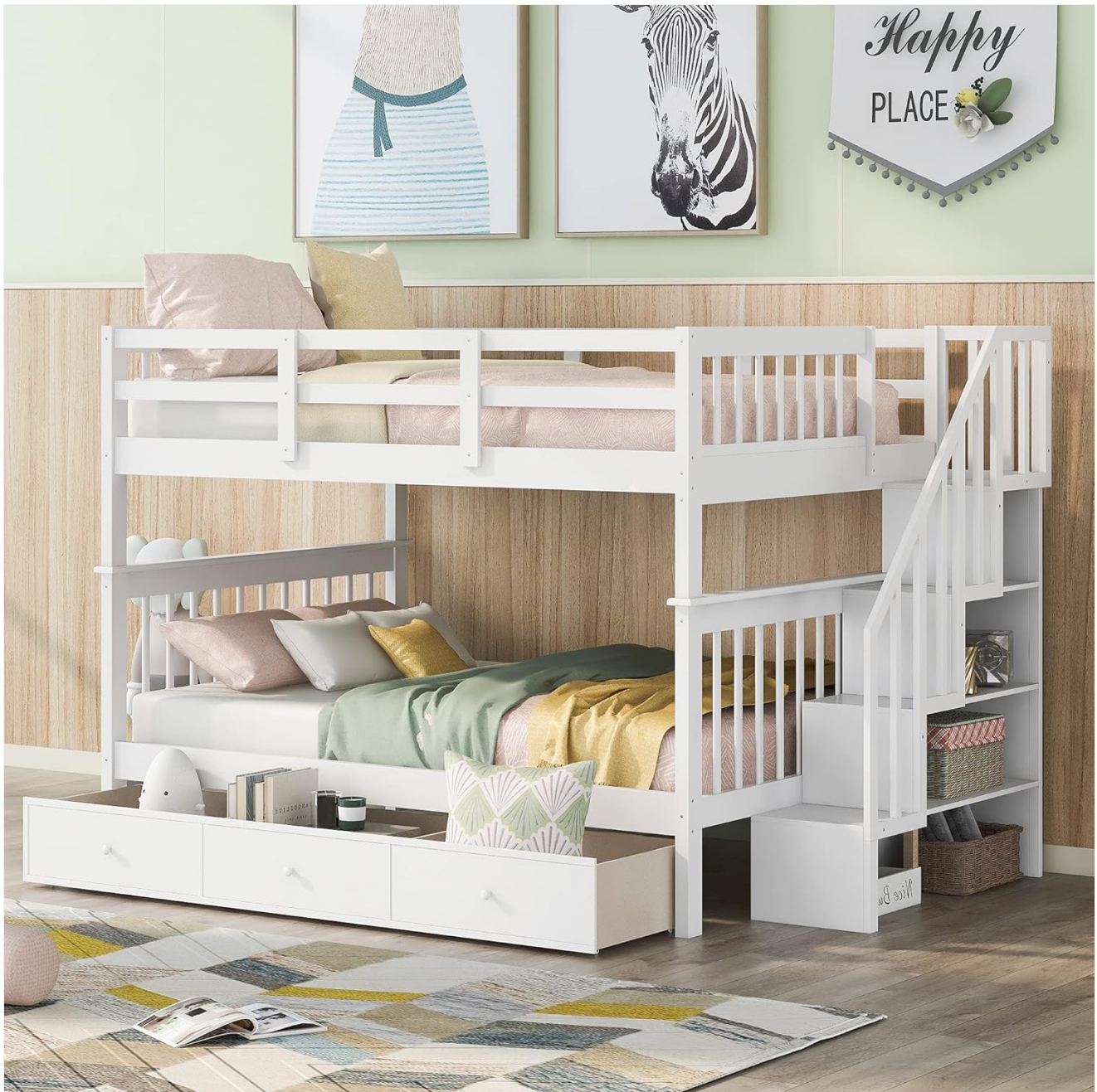
Image 1.1: The Harper & Bright Designs Full Over Full Bunk Bed in white, showcasing the integrated staircase with shelves and under-bed storage drawers.