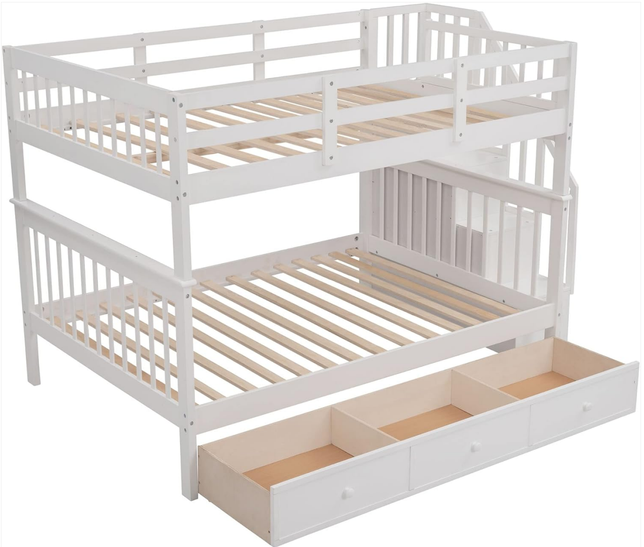
Image 5.1: The bunk bed with its three under-bed storage drawers fully extended, demonstrating the ample storage space available.