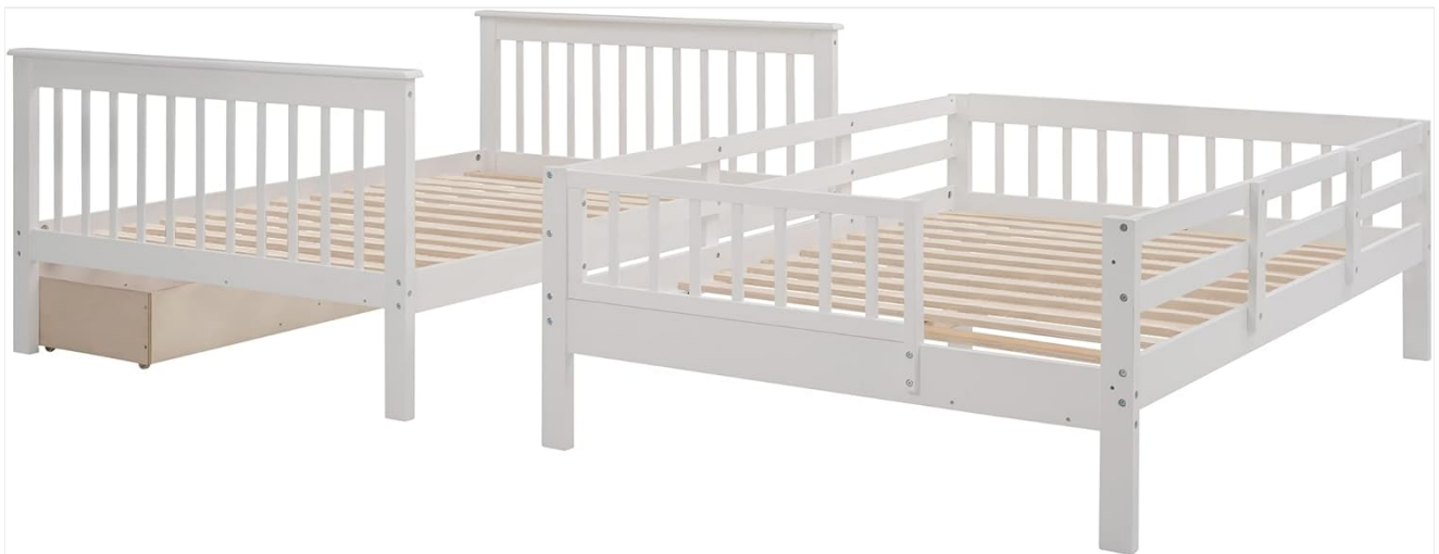
Image 4.2: The bunk bed disassembled into two separate full-size beds, demonstrating its versatile configuration options.