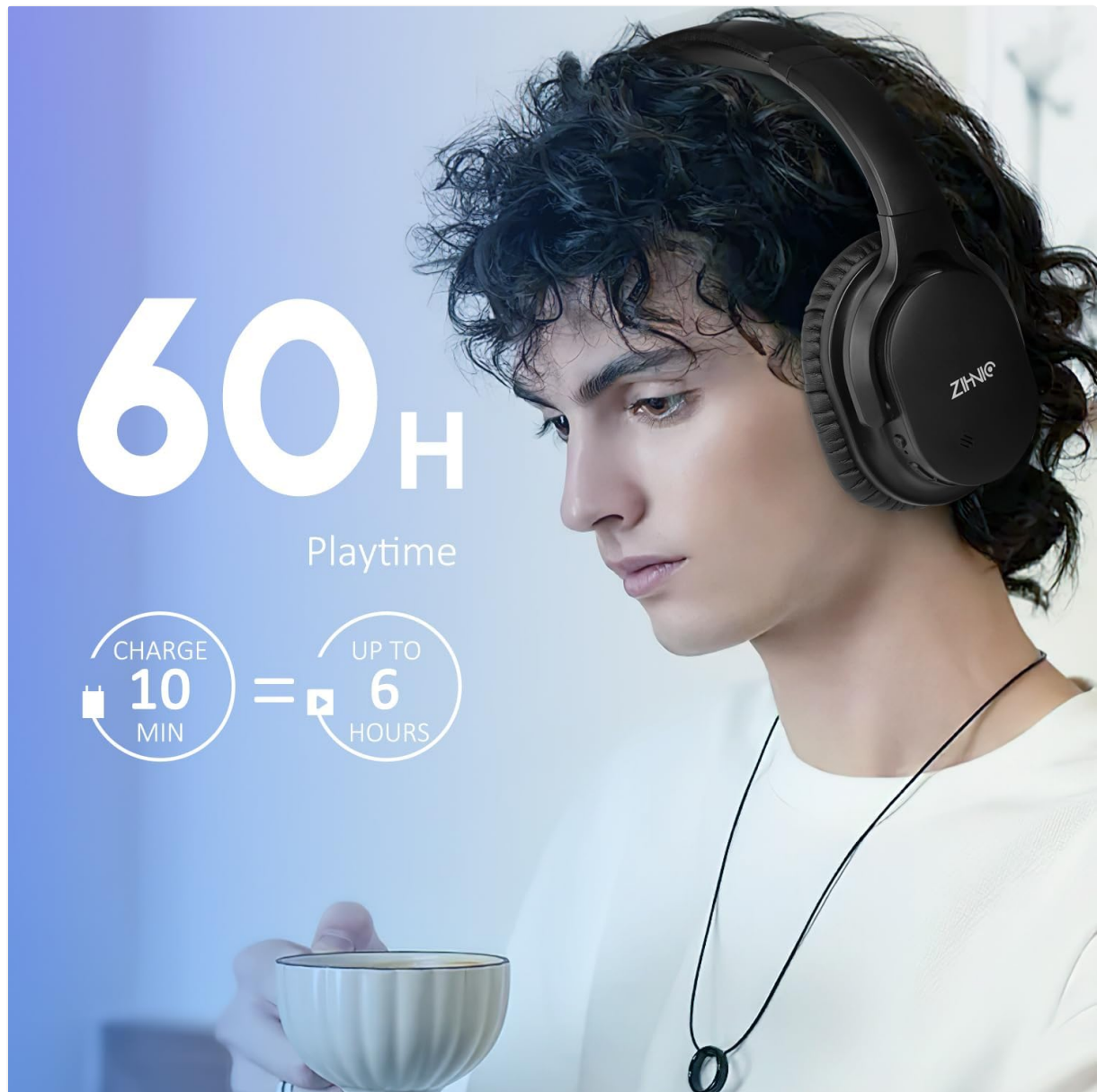
Figure 4.1: ZIHNIC WH-920 headphones illustrating long playtime and fast charging.