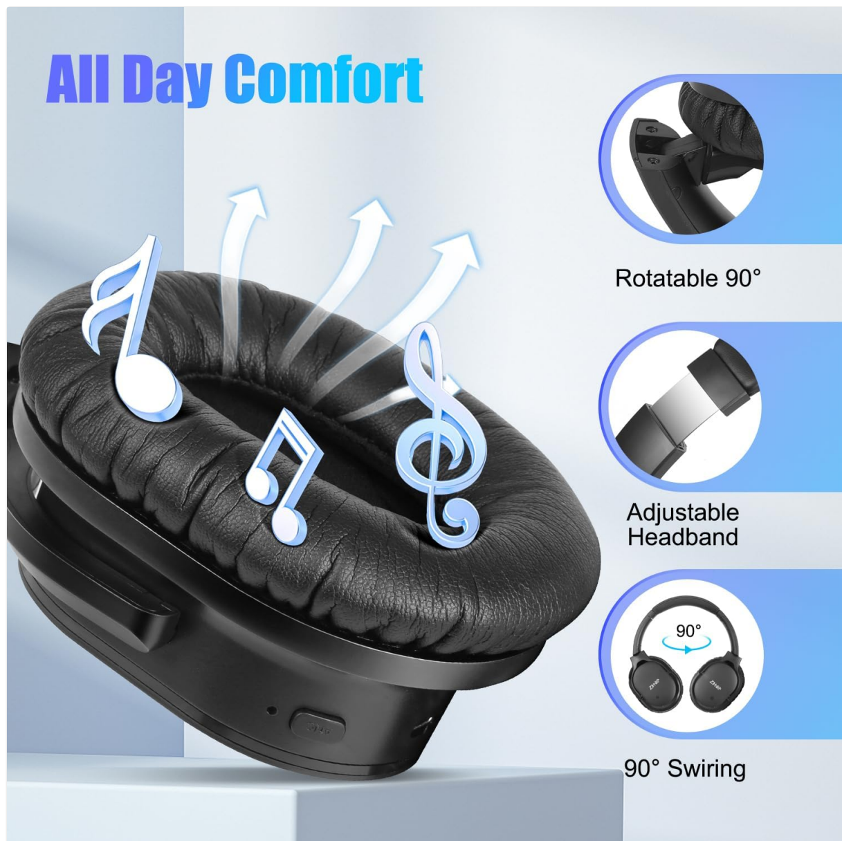
Figure 5.2: ZIHNIC WH-920 headphones with HD microphone for clear calls.