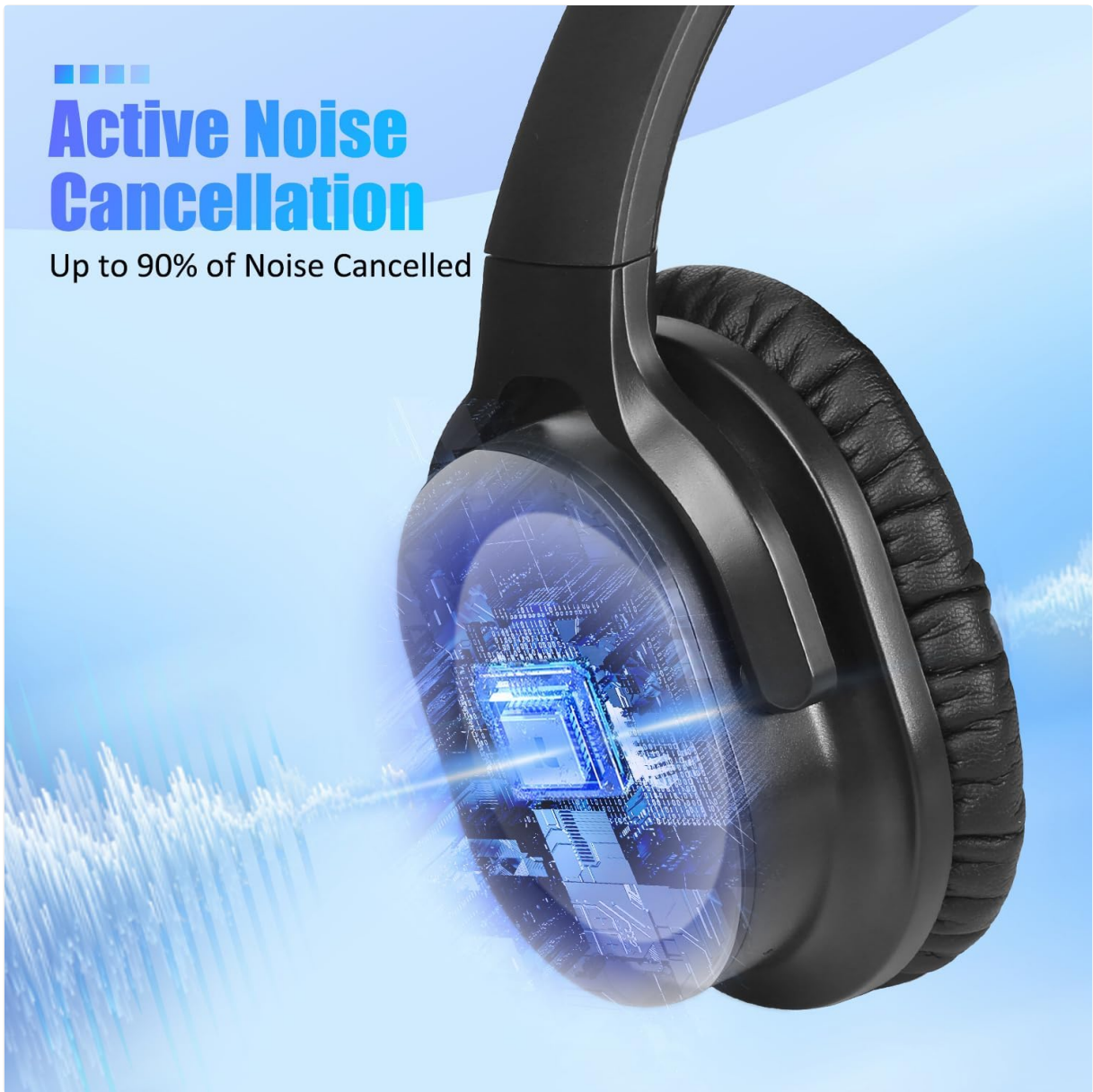
Figure 5.1: ZIHNIC WH-920 headphones with active noise cancellation enabled.