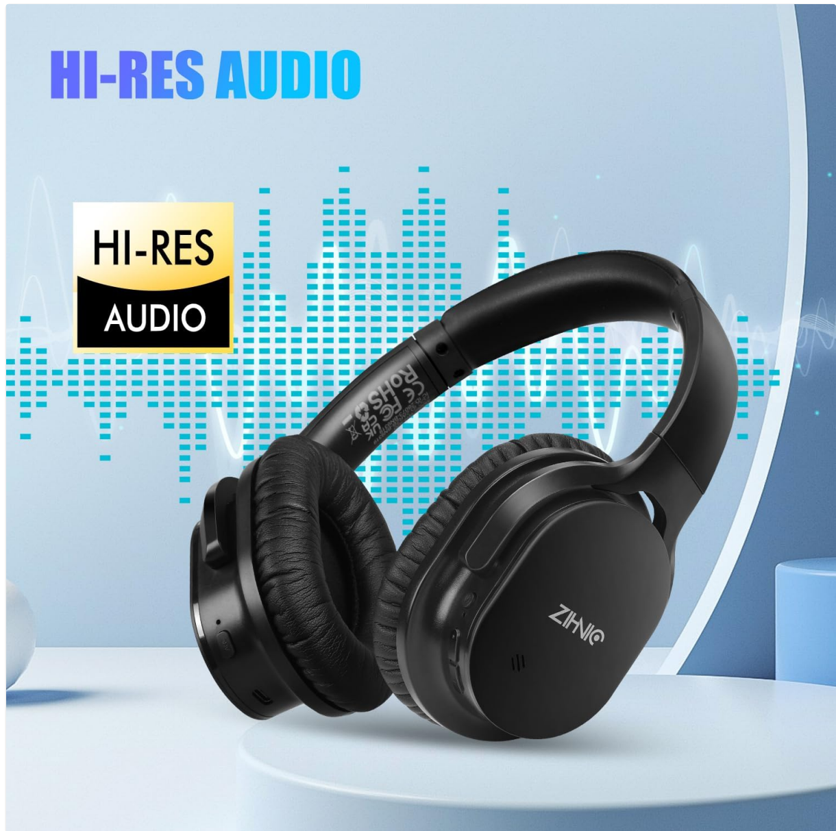
Figure 4.2: Bluetooth 5.3 connectivity for ZIHNIC WH-920 headphones.

Video 4.1: Official overview of ZIHNIC WH-920 Noise Cancelling Headphones, demonstrating features and design.