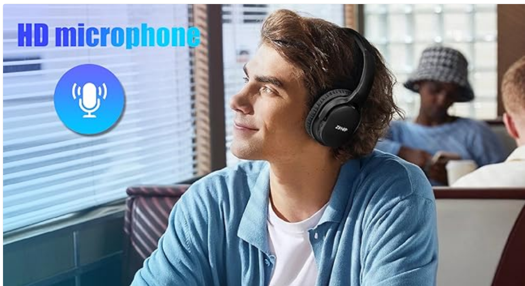
Figure 5.3: ZIHNIC WH-920 headphones in use during a gaming session.