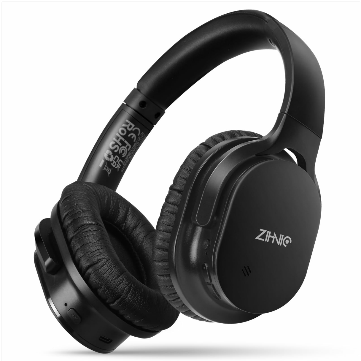
Figure 2.1: ZIHNIC WH-920 Bluetooth 5.3 Noise Cancelling Headphones.