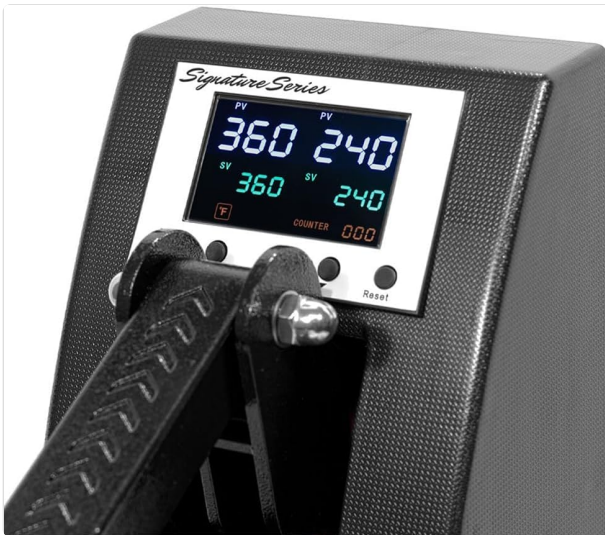
Figure 3.7: The digital control panel for setting precise time and temperature.