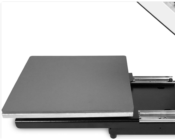
Figure 3.1: The convenient slide-out drawer allows for safe and easy placement of materials.