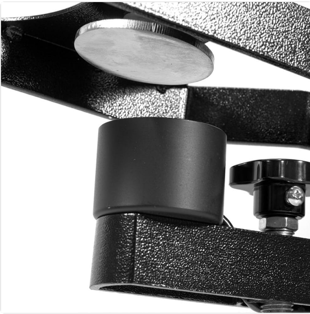
Figure 3.3: Close-up of the magnetic auto-open mechanism, ensuring precise timing.