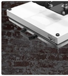
Figure 2.1: The heat press utilizes UL-certified components for enhanced safety and quality.