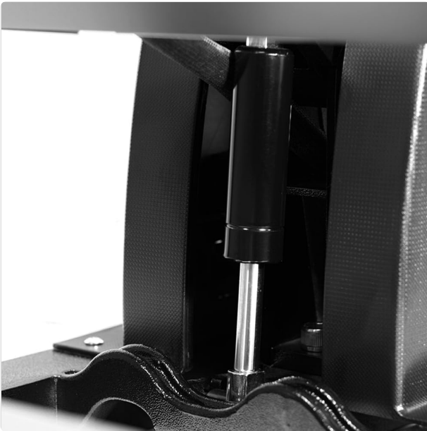
Figure 3.5: The gas shock ensures a smooth and controlled opening of the heat press.