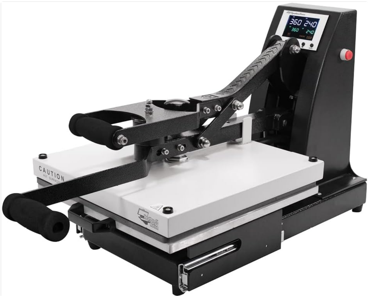
Figure 1.1: Heat Press Nation Signature Series 15" x 15" Auto-Open Heat Press.