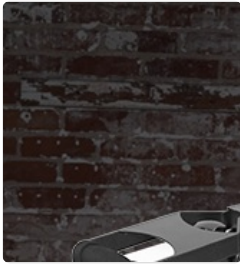
Figure 3.4: Icon representing the magnetic auto-open feature.