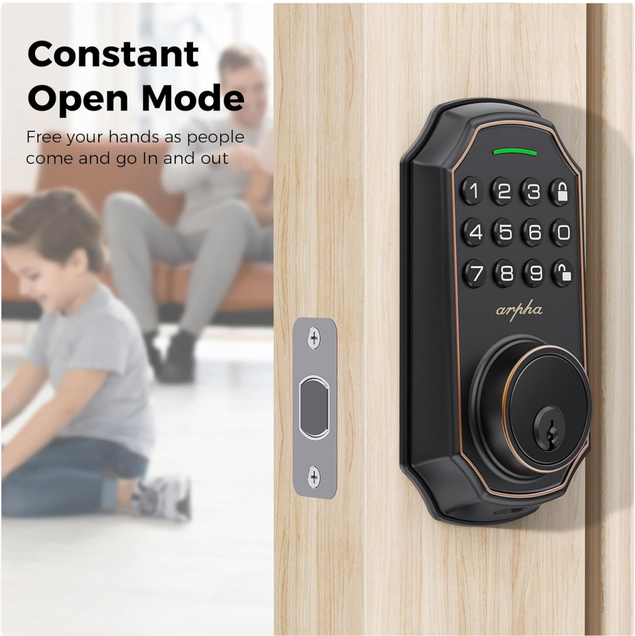
Image 2.6: Demonstrates the Constant Open Mode, allowing the door to remain unlocked for convenient passage when people frequently enter and exit.

Free your hands as people come and go In and out