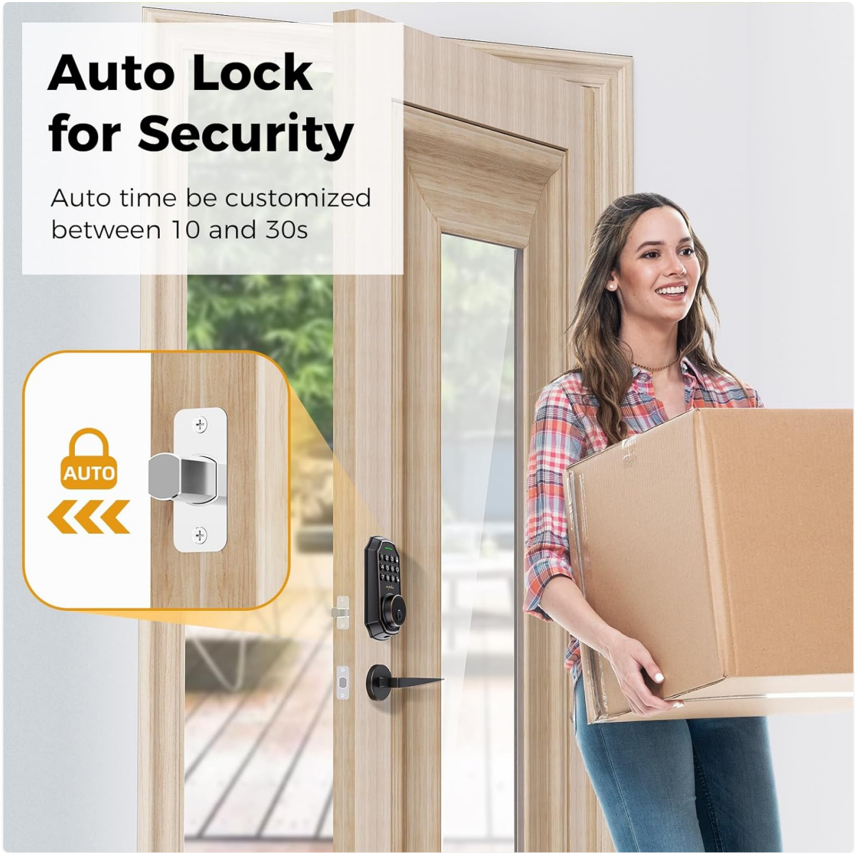
Image 2.2: Depiction of the Auto Lock feature, which can be customized to automatically lock the door between 10 and 30 seconds after closing, enhancing security.