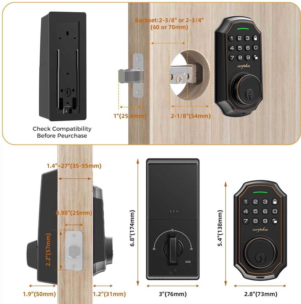
Image 3.1: Diagram illustrating the required door dimensions and lock component measurements for compatibility verification before installation.