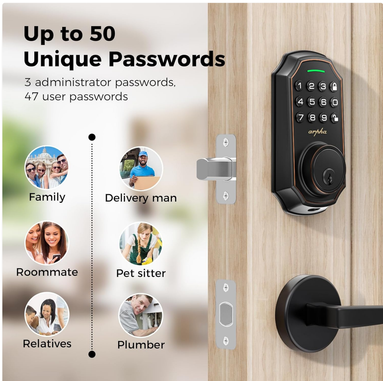
Image 2.1: Illustration showing the capability of the ARPHA D180 to store up to 50 unique passwords, including administrator and user codes for various individuals like family, delivery personnel, roommates, pet sitters, relatives, and plumbers.