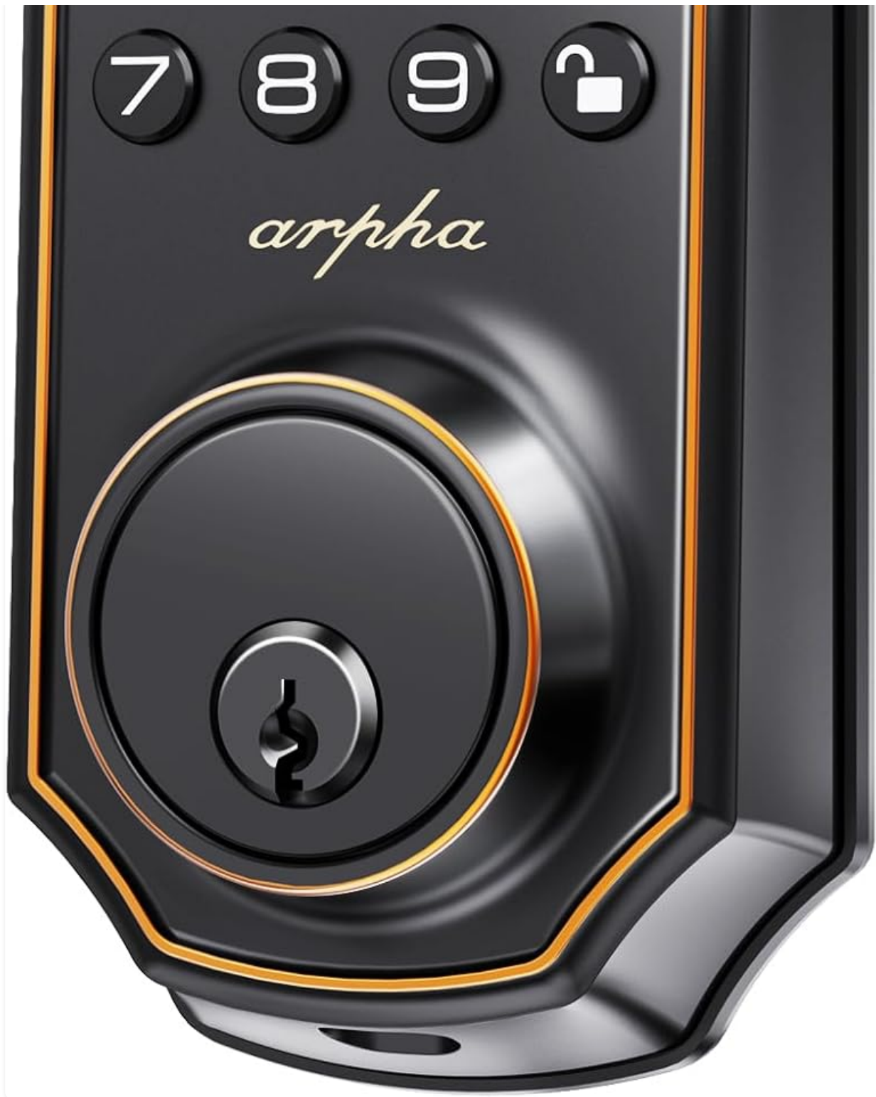
Image 1.1: Front view of the ARPHA D180 Keyless Entry Door Lock, showcasing its sleek black finish and illuminated keypad.