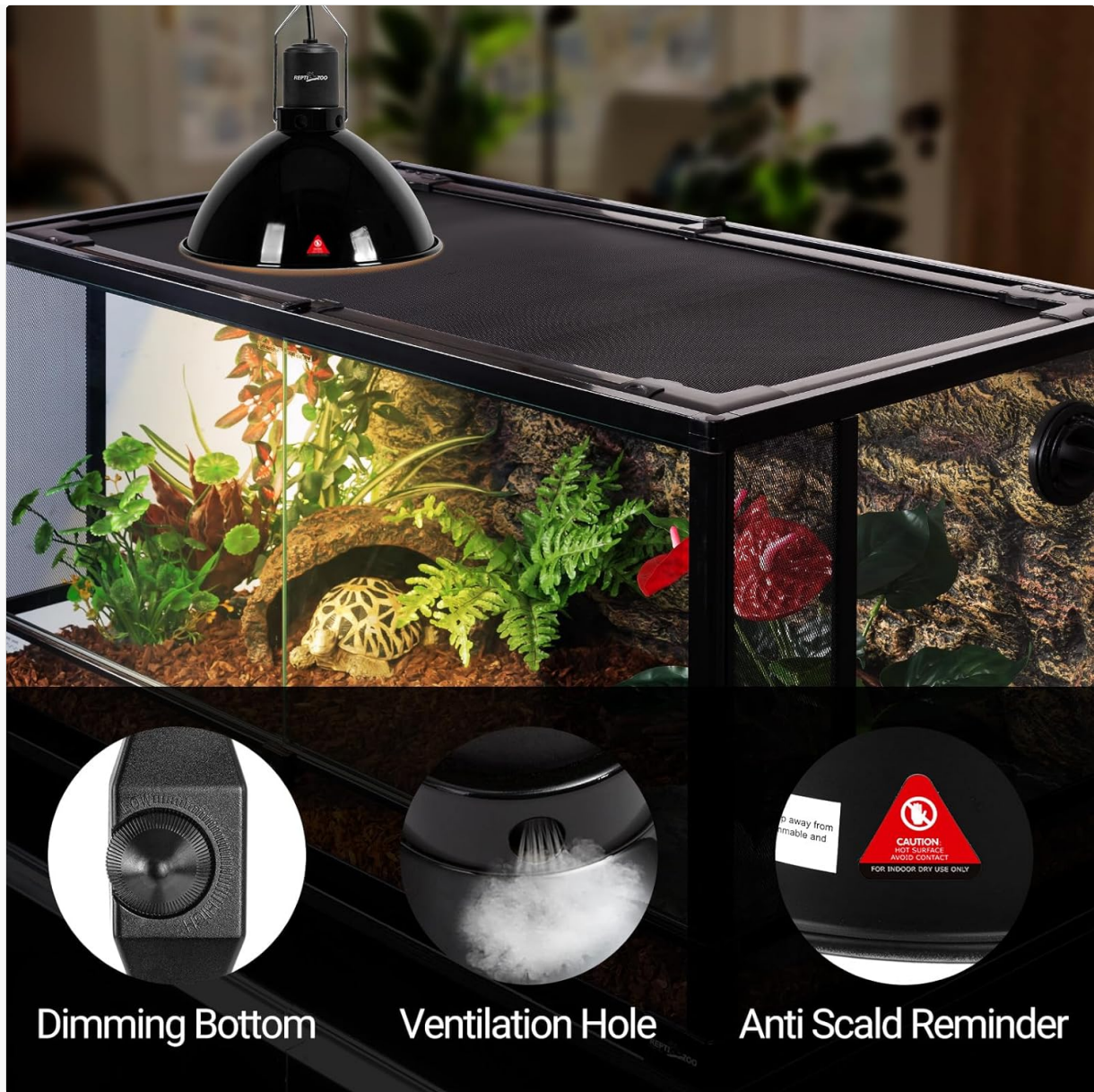
Image 5.3: Overview of the fixture installed on a terrarium, showing key features.