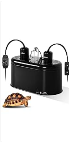
Image 2.1: Safety reminder on the fixture, indicating not to touch when hot and showing the heat-sensitive warning label.