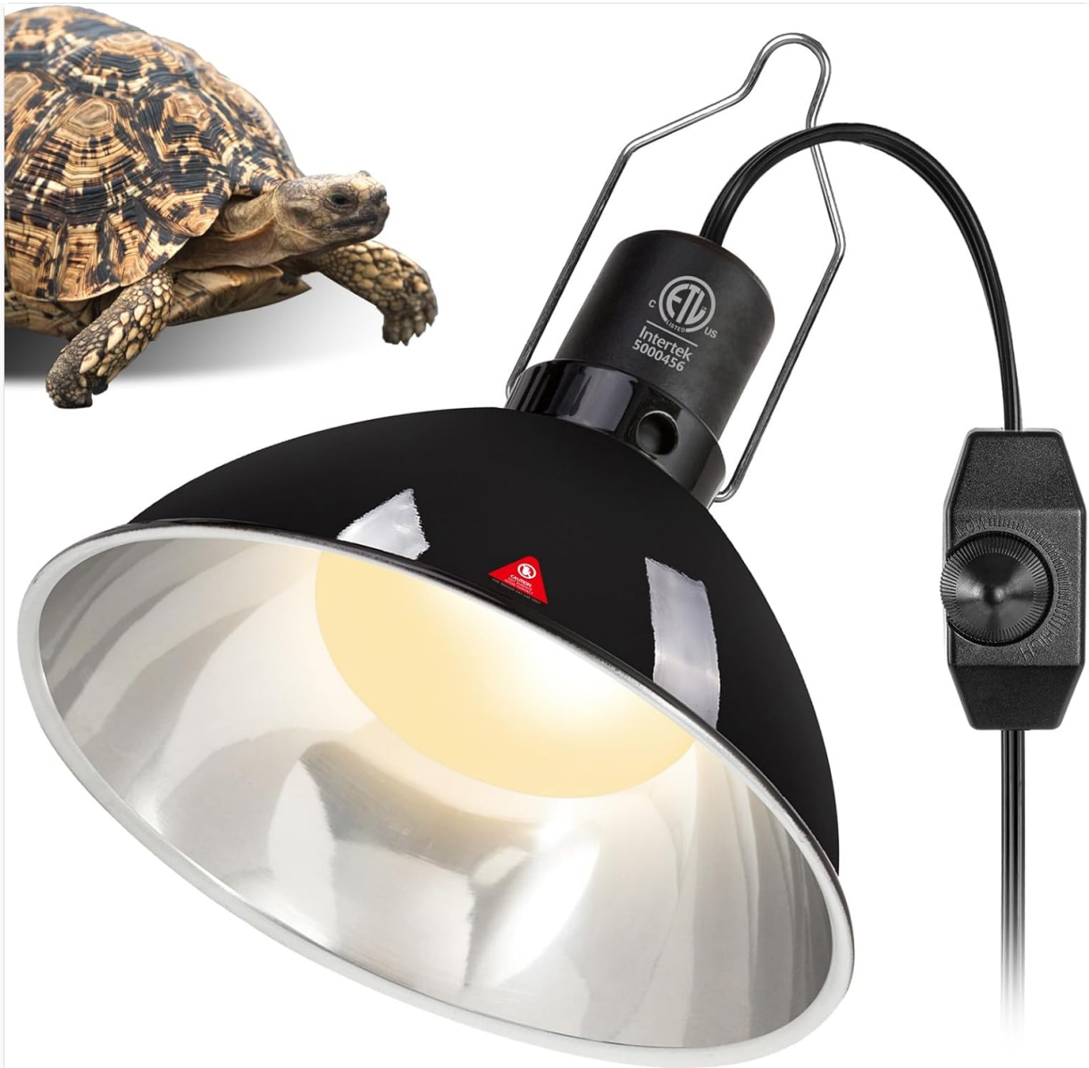
Image 1.1: The REPTI ZOO RL02BA Dimmable Deep Dome Reptile Lamp Fixture, shown with a tortoise in a terrarium environment.