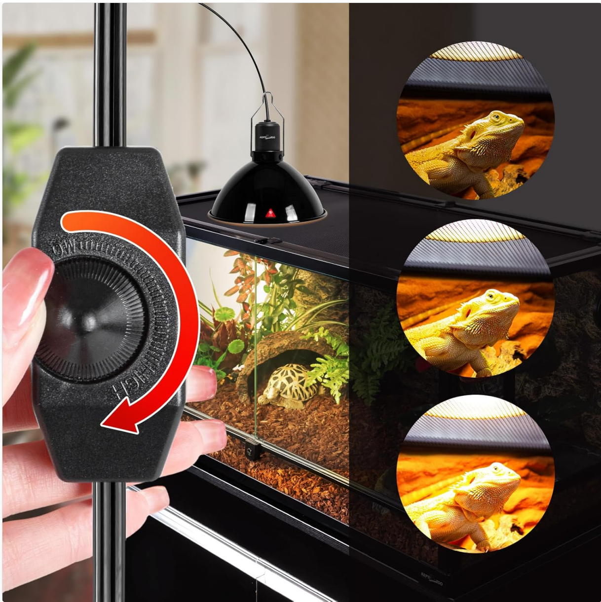
Image 6.1: Demonstrating the dimming function to adjust light and heat levels.