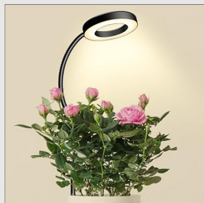
Image: The Wolezek BL-C10A grow light illuminating various indoor plants, demonstrating its adjustable light spectrum.