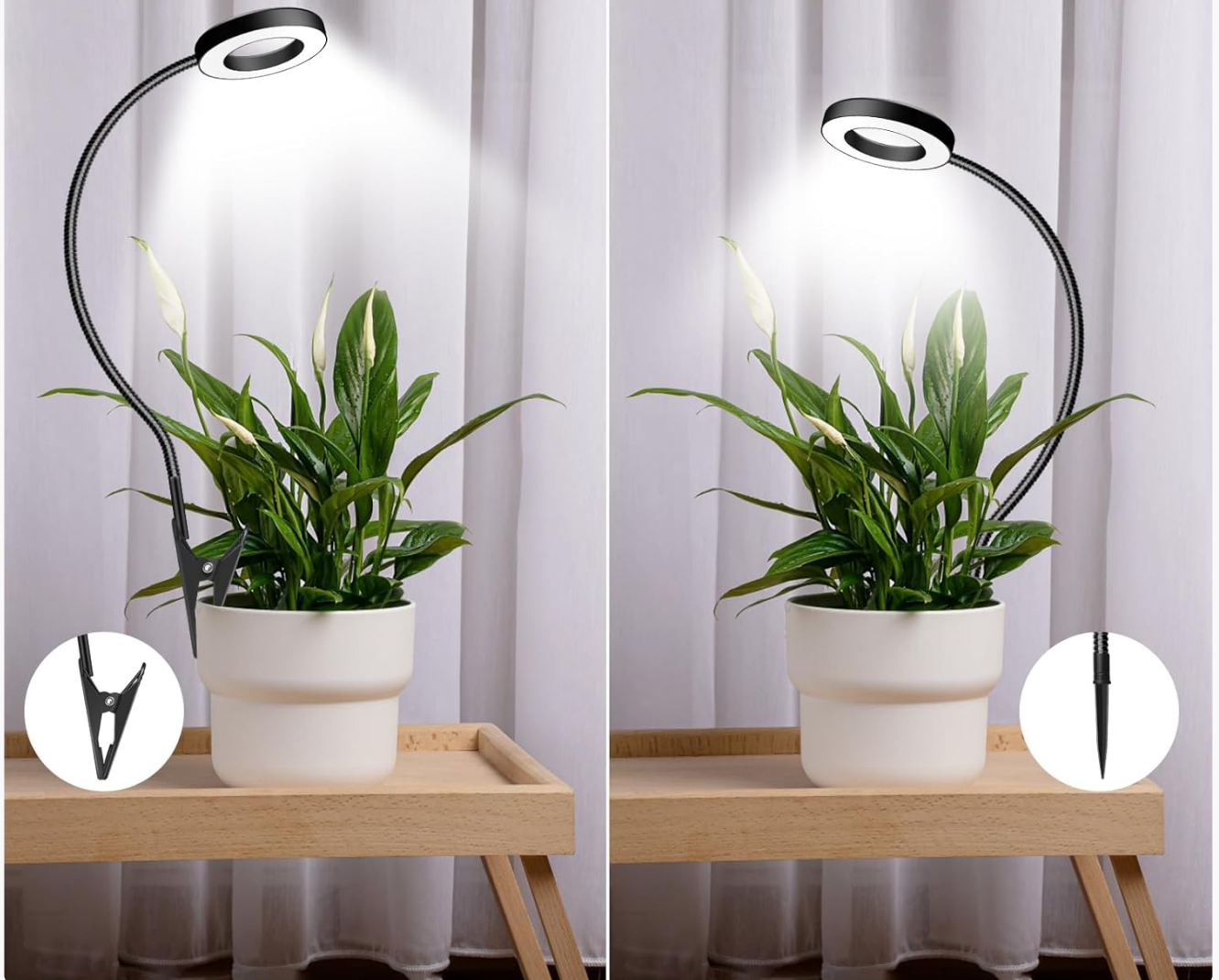
Image: Comparison of the clamp-on and stake-in-soil installation methods for the Wolezek grow light.