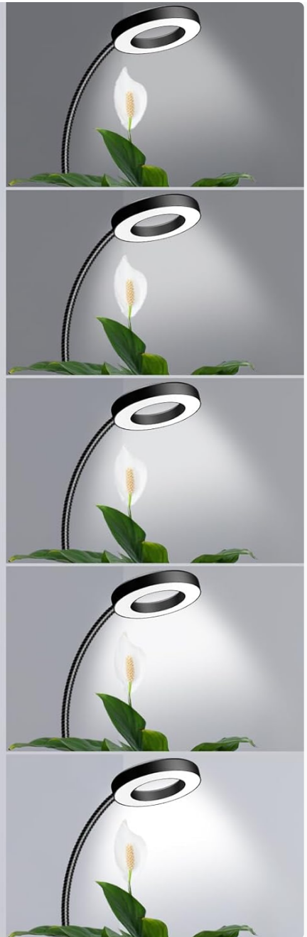
Image: Illustration of the five adjustable brightness levels for the Wolezek grow light.