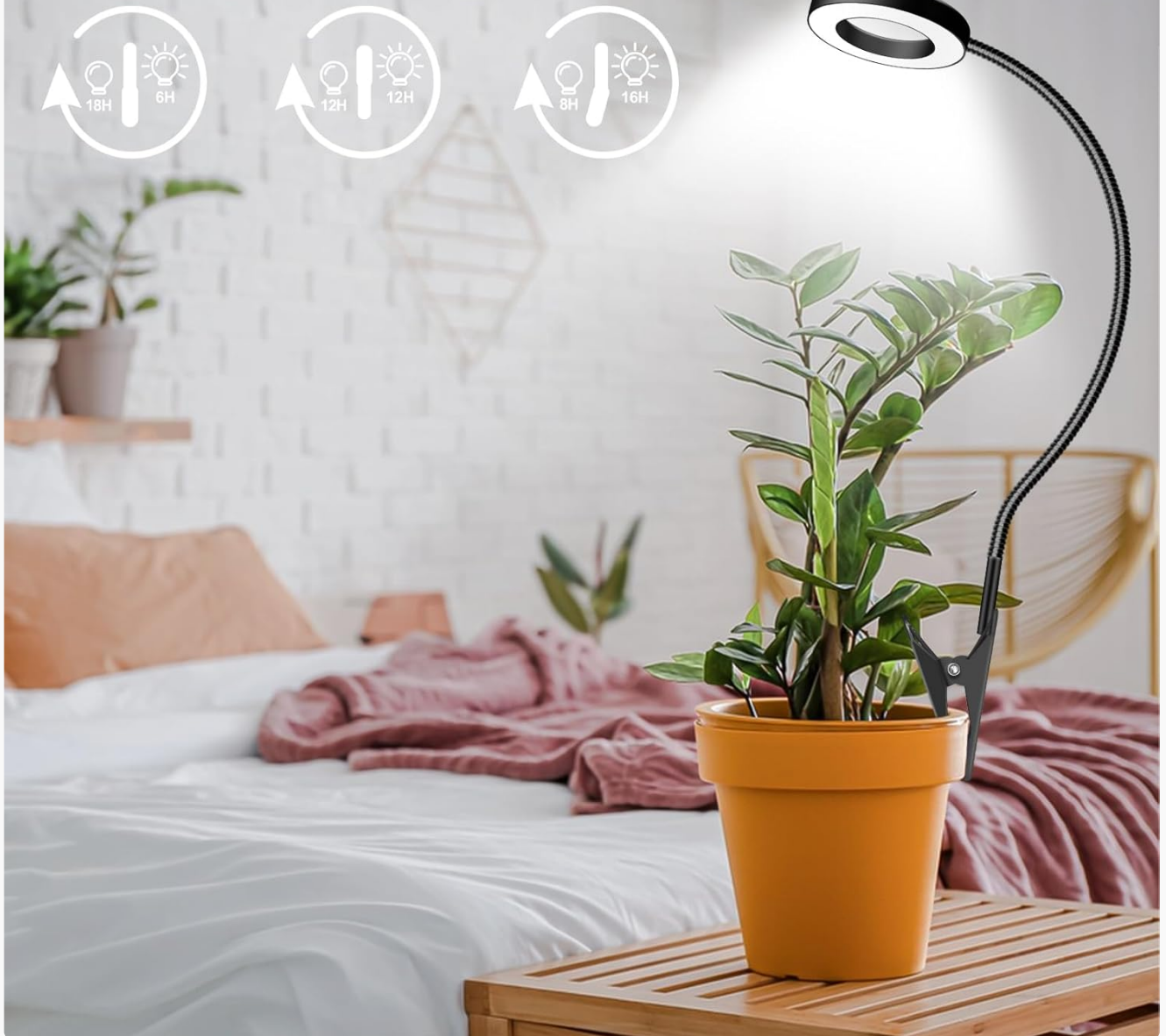
Image: The grow light operating with its automatic timer function, showing options for 6, 12, or 16 hours.