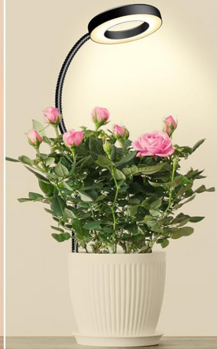
Image: Visual representation of the three distinct color modes available on the grow light.