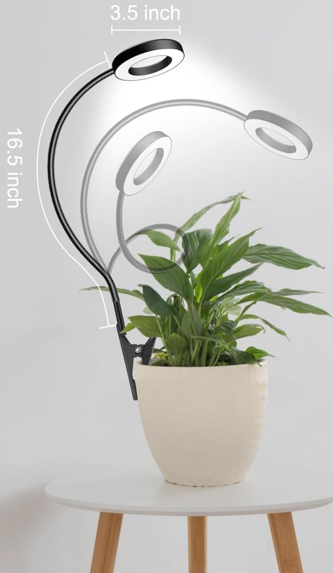
Image: The flexible gooseneck of the Wolezek grow light demonstrating its 360-degree adjustability for optimal plant illumination.