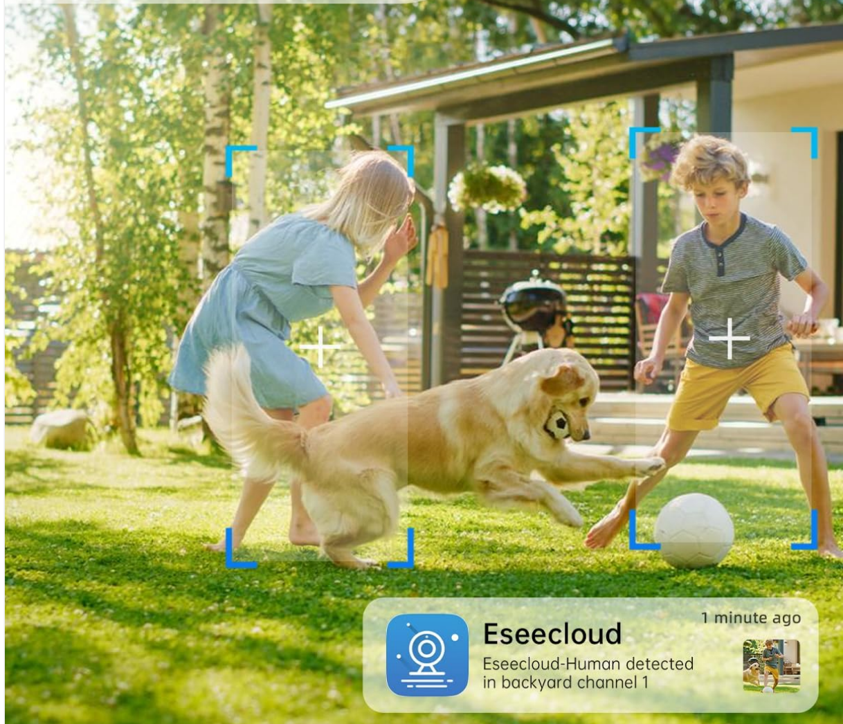
Image: Illustrates human detection and real-time alerts, showing the camera's ability to filter up to 95% of false alarms with built-in AI.