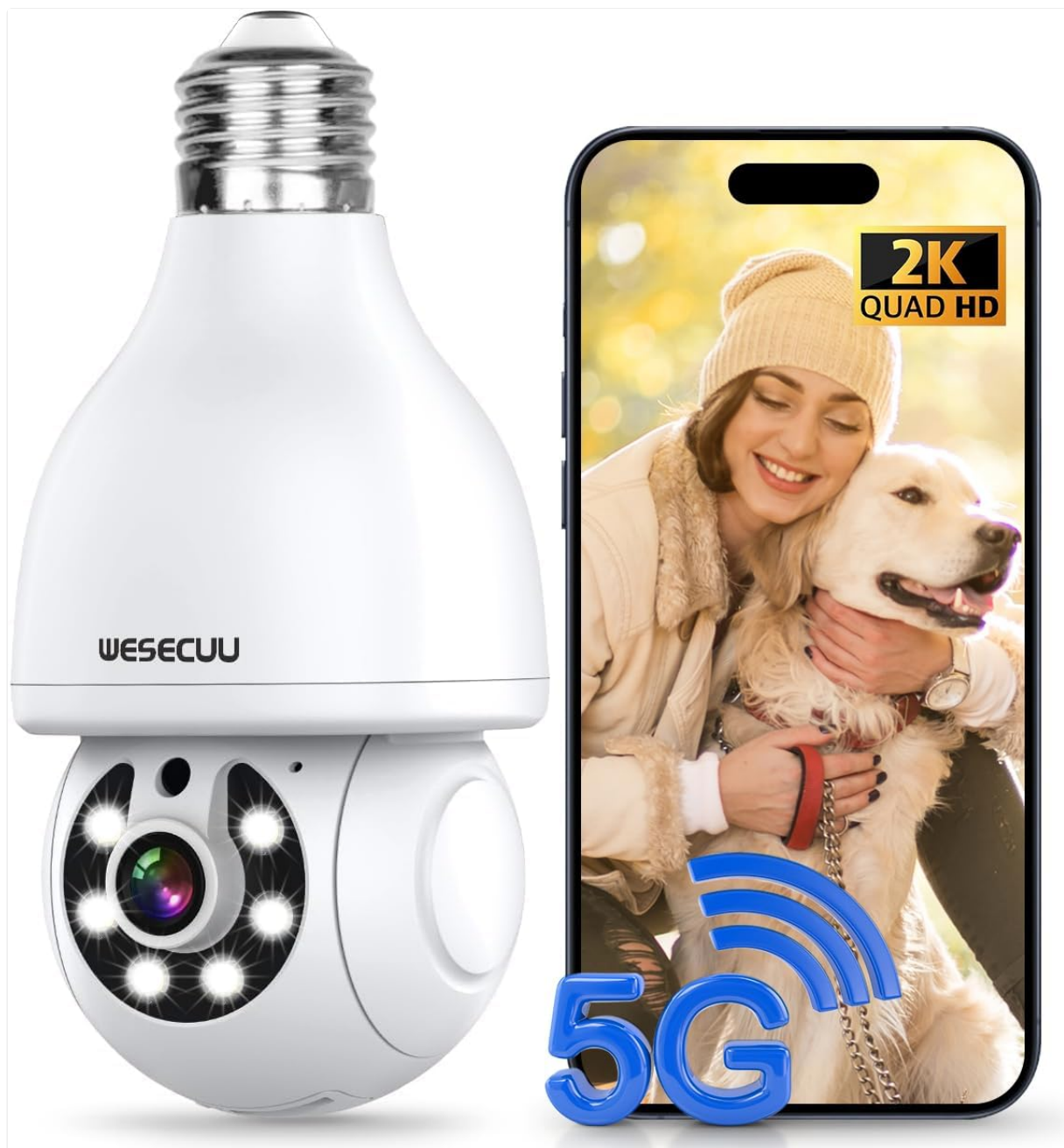
Image: WESECUU Light Bulb Security Camera with a smartphone displaying its 2K Quad HD video capability and 5G WiFi icon.