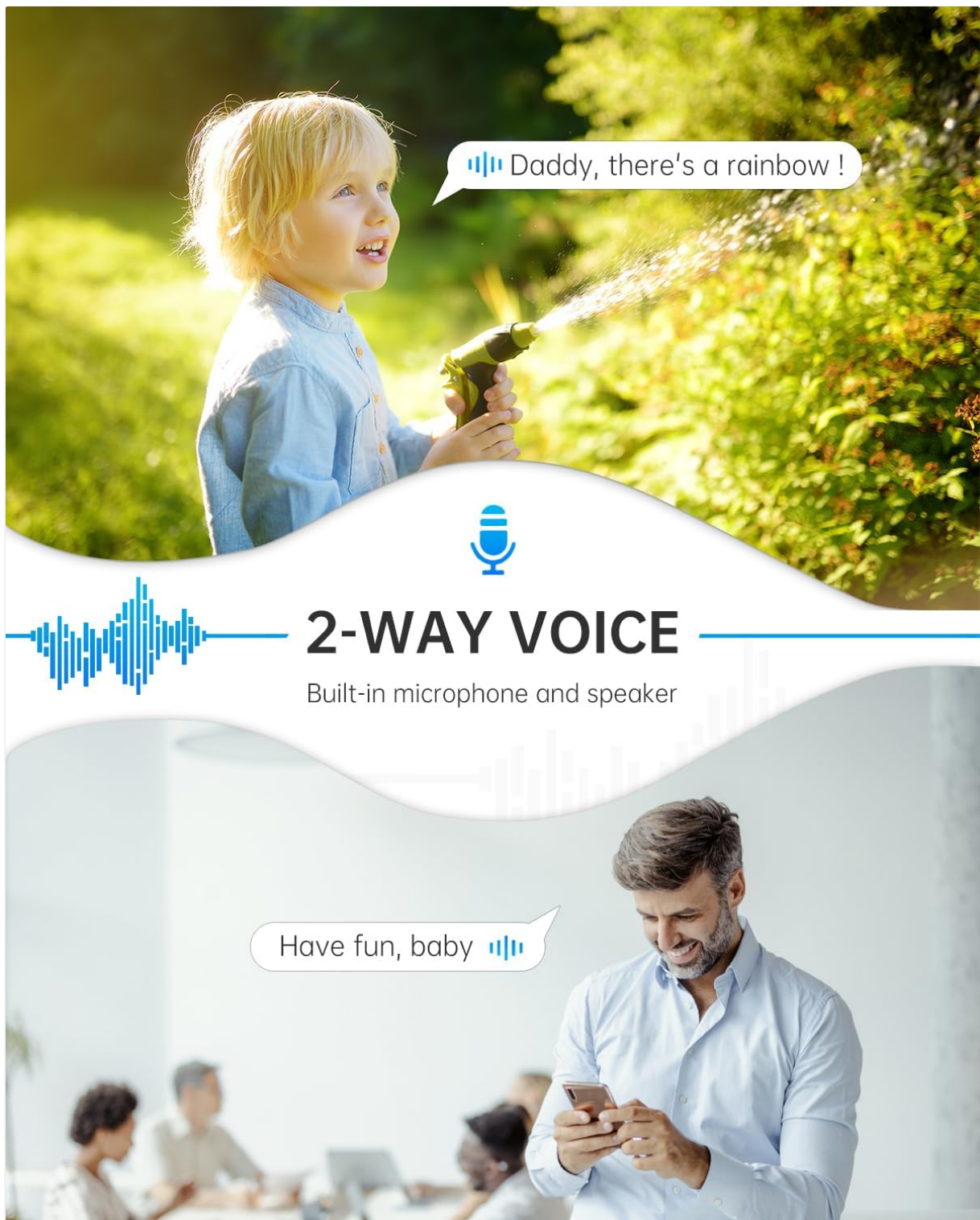
Image: Depicts the 2-way voice feature, showing a child speaking and a man responding via the camera's built-in microphone and speaker.