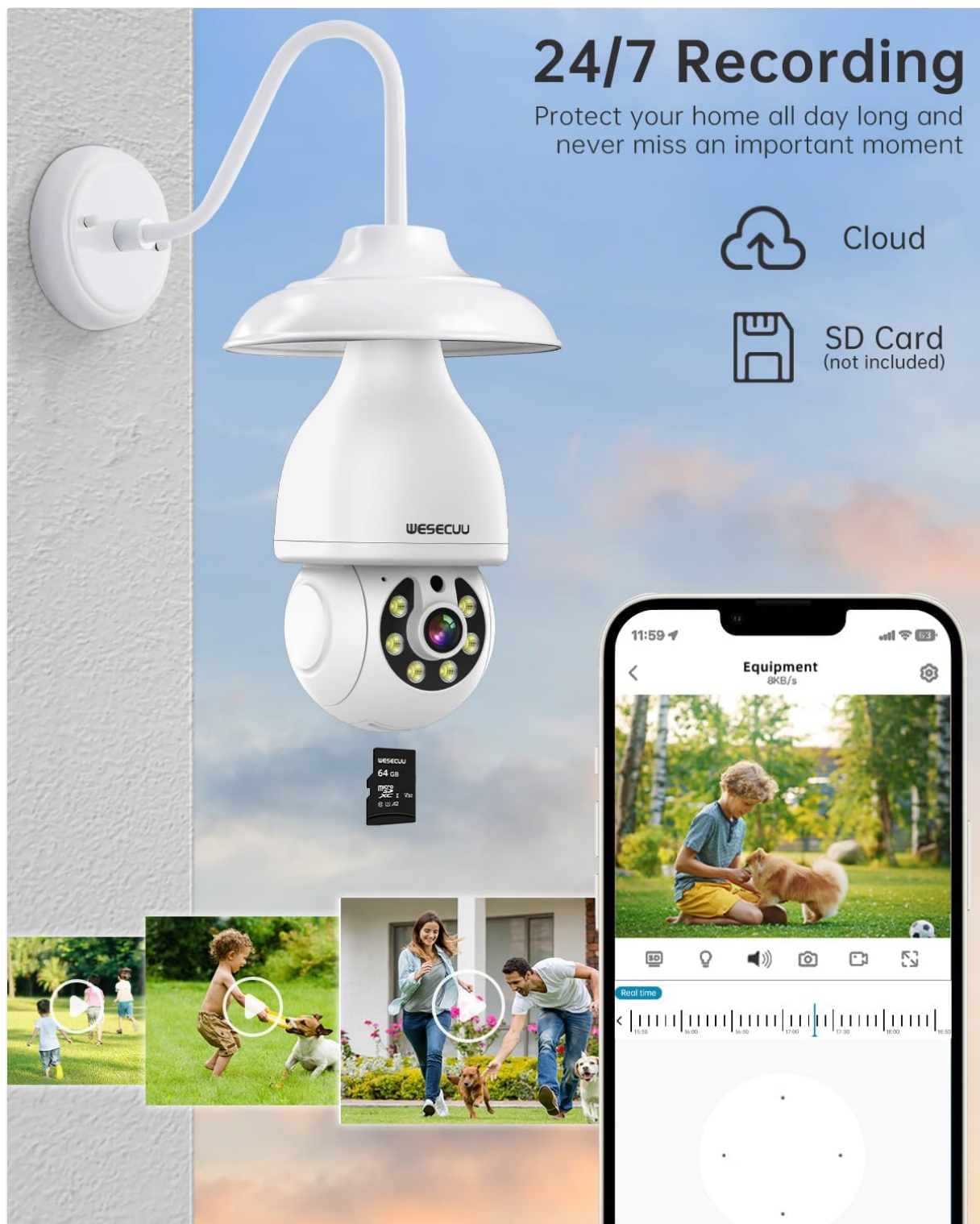
Image: Shows the camera's 24/7 recording capability with options for cloud storage and SD card storage.