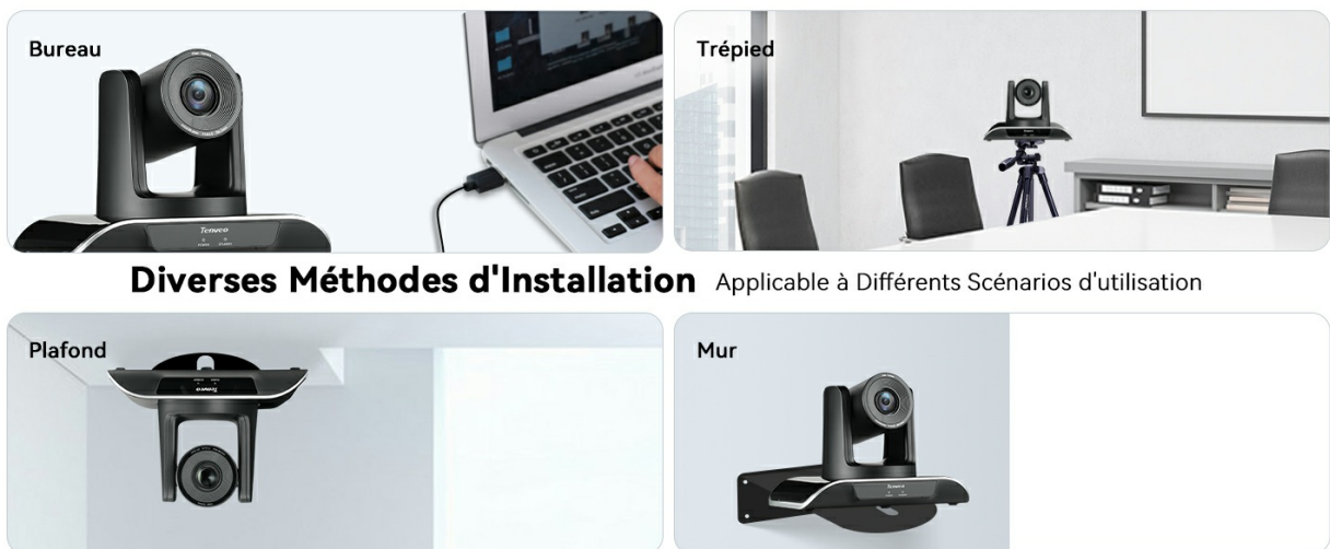
Figure 3: Various installation methods for the Tenveo VHD20U camera.