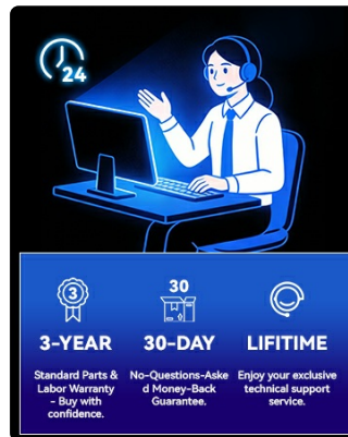
Figure 7: Warranty and money-back guarantee information.