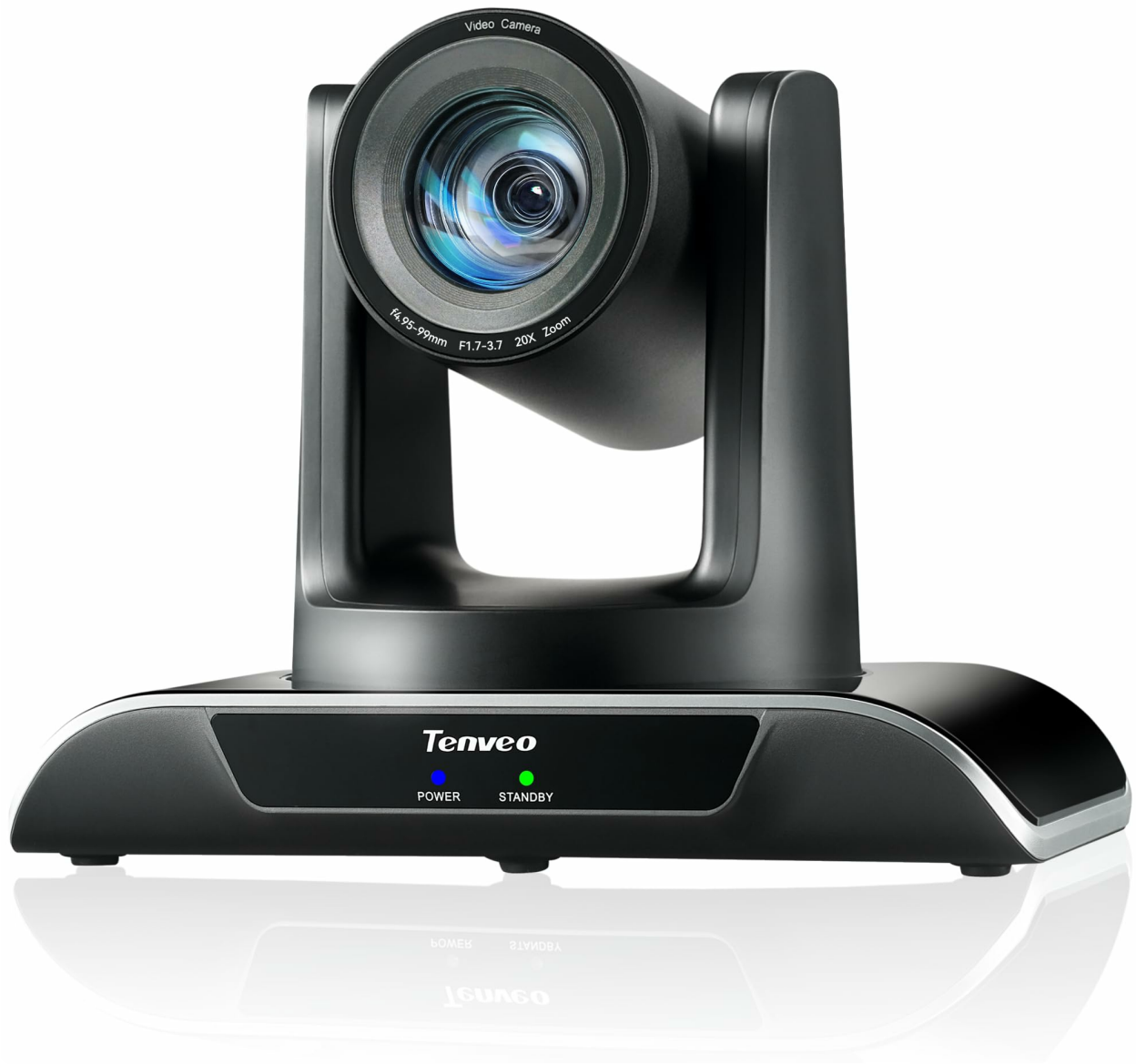
Figure 1: Tenveo VHD20U PTZ Conference Camera.