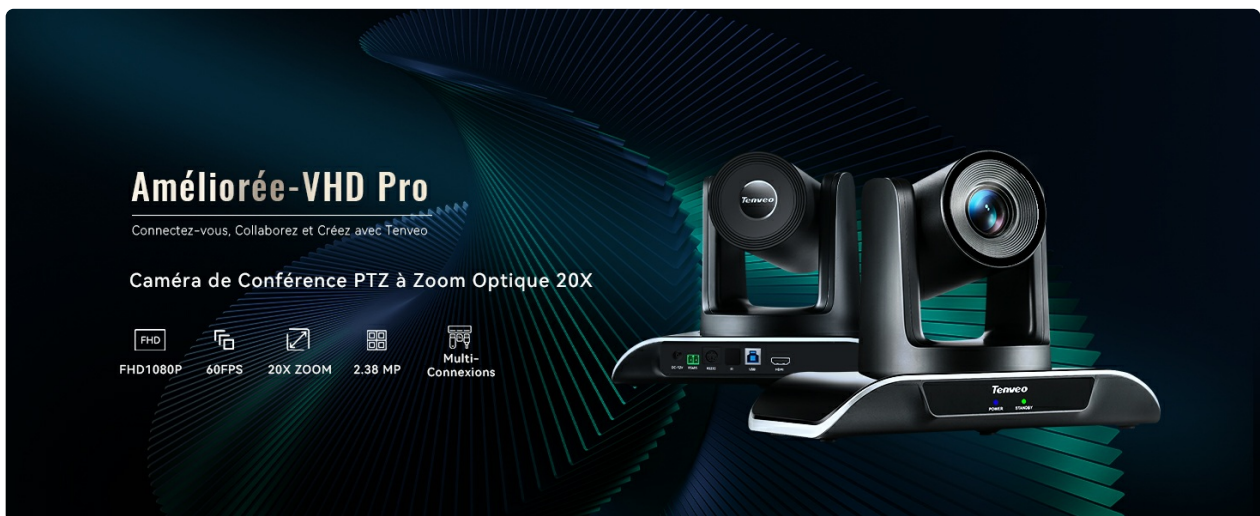
Figure 2: Tenveo VHD20U Conference Camera highlighting 20X Optical Zoom.