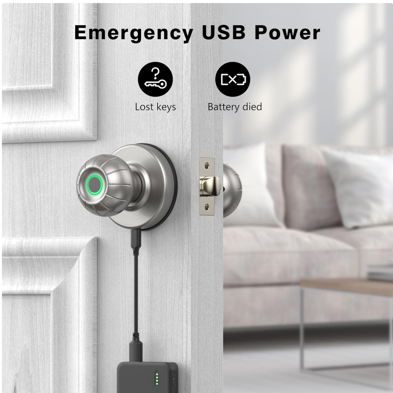
Image: The emergency USB power port provides a backup power source for unlocking if batteries are depleted.