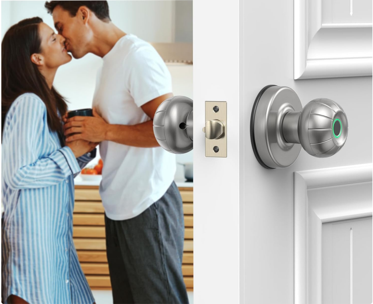
Image: The smart door knob ensures privacy and security for personal spaces.