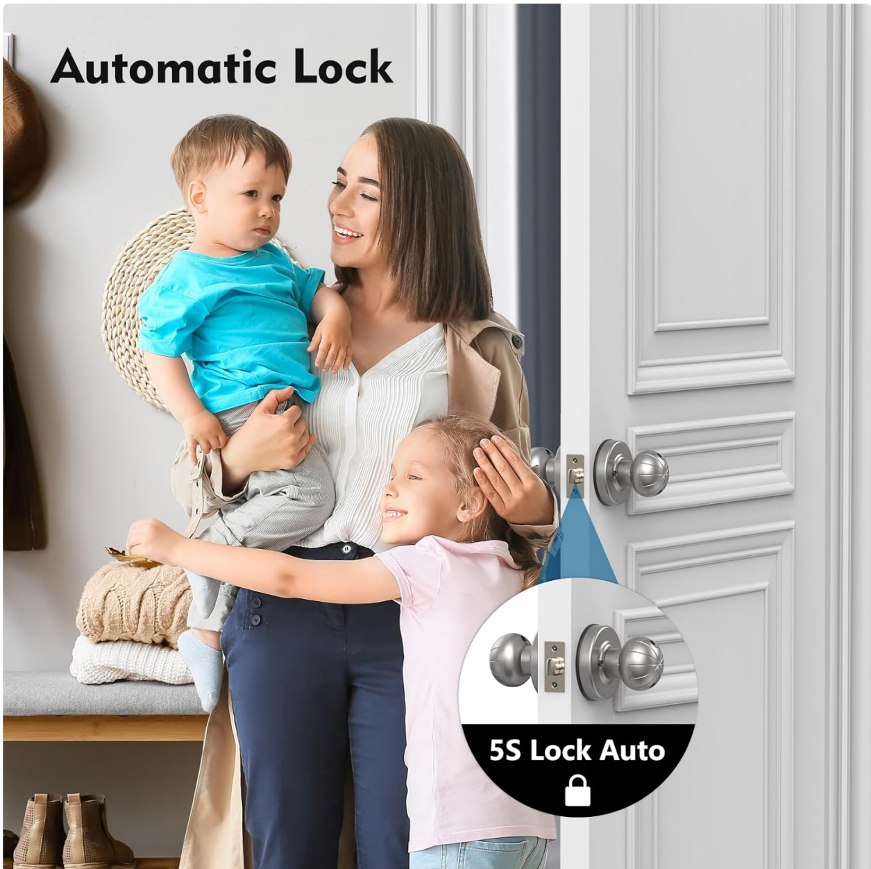
Image: The automatic lock feature ensures the door is secured 5 seconds after closing.

The smart door knob features an automatic locking function. After the door is closed, it will automatically lock itself after approximately 5 seconds, ensuring your security without manual intervention.