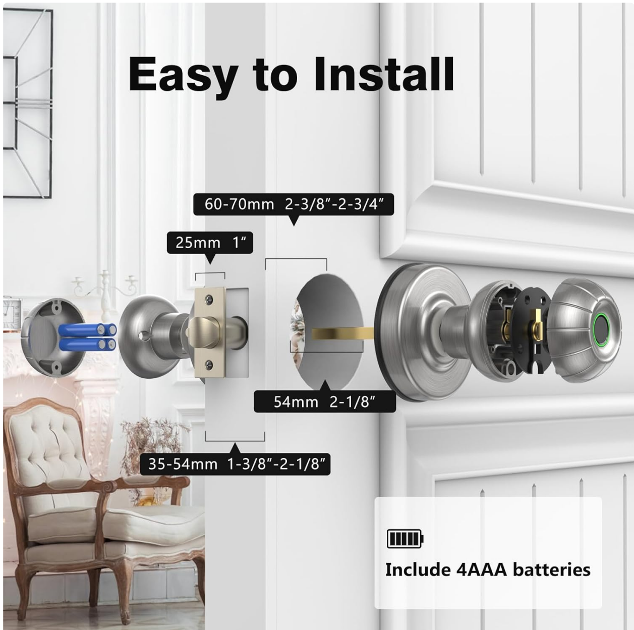
Image: Door dimensions and components for easy installation, including the latch and battery compartment.