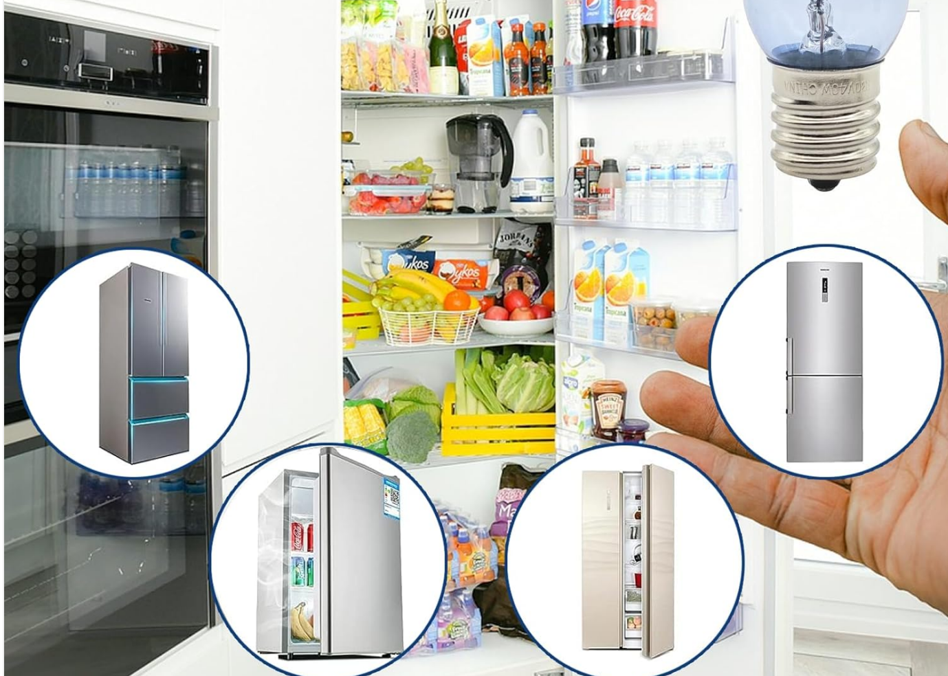
Image: Refrigerator Bulb Compatibility. This image visually represents the bulb's compatibility with various refrigerator brands and models, showing different refrigerator types.

Electrolux, Gibson, Crosley, Kelvinator, Kenmore Pro etc.