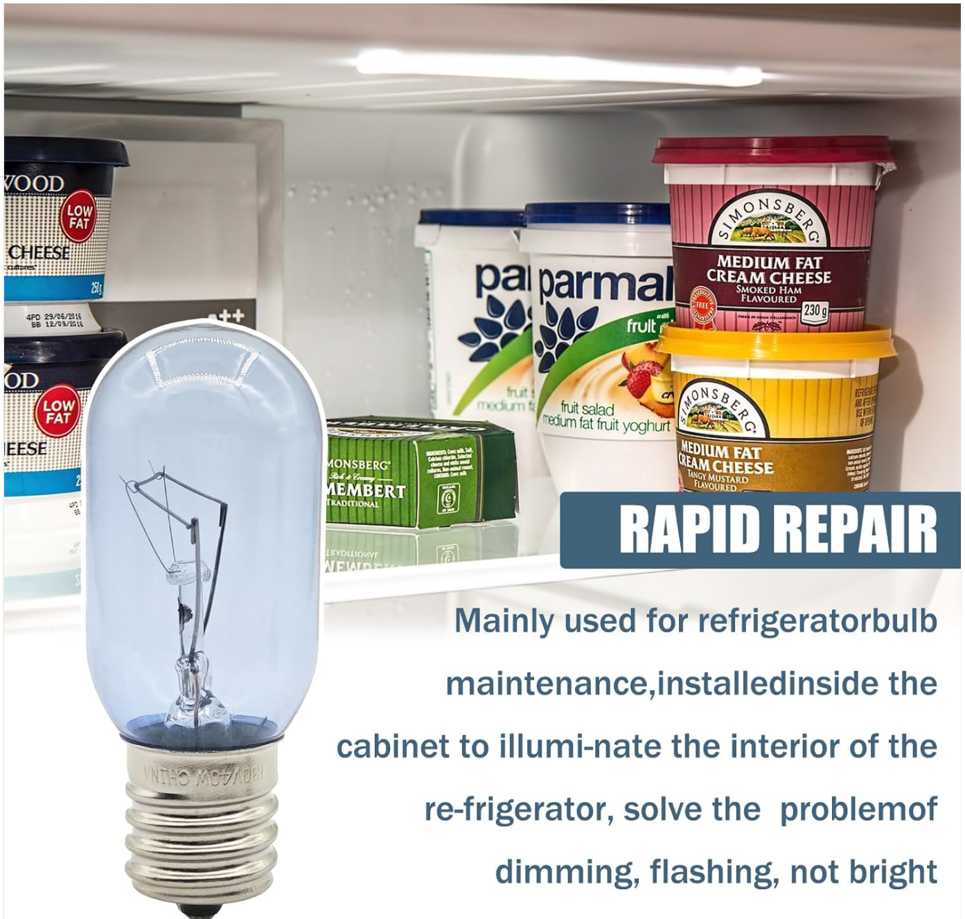
Image: Refrigerator Interior with Bulb. This image shows the bulb installed inside a refrigerator, illustrating its function in illuminating the interior.