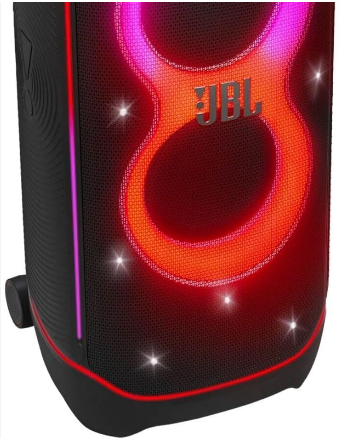
The JBL Partybox Ultimate, showcasing its dynamic light display.