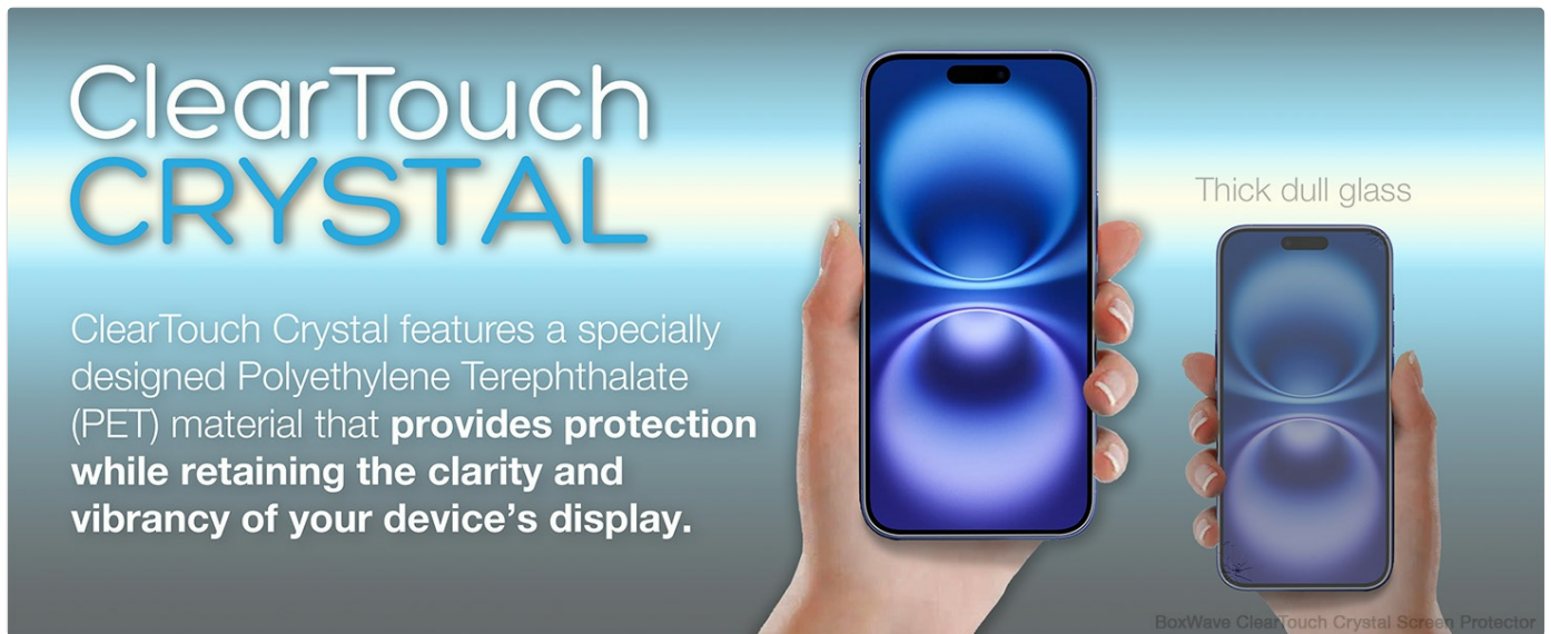
Image: Visual representation highlighting the clarity and thinness of the ClearTouch Crystal screen protector compared to a standard screen.