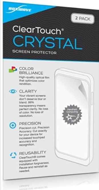
Image: BoxWave ClearTouch Crystal Screen Protector packaging shown alongside the Juan JA2215 Baby Monitor, illustrating compatibility.