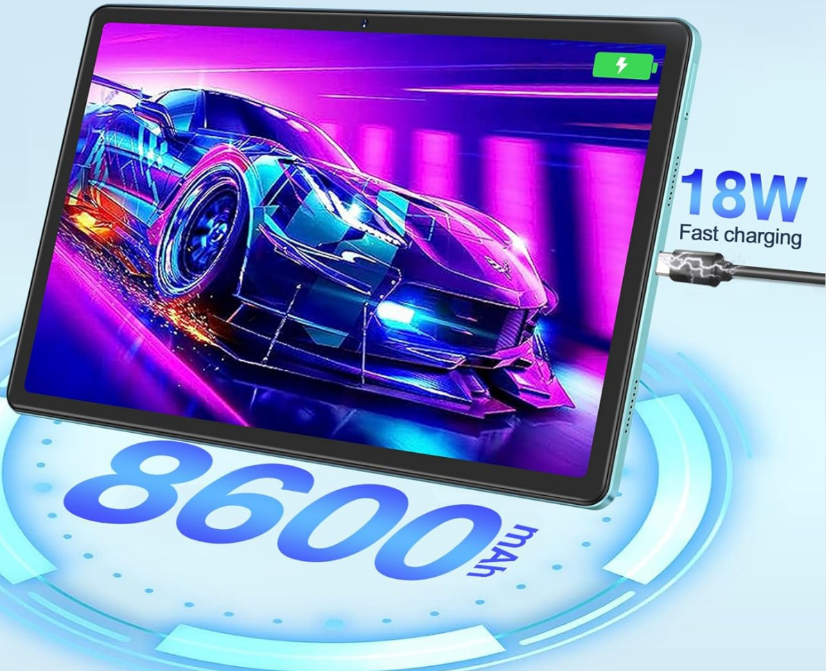
Figure 3.4: Battery Life and Charging