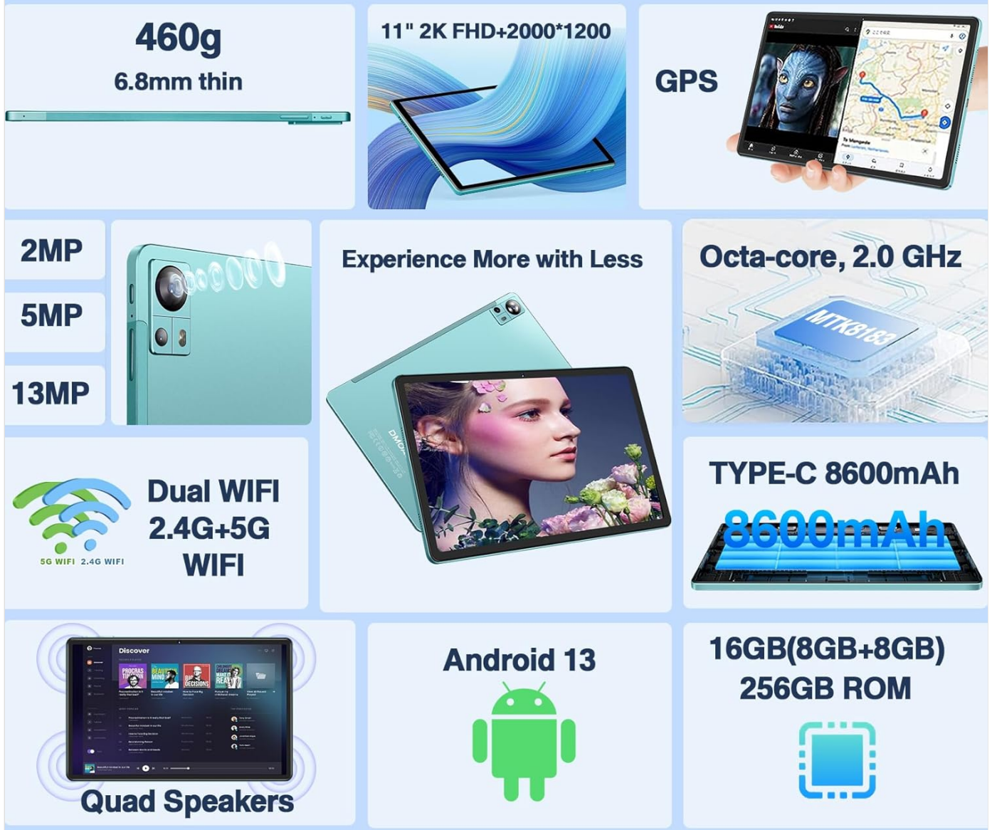
Figure 3.5: Comprehensive Feature Overview