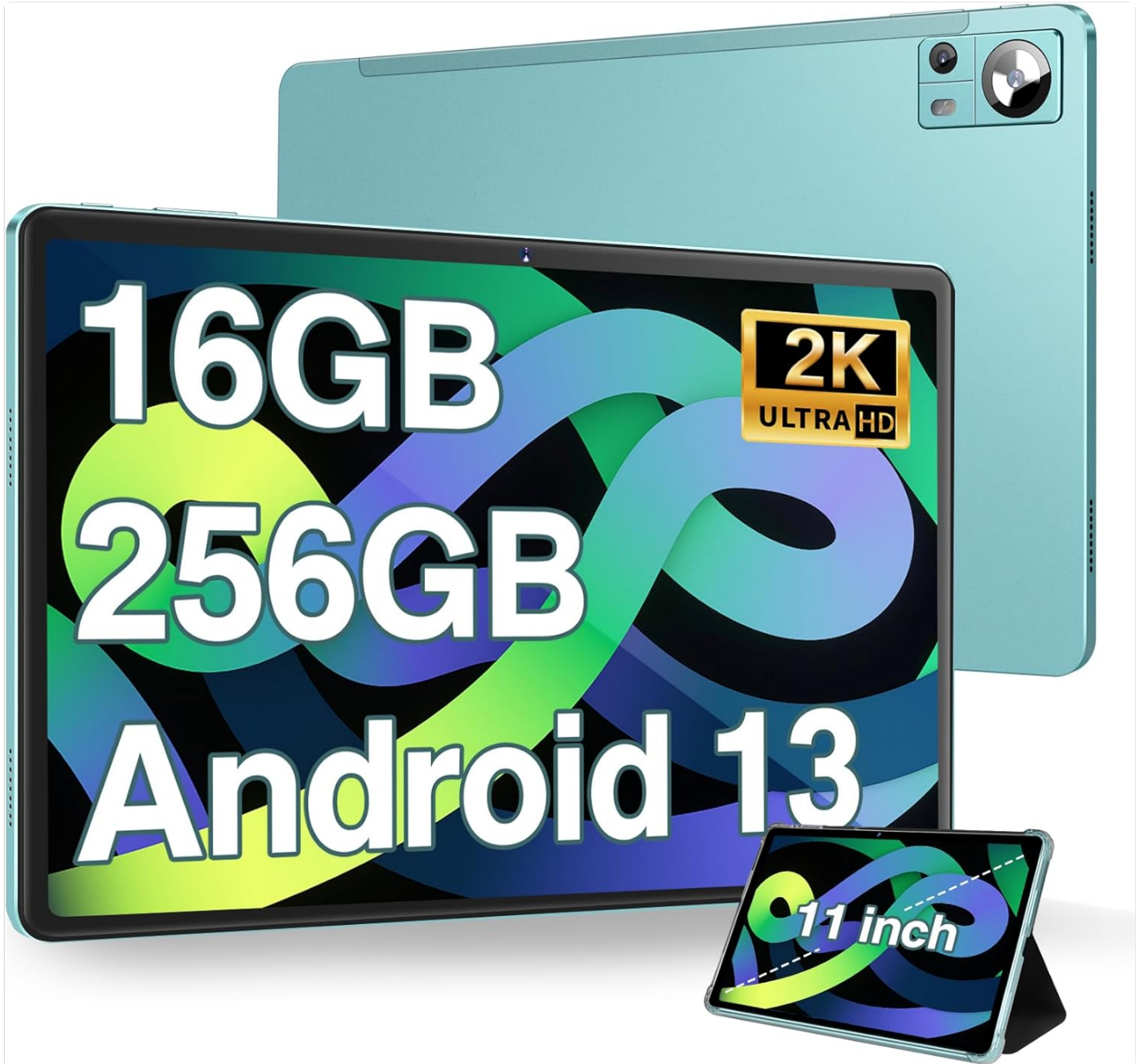
Figure 3.1: DMOAO D11 Tablet Front and Back View