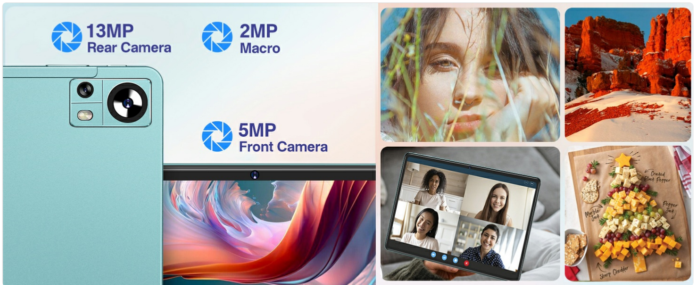
Figure 5.1: Camera Features and Usage