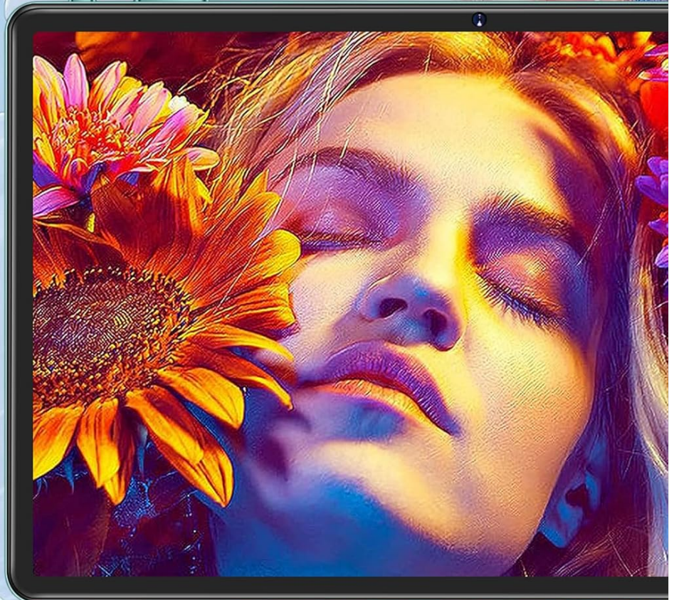
Figure 3.2: 2K FHD Display Features