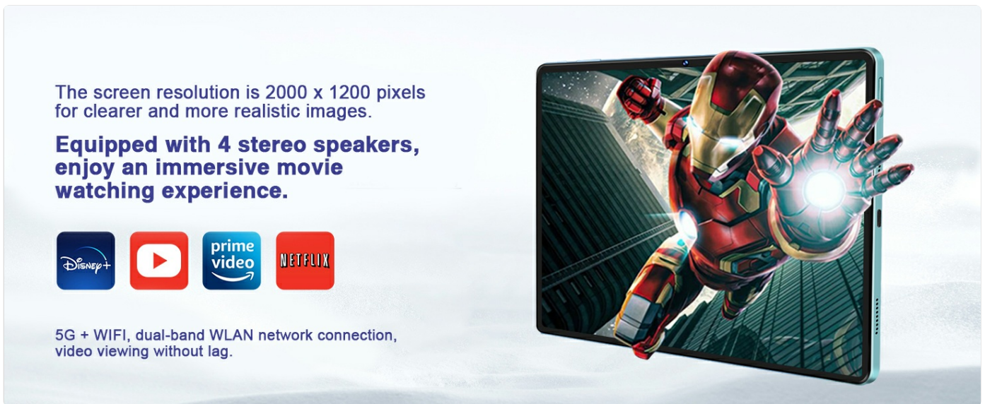
Figure 5.2: Immersive Display and Audio Experience

The D11 tablet features four BOX speakers for an enhanced audio experience. Enjoy movies, music, and games with clear and immersive sound. You can also connect Bluetooth headphones for private listening.