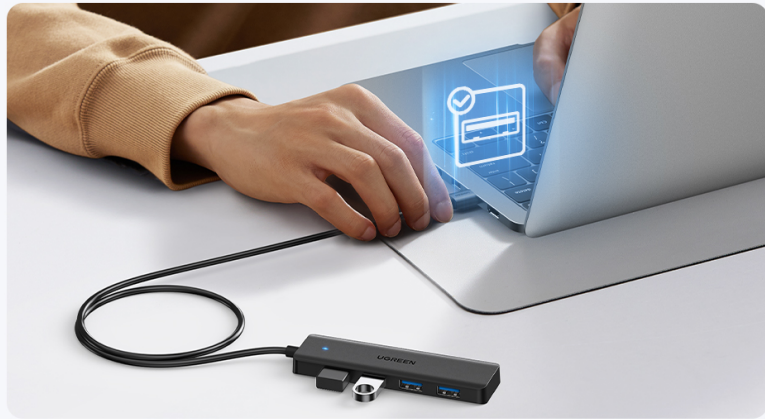
Image 7: Wide Compatibility Overview. This image visually represents the broad range of devices and operating systems compatible with the UGREEN USB 3.0 Hub, including laptops, desktops, gaming consoles, and major OS platforms.