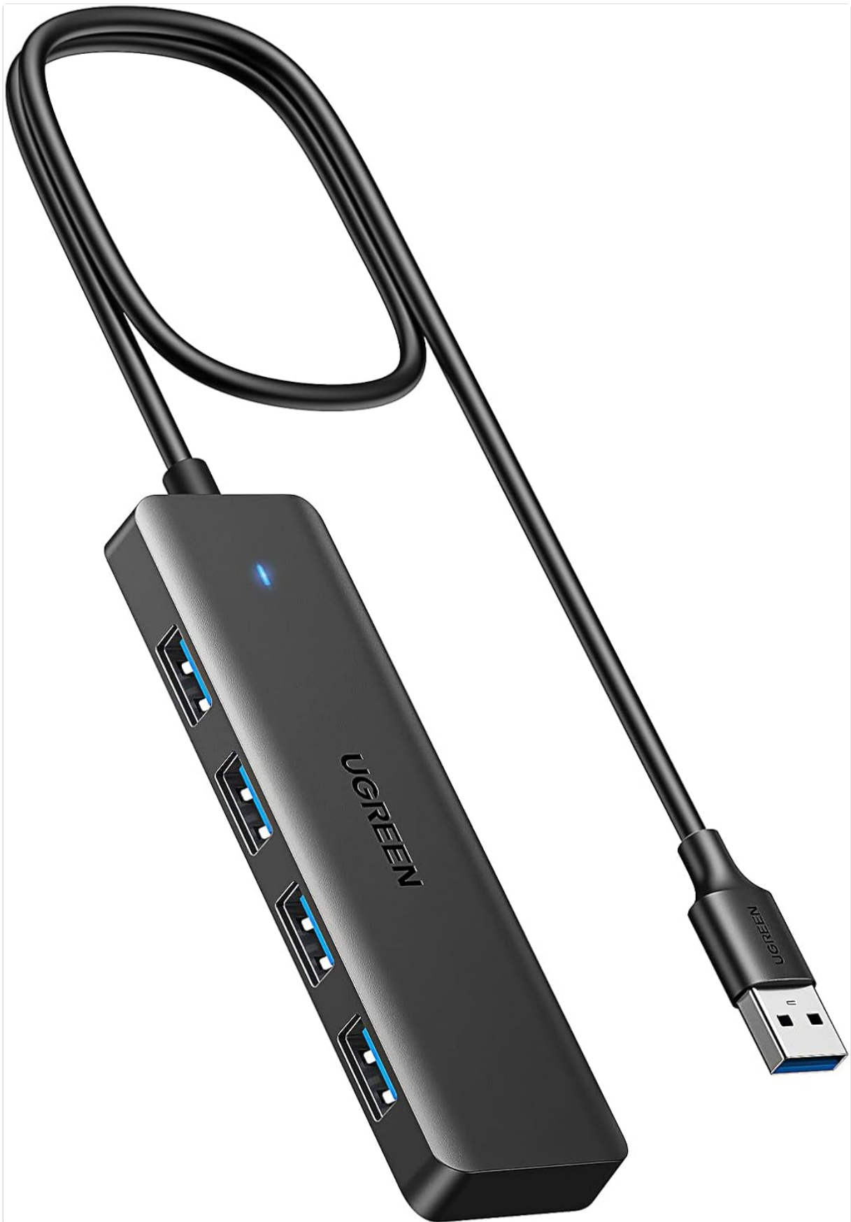
Image 1: UGREEN USB 3.0 Hub. This image displays the main unit of the hub, featuring its sleek black design, four USB 3.0 ports, and the attached USB-A cable.