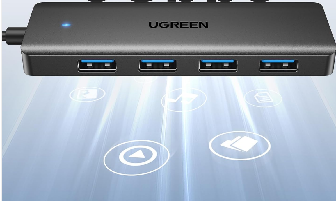
Image 6: High-Speed Data Transfer. This graphic emphasizes the 5Gbps transfer capability of the USB 3.0 hub, indicating fast and efficient data movement.