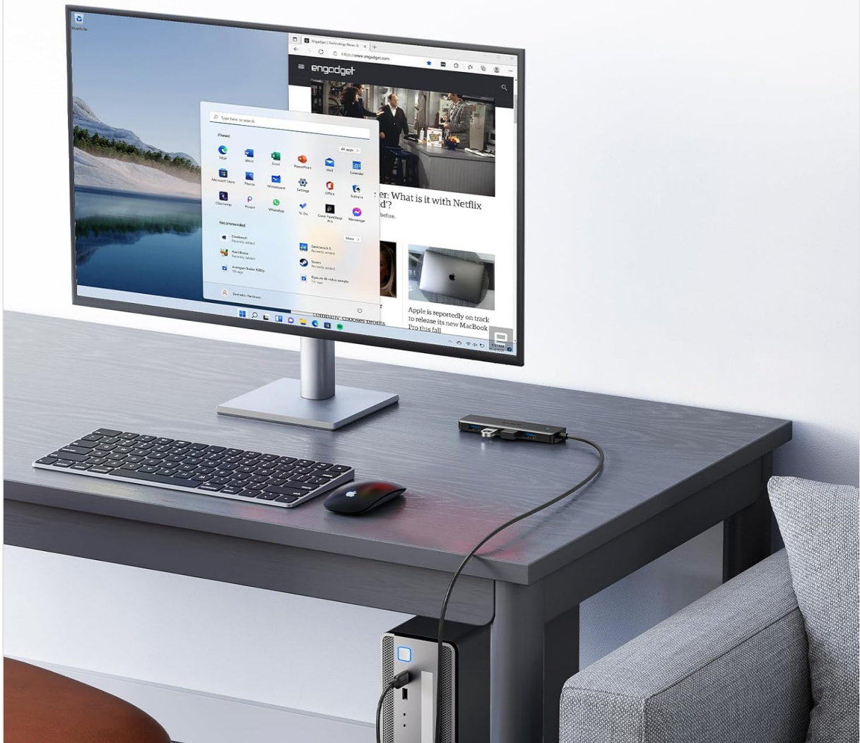
Image 5: Hub in a Desktop Environment. This image shows the hub in use with a desktop computer, illustrating the practical application of its 2-foot cable for convenient placement on a desk.