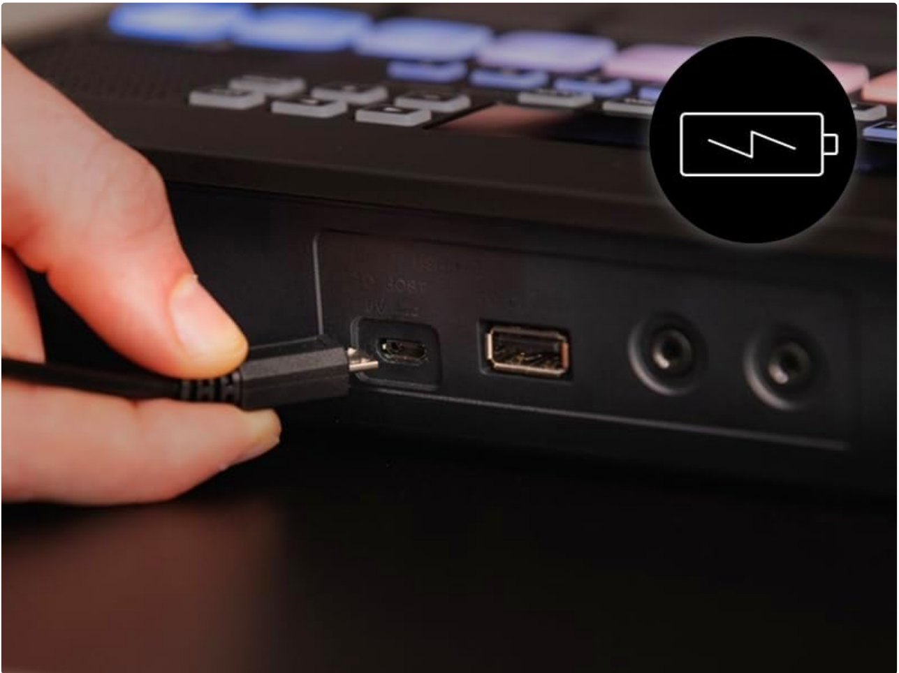
Figure 2: Connecting the USB cable for charging or power.

Press and hold the power button on the side of the unit to turn it on. The display will illuminate, and the pads will light up. If the battery is low, a "Low Battery" message will appear on the display.