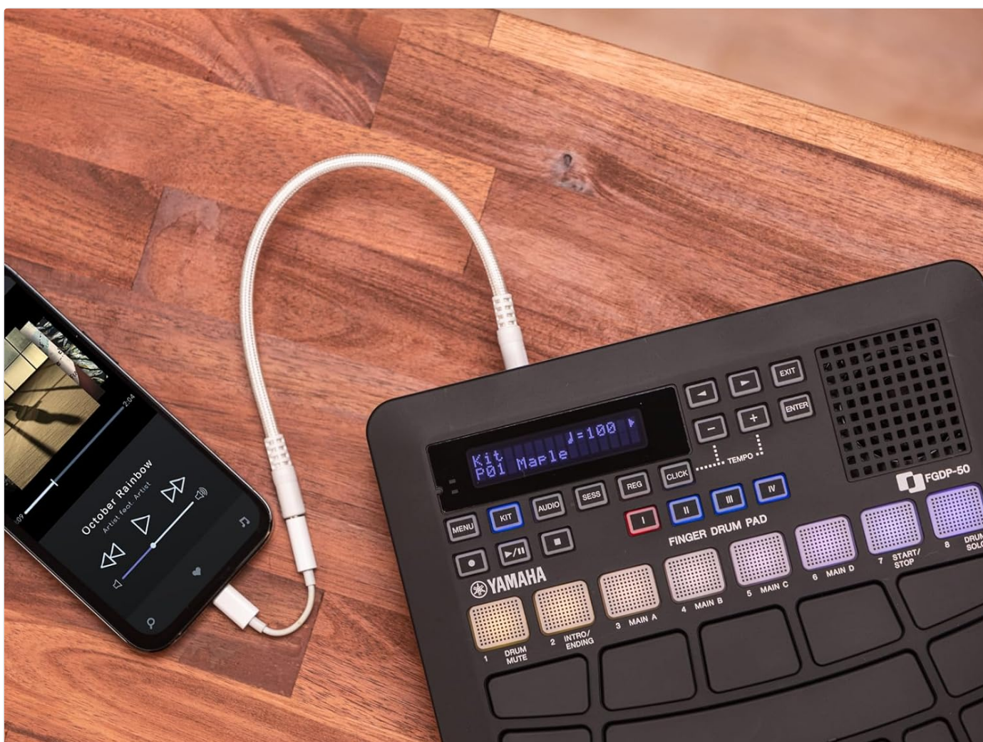
Figure 5: Connecting an external audio device via AUX IN.