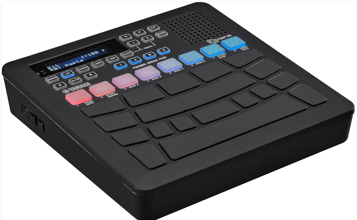
Figure 1: Yamaha FGDP-50 Finger Drum Pad.

The Yamaha FGDP-50 is a portable finger drum pad designed for beat-making, composition, and performance. It features highly responsive pads with velocity sensitivity and aftertouch, allowing for expressive drumming. This manual provides essential information for setting up, operating, and maintaining your FGDP-50.