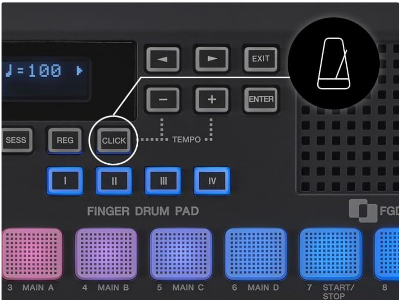
Figure 8: Metronome (CLICK) button and tempo adjustment.