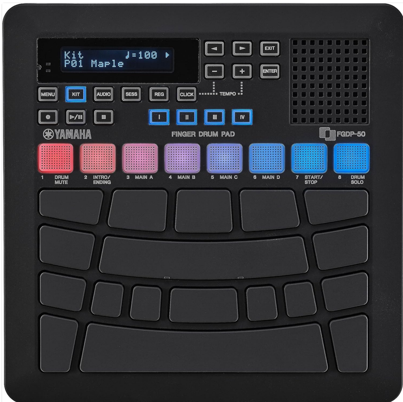
Figure 3: Top panel layout of the FGDP-50.