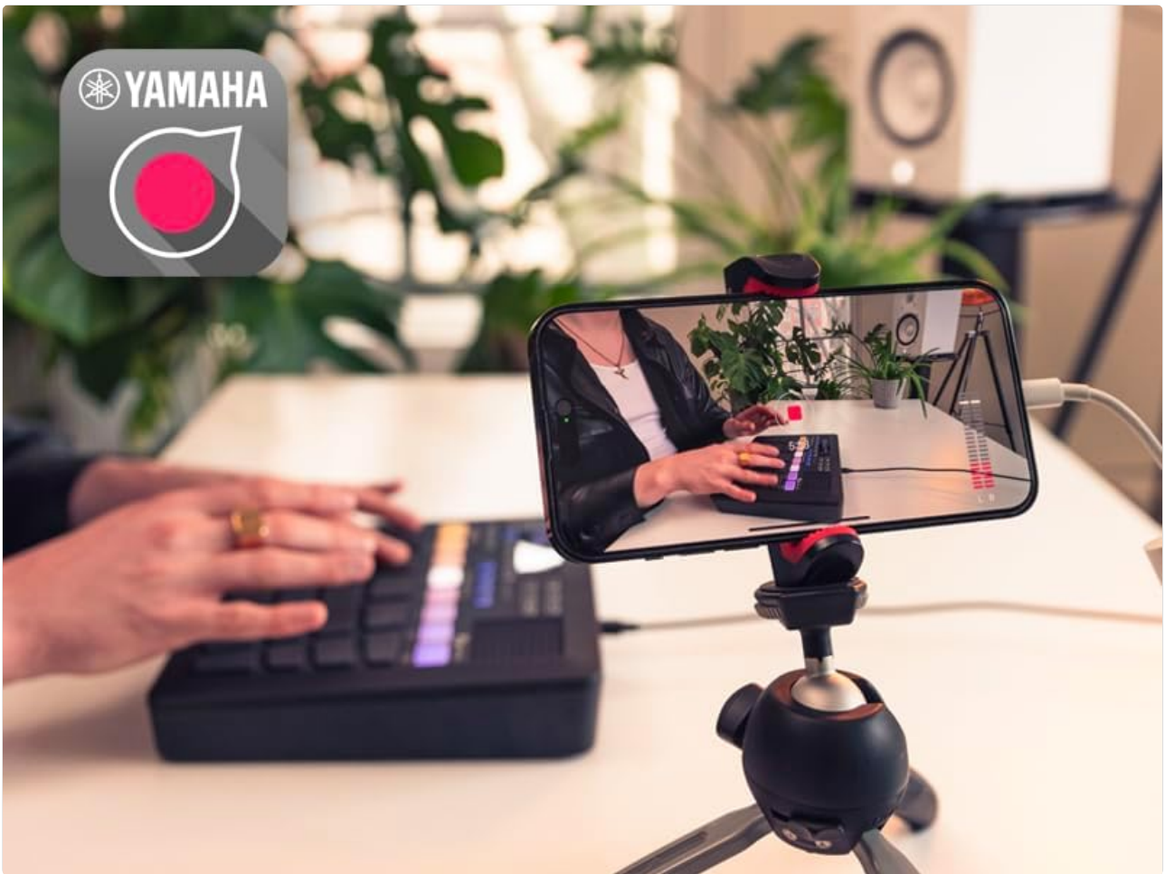
Figure 9: Using the Rec'n'Share app with FGDP-50.