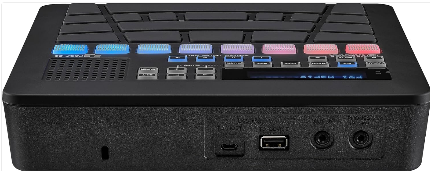
Figure 4: Rear panel connections.