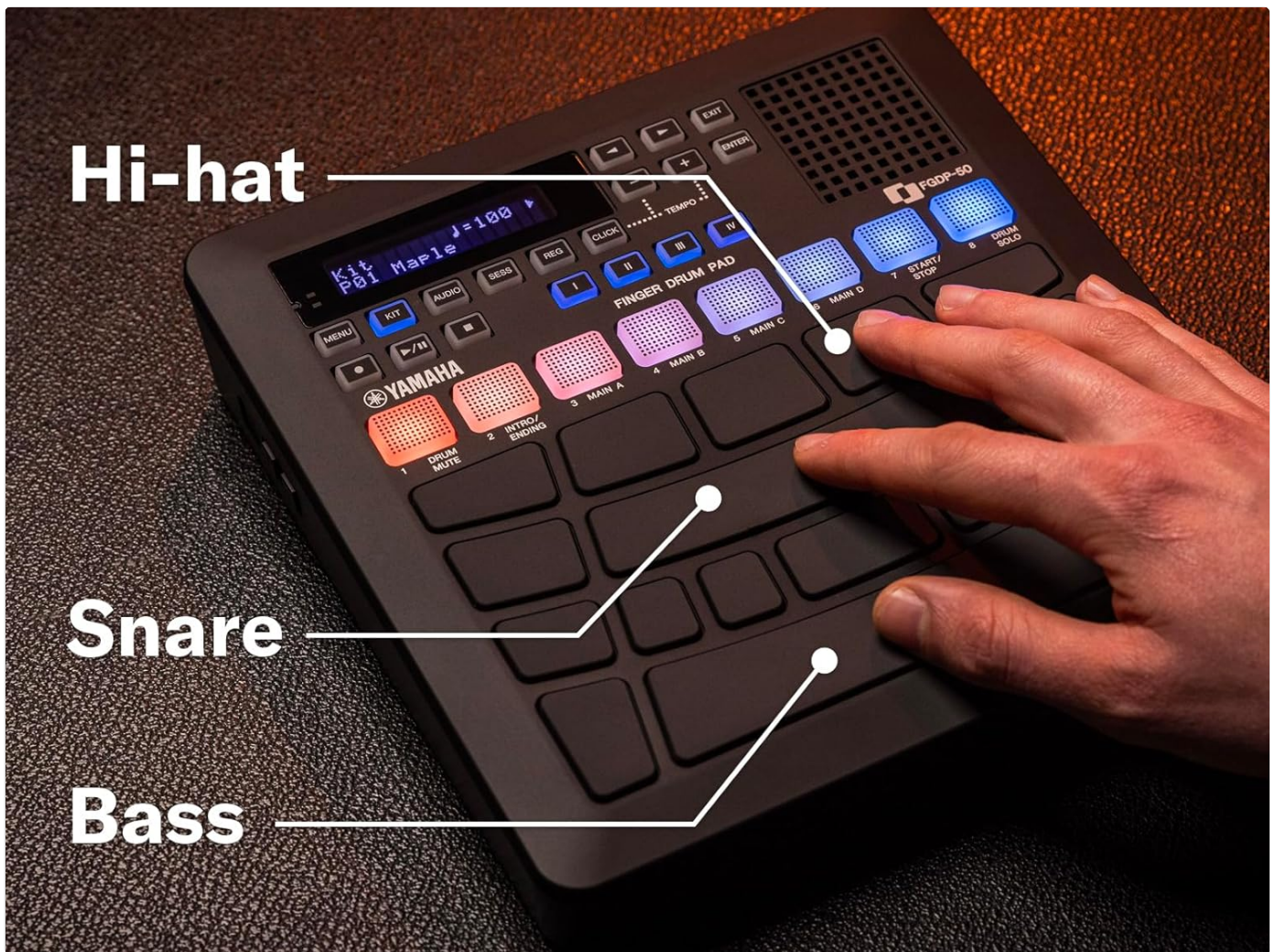
Figure 6: Ergonomic pad layout for finger drumming.