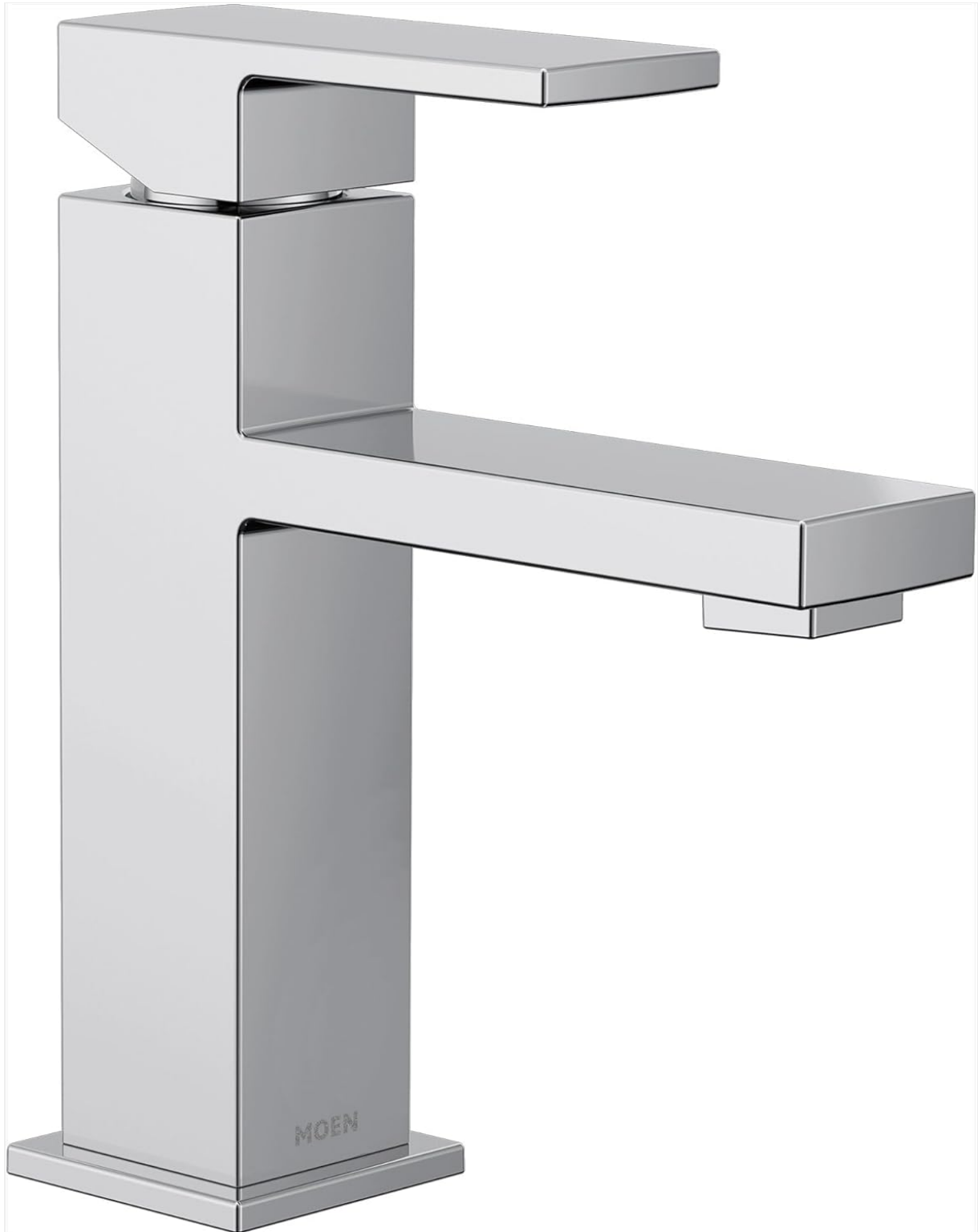
Image: Moen Revyl Chrome Faucet, showing the main faucet body and the optional deck plate.