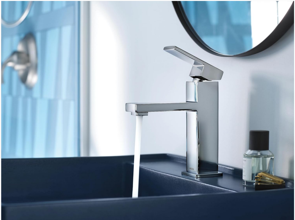
Image: Moen faucet with a badge indicating "America's Most Trusted Faucet Brand" for 10 years in a row, highlighting brand reliability and quality.