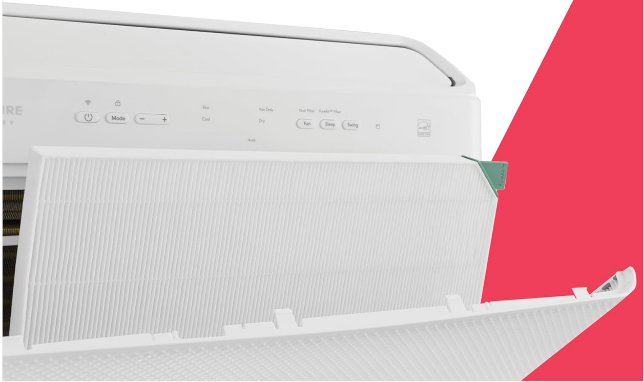
Figure 8: Optional PureAir® Advanced Filter for enhanced air purification.