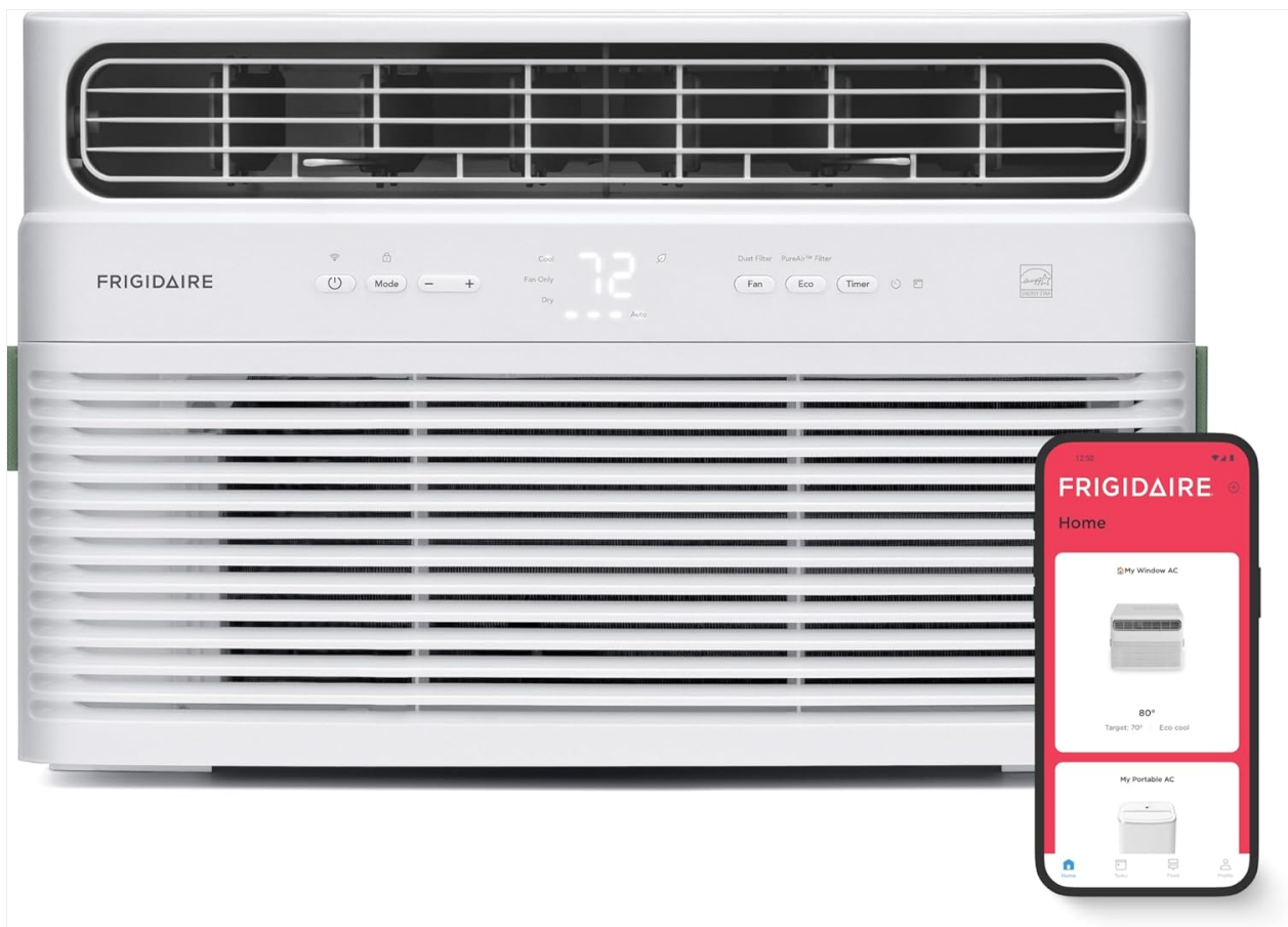
Figure 1: Frigidaire 8,000 BTU Smart Inverter Window Air Conditioner with its remote control and a smartphone displaying the Frigidaire app interface.