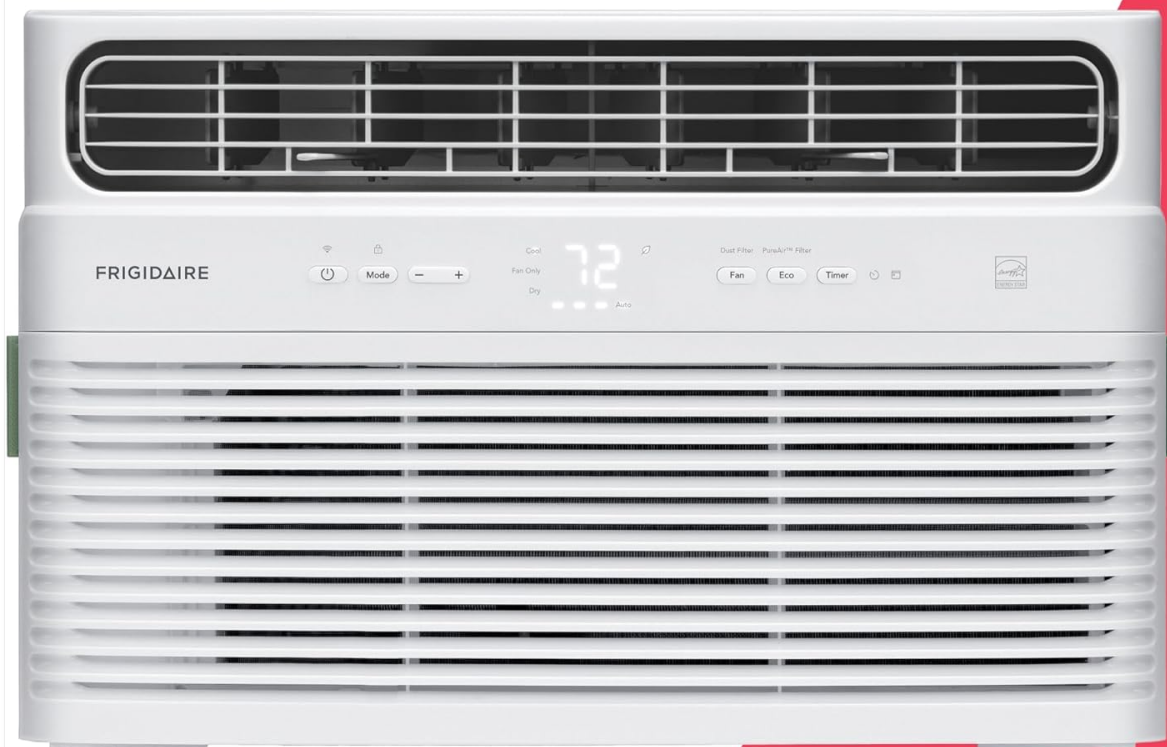
Figure 7: Easy-to-clean washable filter for efficient air conditioning.

Capture dust from the air and keep your air conditioner working efficiently with the easy-to-clean washable filter