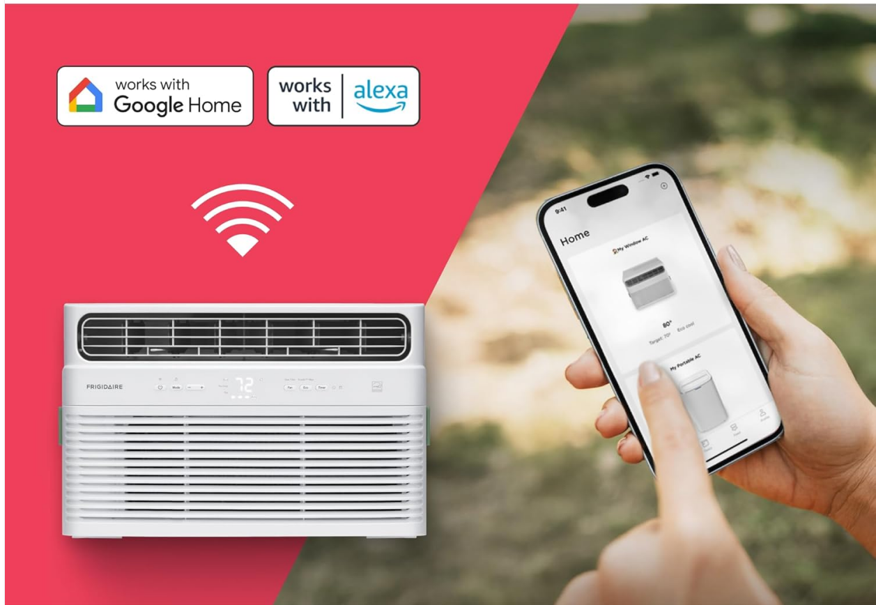
Figure 6: Control your AC unit from anywhere with the Frigidaire app.