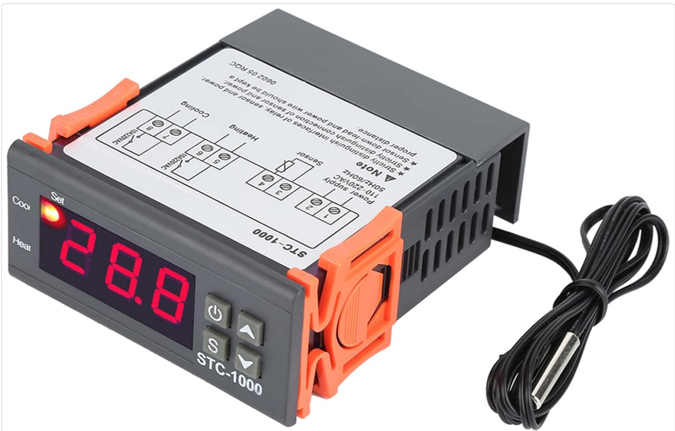
Figure 1.1: The Mokernali STC-1000 Digital Temperature Controller, showing the main unit with its digital display, control buttons, and attached temperature sensor probe.

The Mokernali STC-1000 is a versatile digital temperature controller designed for precise temperature management in various environments. It features both heating and cooling control modes, allowing it to maintain a desired temperature range. This device is suitable for applications such as aquariums, chicken incubators, terrariums, and other temperature-sensitive systems. It operates on an AC 110-220V power supply and supports both Fahrenheit and Celsius temperature displays.