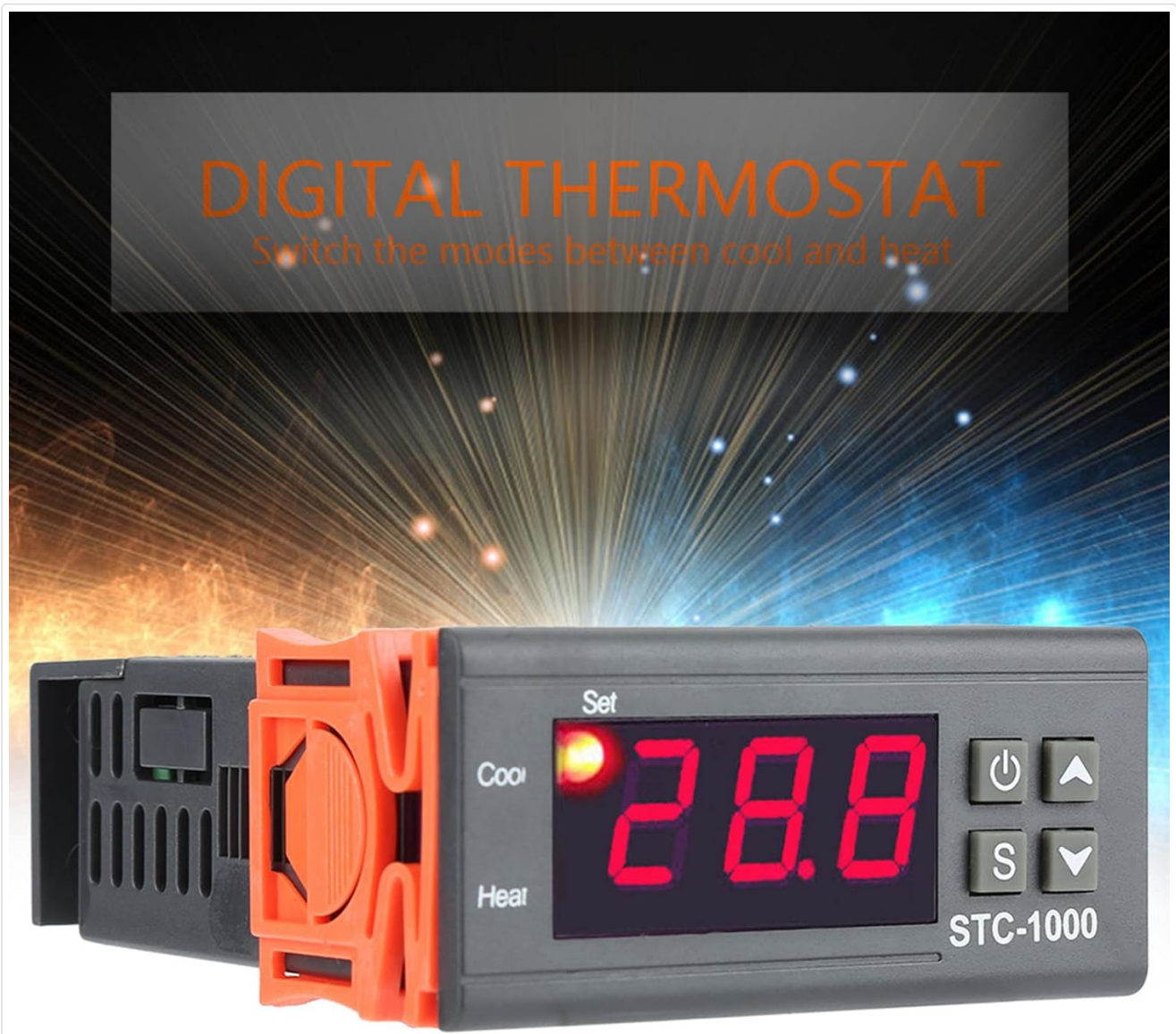
Figure 2.1: Front view of the STC-1000, highlighting the digital display, 'Set' indicator, 'Cool' and 'Heat' indicators, and the control buttons (Power, Set, Up, Down).