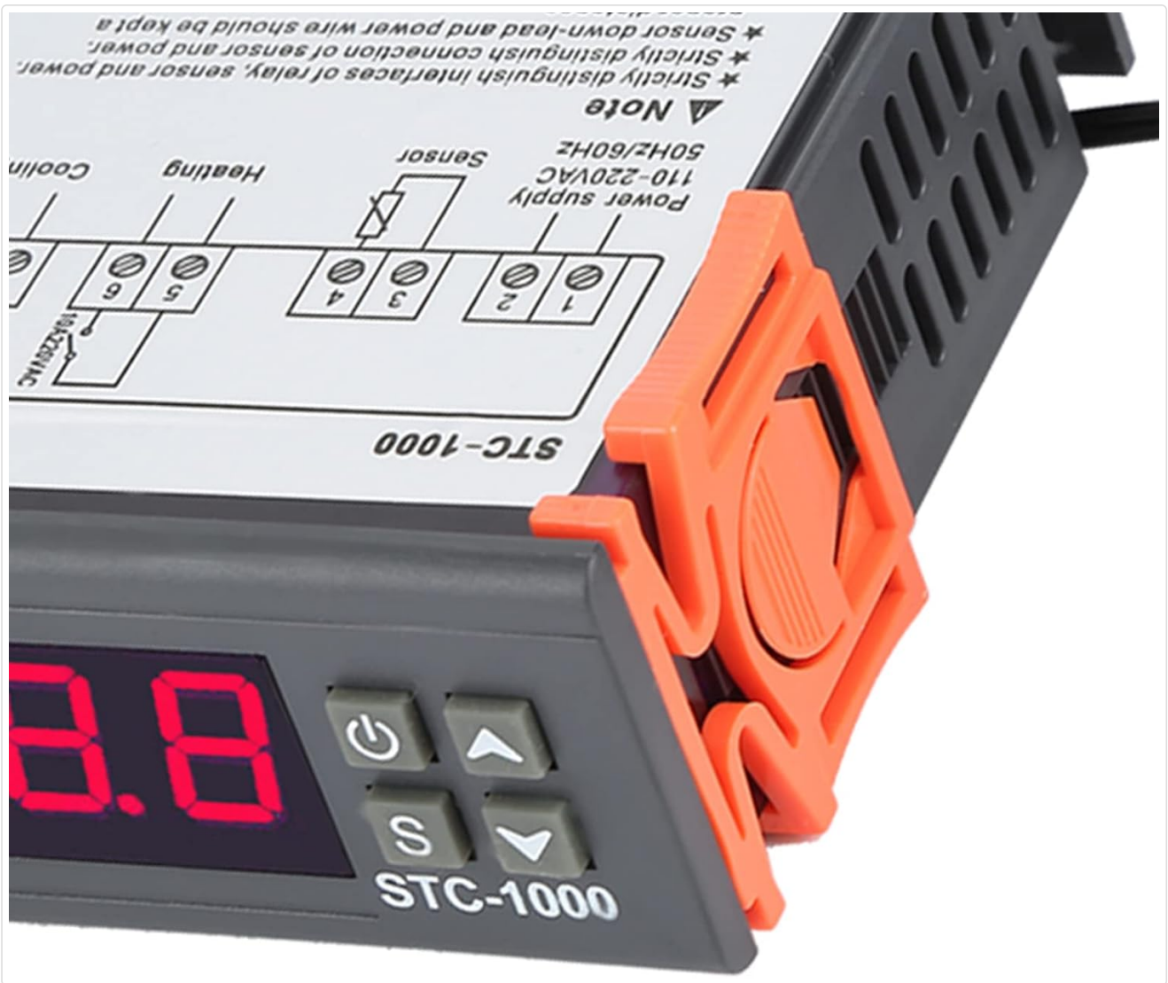
Figure 2.2: A detailed view of the STC-1000's digital display and control panel, showing the 'Set' button, 'Up' arrow, 'Down' arrow, and 'Power' button.