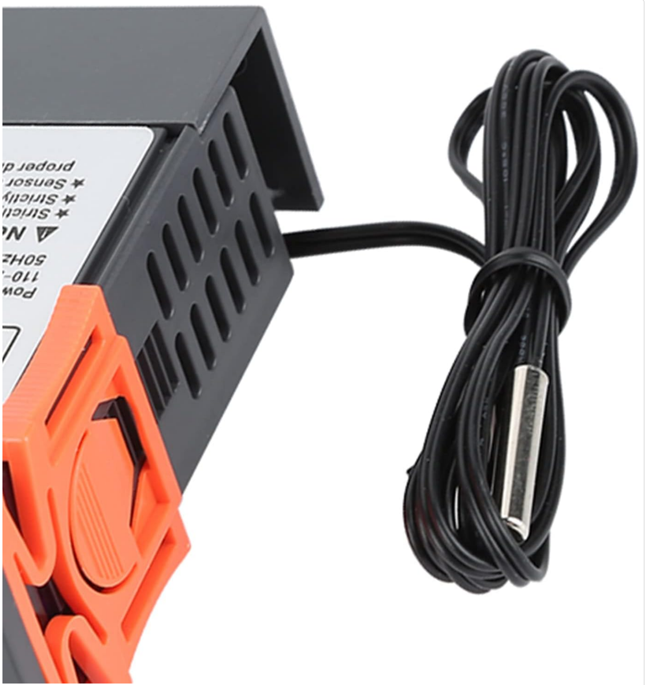
Figure 2.3: Close-up image of the waterproof temperature sensor probe, which connects to the controller to measure ambient temperature.