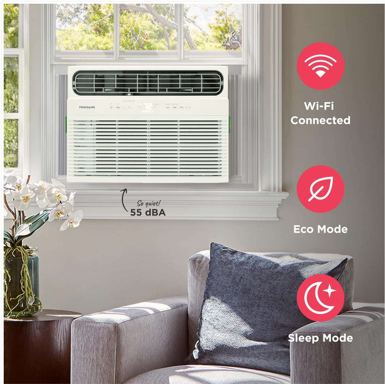
Figure 3: The unit's control panel and remote control, highlighting Wi-Fi, Eco, and Sleep modes.