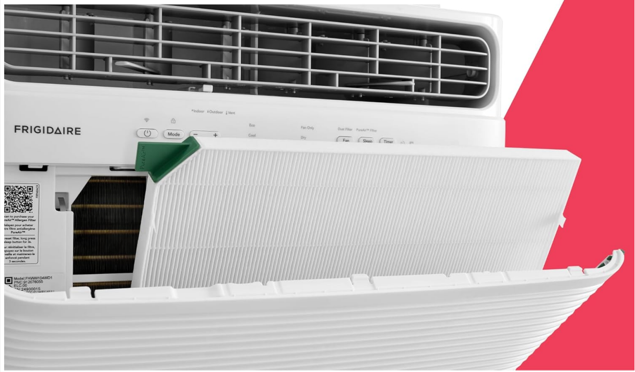
Figure 5: The easy-to-clean washable filter being removed from the unit for maintenance.