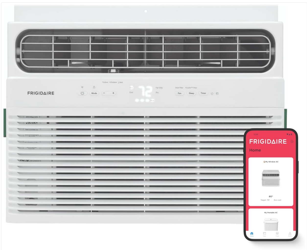
Figure 1: Front view of the Frigidaire FHWW124TE1 Smart Window Air Conditioner.