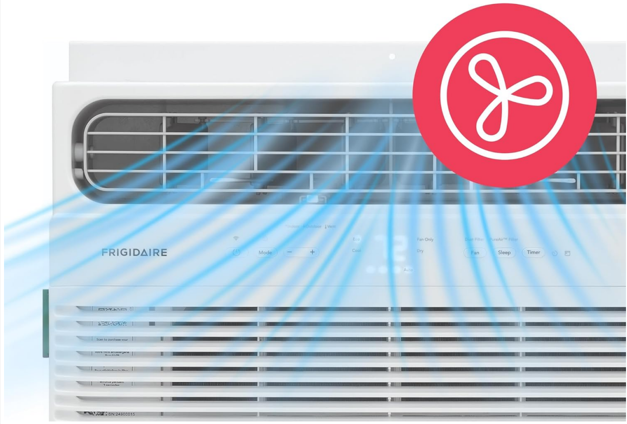
Figure 4: Control your Frigidaire air conditioner from anywhere using the Frigidaire app, compatible with Google Home and Amazon Alexa.