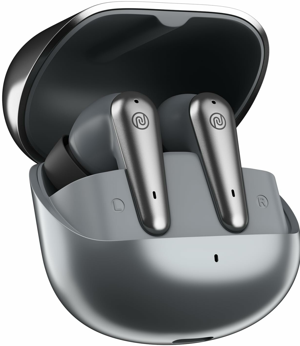
The Noise Buds X Prime earbuds nestled in their sleek, open charging case, highlighting their metallic silver-grey design.