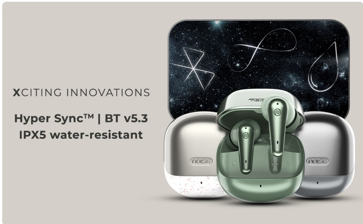
Detail of the earbud's premium dual-tone finish, emphasizing its aesthetic design.

An overview of the Noise Buds X Prime's key features, including its premium design, extended battery life, powerful drivers, fast charging, and advanced microphone system.