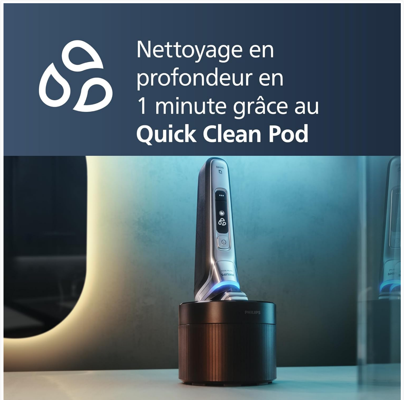
Image 6: The Philips S9000 shaver placed in its Quick Clean Pod, illustrating the automated cleaning process that takes approximately one minute.