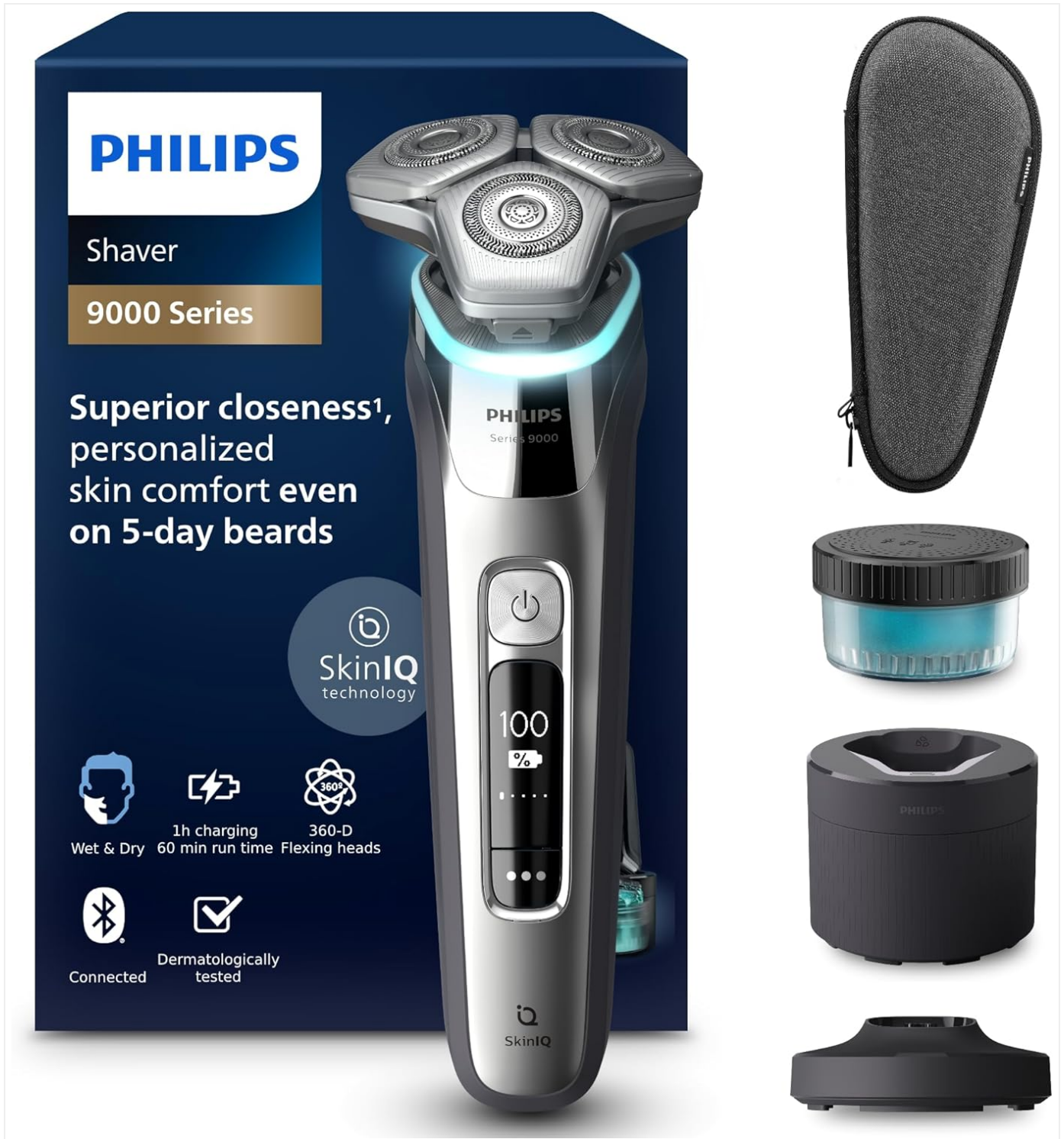
Image 1: Philips S9000 Shaver with its packaging and included accessories, including the charging stand, Clean Pod, and travel case.