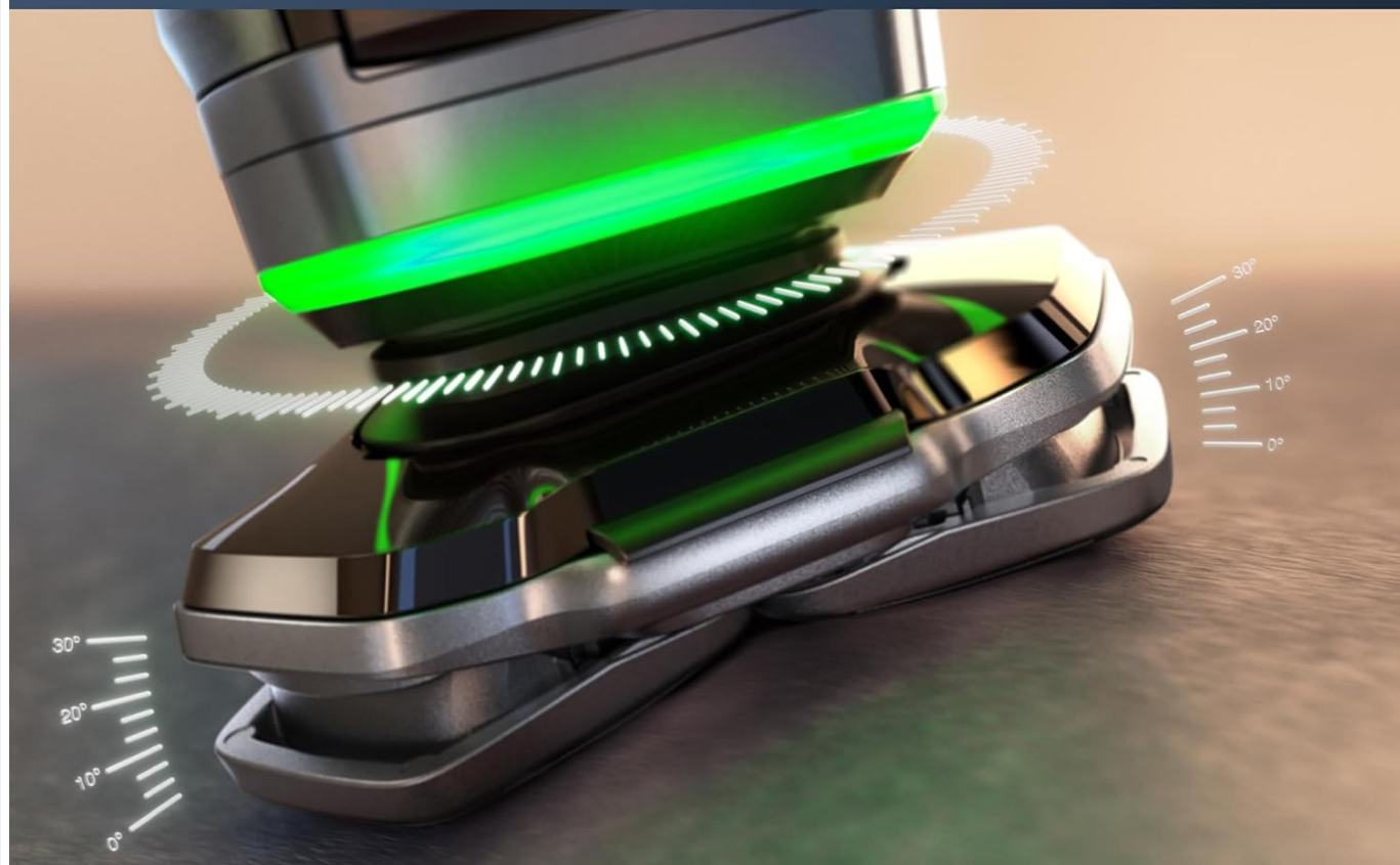
Image 4: The shaver head demonstrating its 360-degree flexible movement, designed to follow every curve of the face for a close shave.

S'adapte à tous les contours de votre visage grâce aux têtes flexibles 360-D