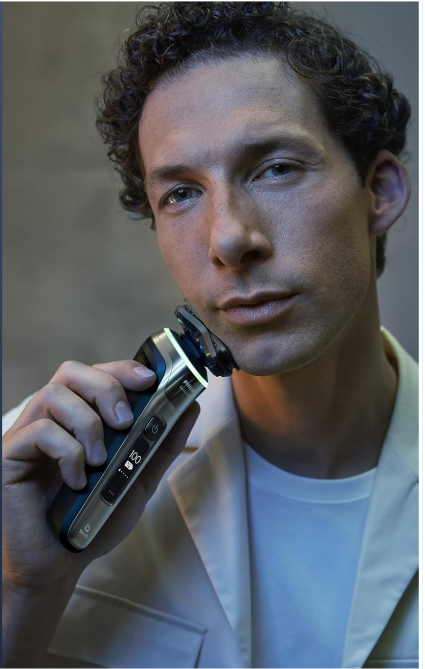
Image 2: A man using the Philips S9000 shaver, demonstrating its ergonomic design and how it adapts to facial contours. The SkinIQ technology detects, guides, and adapts to your shaving style.