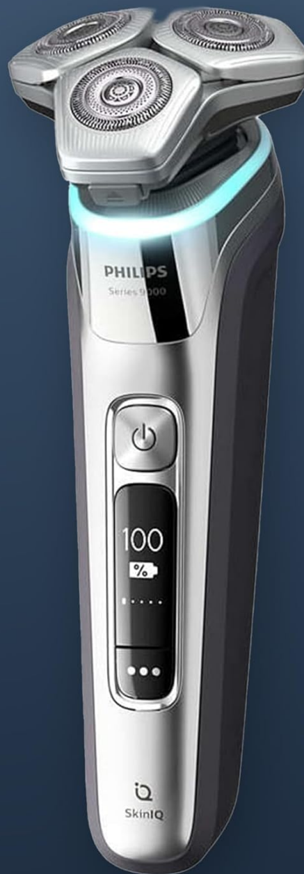
Image 7: The Philips S9000 shaver, emphasizing its 5-year warranty, a testament to its durability and quality.