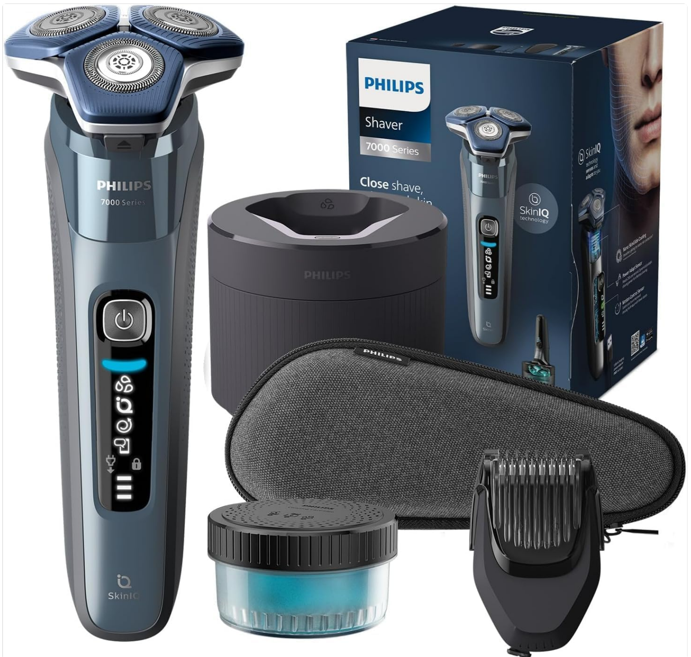
Image: The Philips Shaver Series 7000, accompanied by its Quick Clean Pod, beard trimmer attachment, travel case, and charging cable.