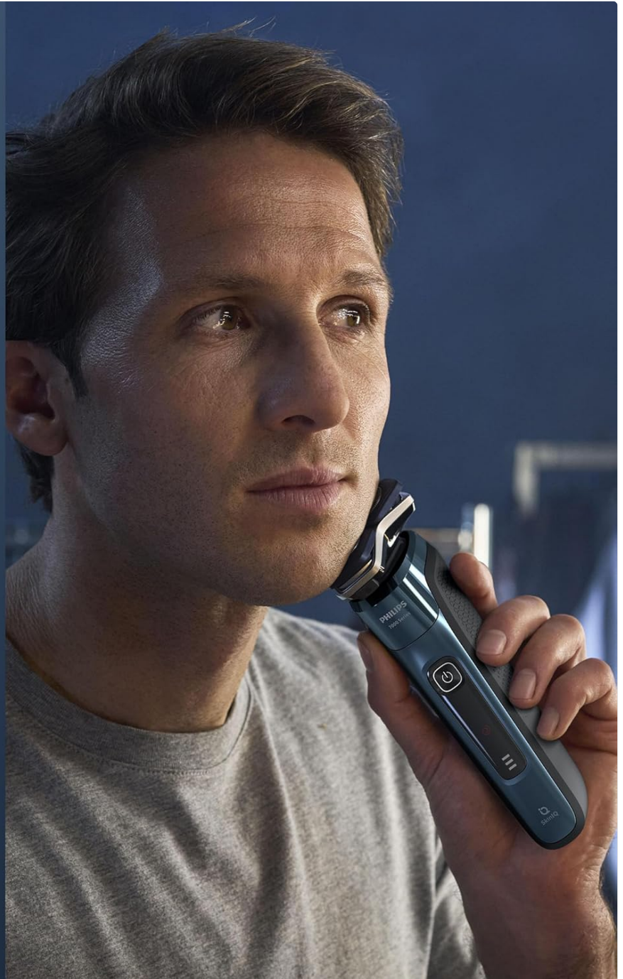
Image: A man using the Philips Shaver Series 7000, demonstrating the shaver's ability to adapt to facial contours with SkinIQ technology.

Detecteert, begeleidt en past zich aan u aan