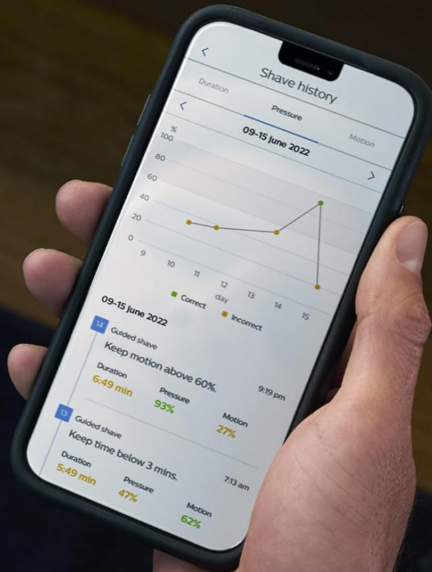
Image: A hand holding a smartphone showing the Philips GroomTribe app interface, which allows users to track and personalize their shaving routine.

Volg eenvoudig uw voortgang en geef uw routine een persoonlijk tintje