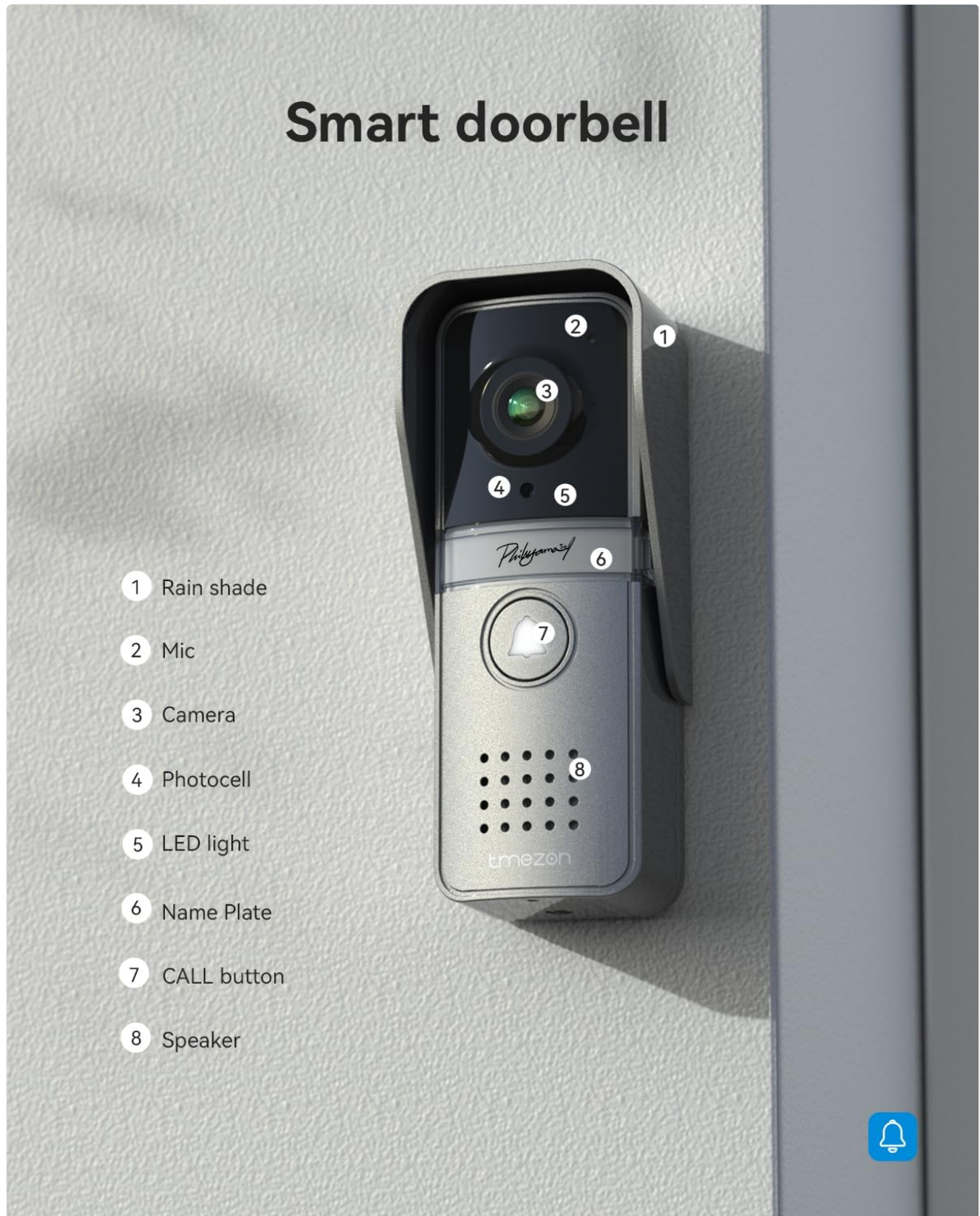
Figure 2: Detailed view of the outdoor doorbell unit components.

The outdoor unit is designed for durability and clear communication: