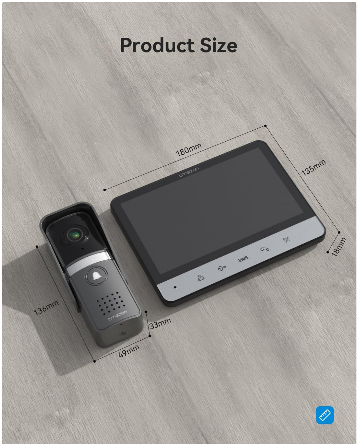
Figure 9: Product dimensions for the indoor monitor and outdoor unit.