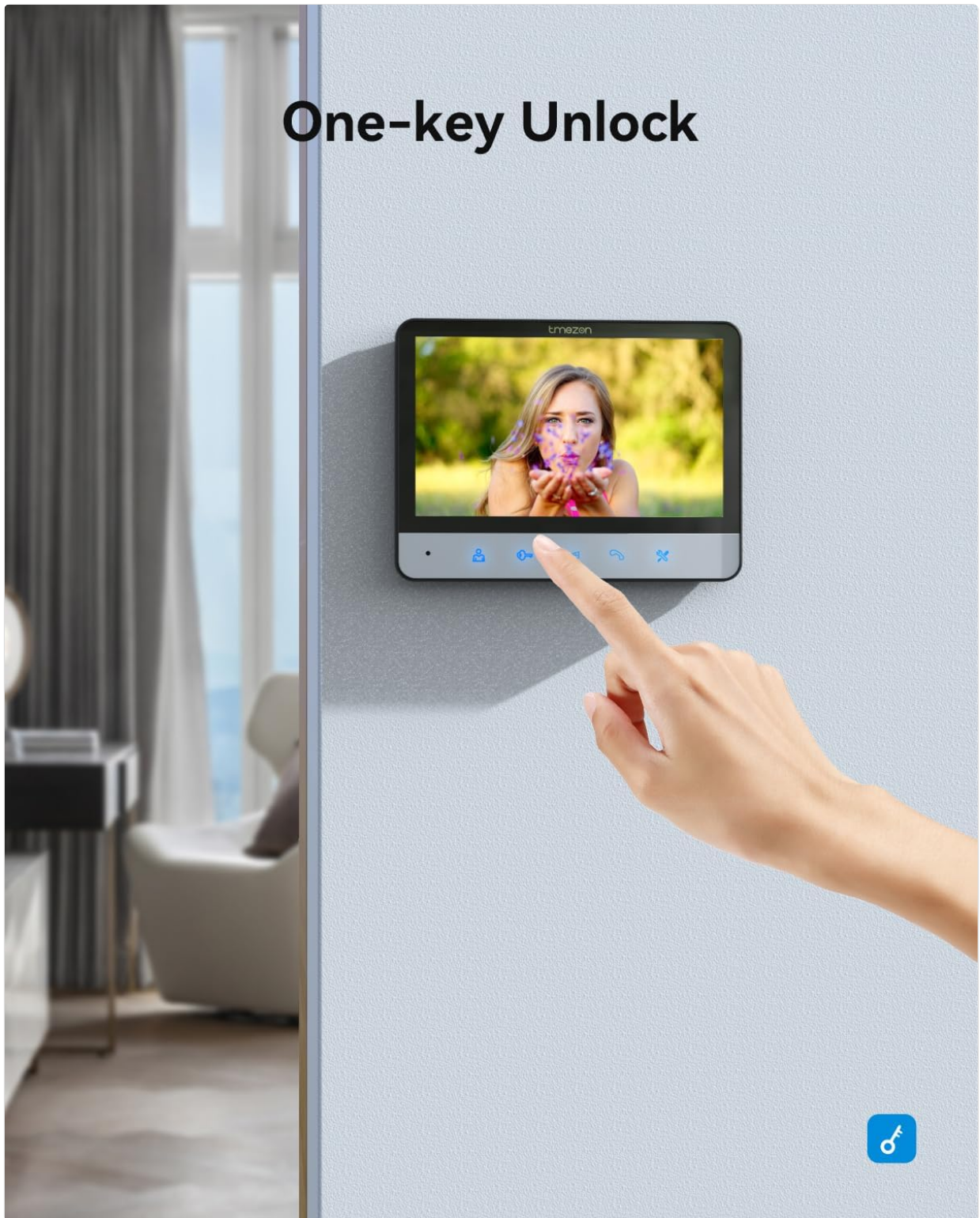
Figure 4: The indoor monitor allows for one-key unlocking of connected electronic locks.

The monitor provides a clear view of the outdoor camera feed and allows for interaction with visitors.