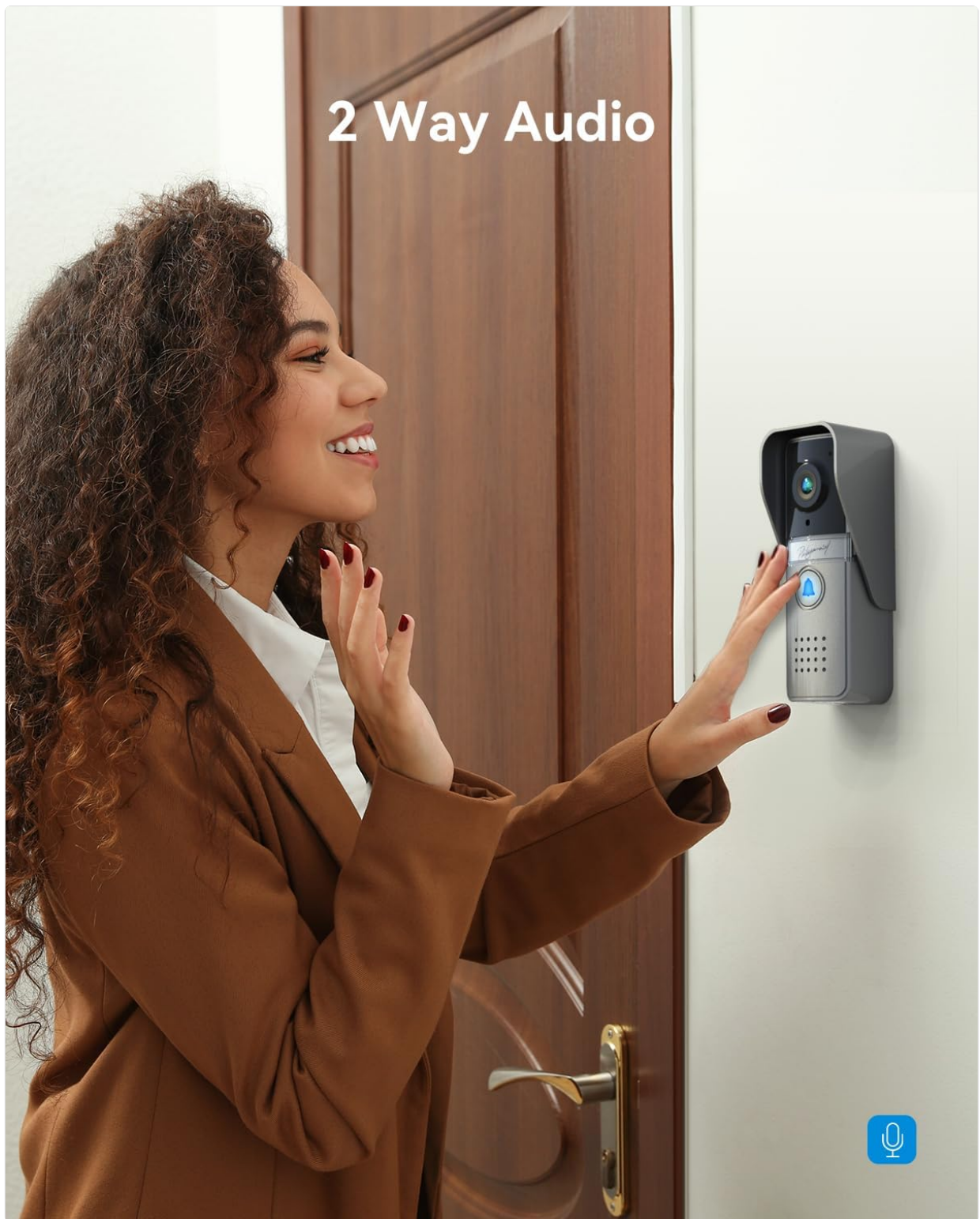
Figure 8: Engage in clear two-way audio communication with visitors at your door.