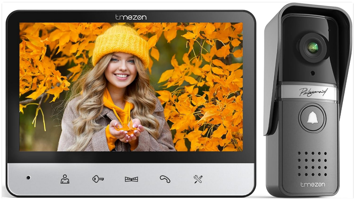
Figure 1: TMEZON Wired Video Intercom System showing the indoor monitor and outdoor doorbell unit.