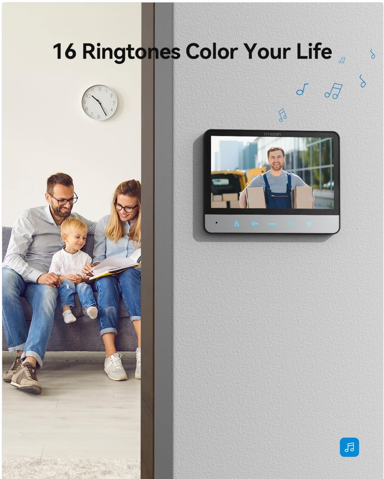
Figure 6: Choose from 16 different ringtones to customize your system's alerts.