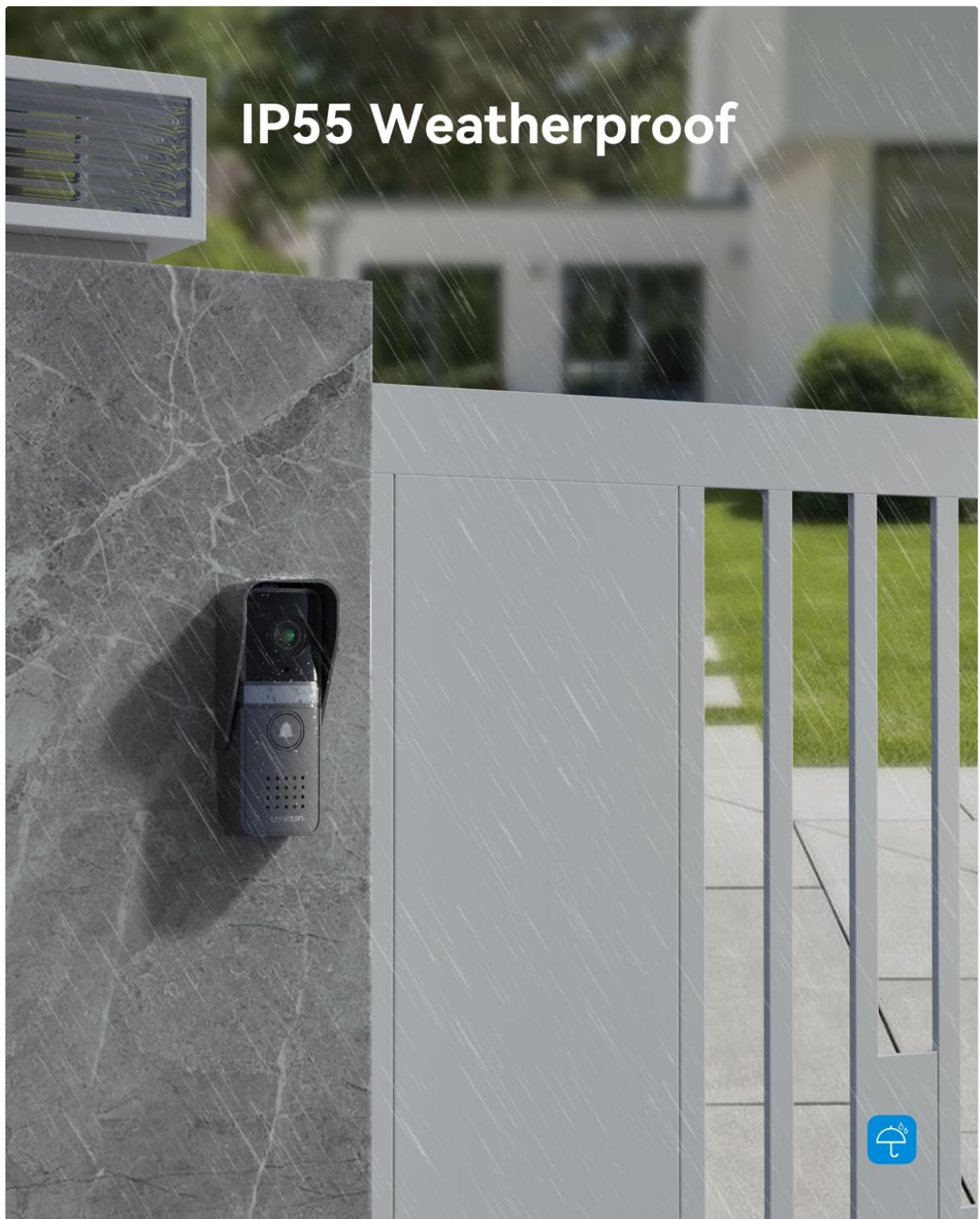
Figure 3: The outdoor unit features an IP55 weatherproof rating, ensuring reliable operation in various weather conditions.