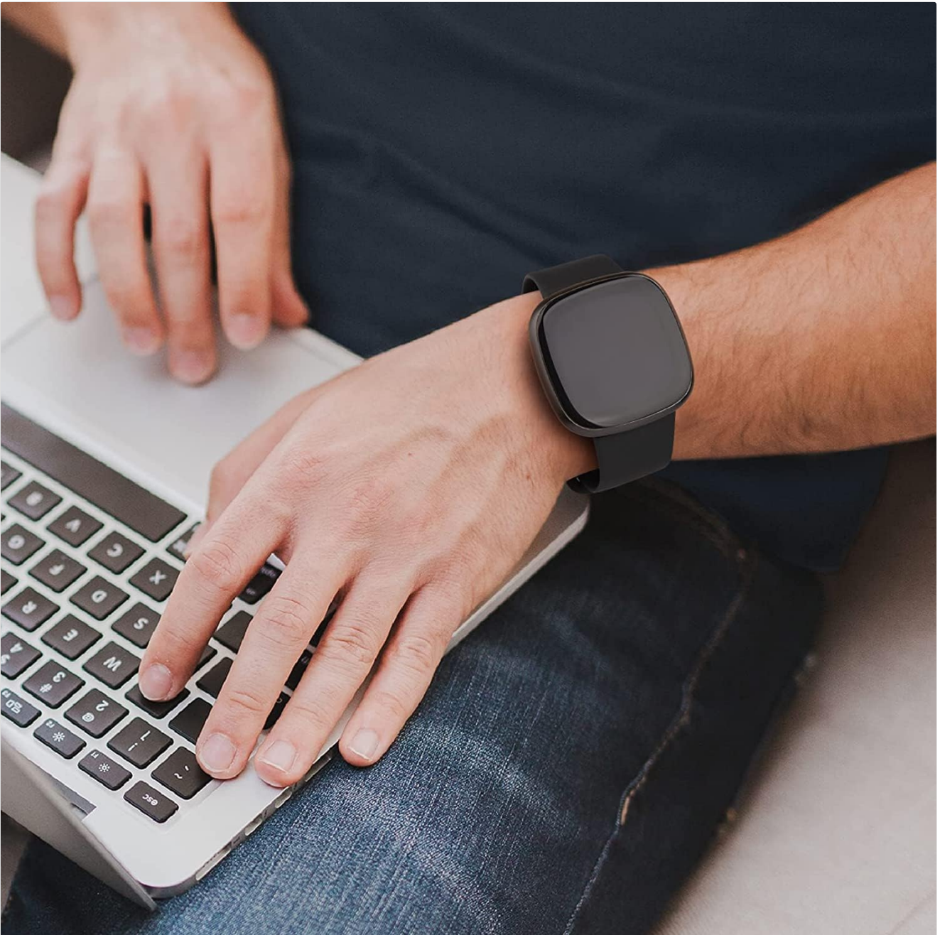
Image: A person wearing a black Lamshaw 22mm silicone smartwatch band while using a laptop.

Once installed, adjust the band to a comfortable fit on your wrist using the buckle. Ensure the watch is snug but not too tight to allow for proper sensor function and comfort. An overly tight band can restrict circulation, while a loose band may affect sensor accuracy.