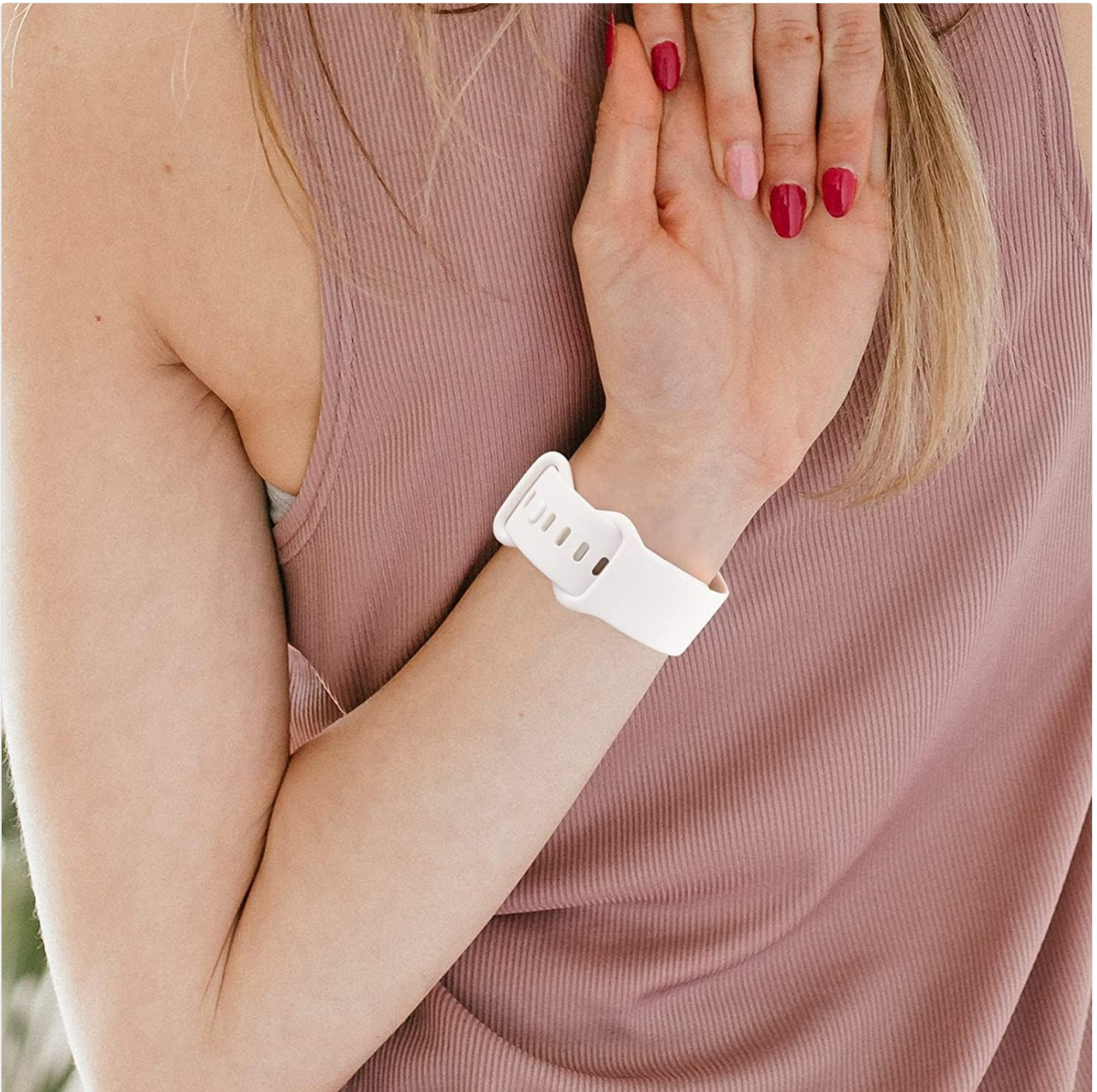
Image: A person wearing a white Lamshaw 22mm silicone smartwatch band.