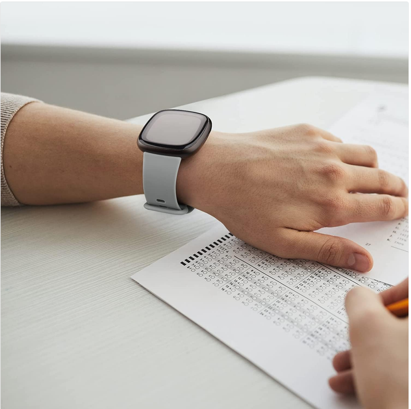
Image: A person wearing a gray Lamshaw 22mm silicone smartwatch band while taking a test.