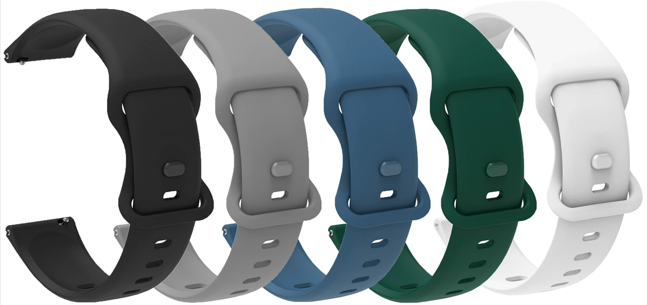
Image: Lamshaw 22mm Soft Silicone Smartwatch Bands, 5-pack, showing various colors.