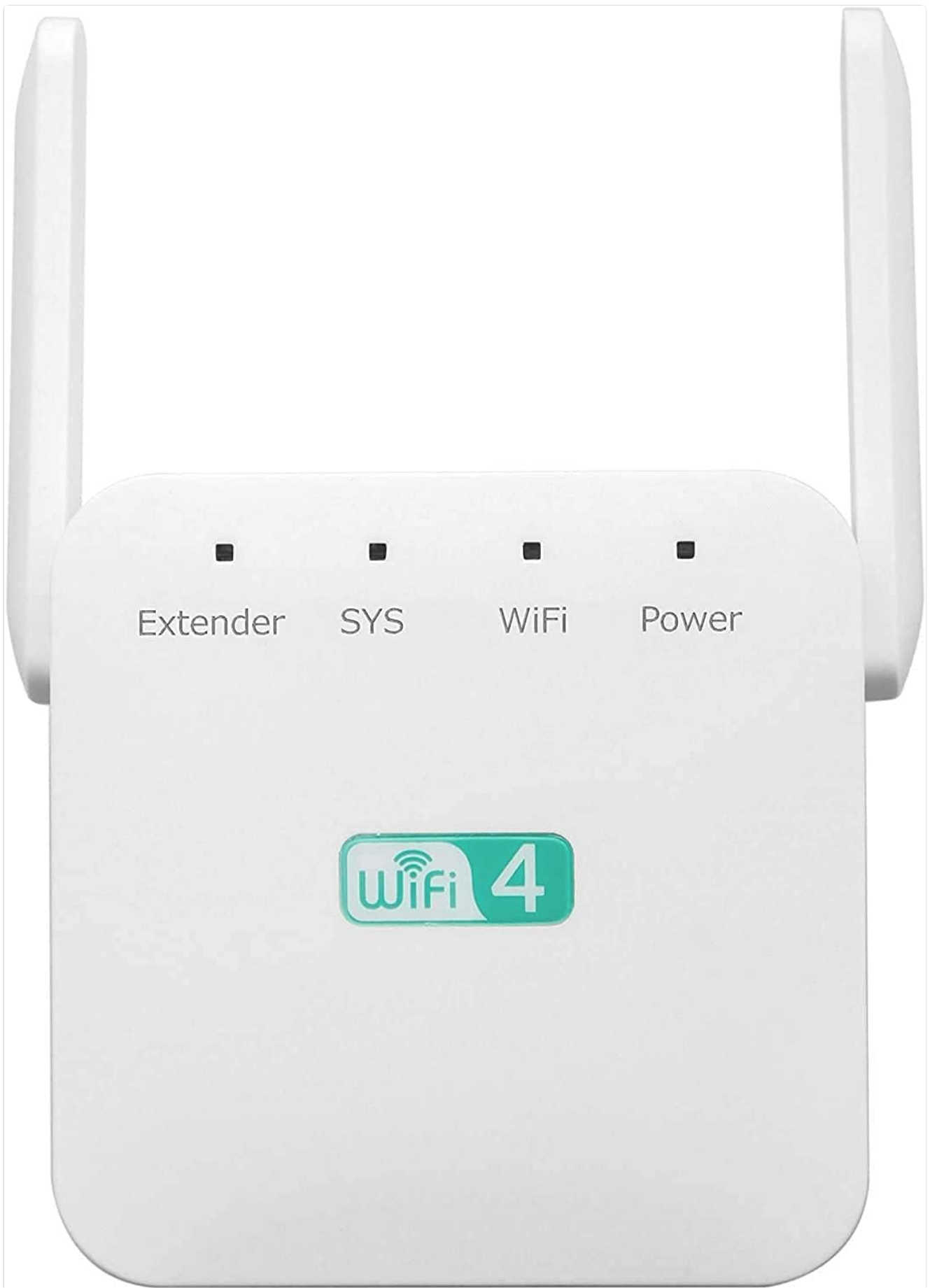
Image: Front view of the Aimery WiFi Extender, showing the Extender, SYS, WiFi, and Power indicator lights, and the 'WiFi 4' logo.