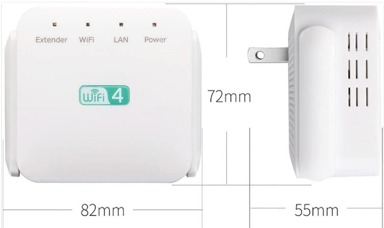
Image: Dimensions of the Aimery WiFi Extender, showing approximate measurements of 82mm width, 72mm height, and 55mm depth when plugged in.