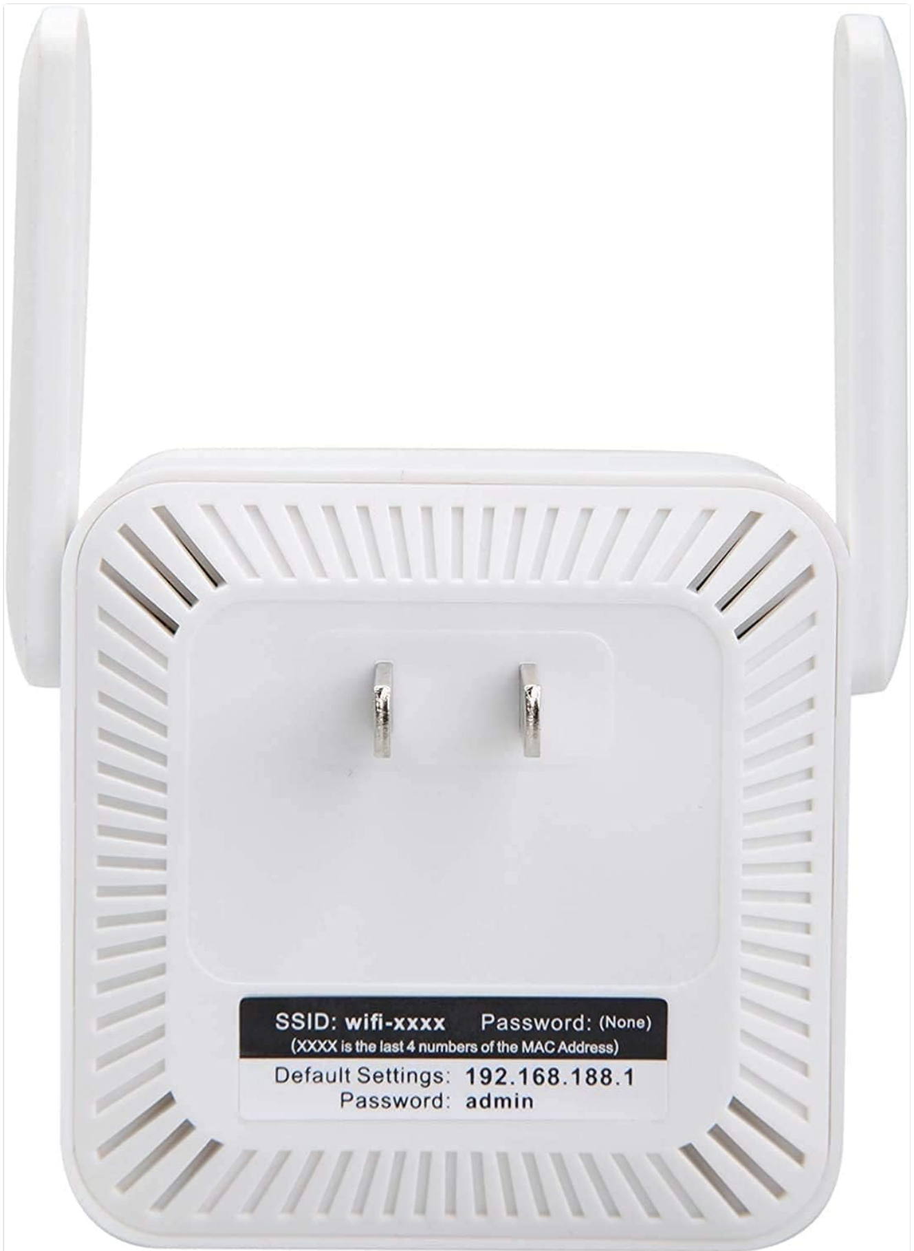
Image: Back view of the Aimery WiFi Extender, displaying the default SSID format (wifi-xxxx) and the default settings IP address (192.168.188.1) and password (admin).