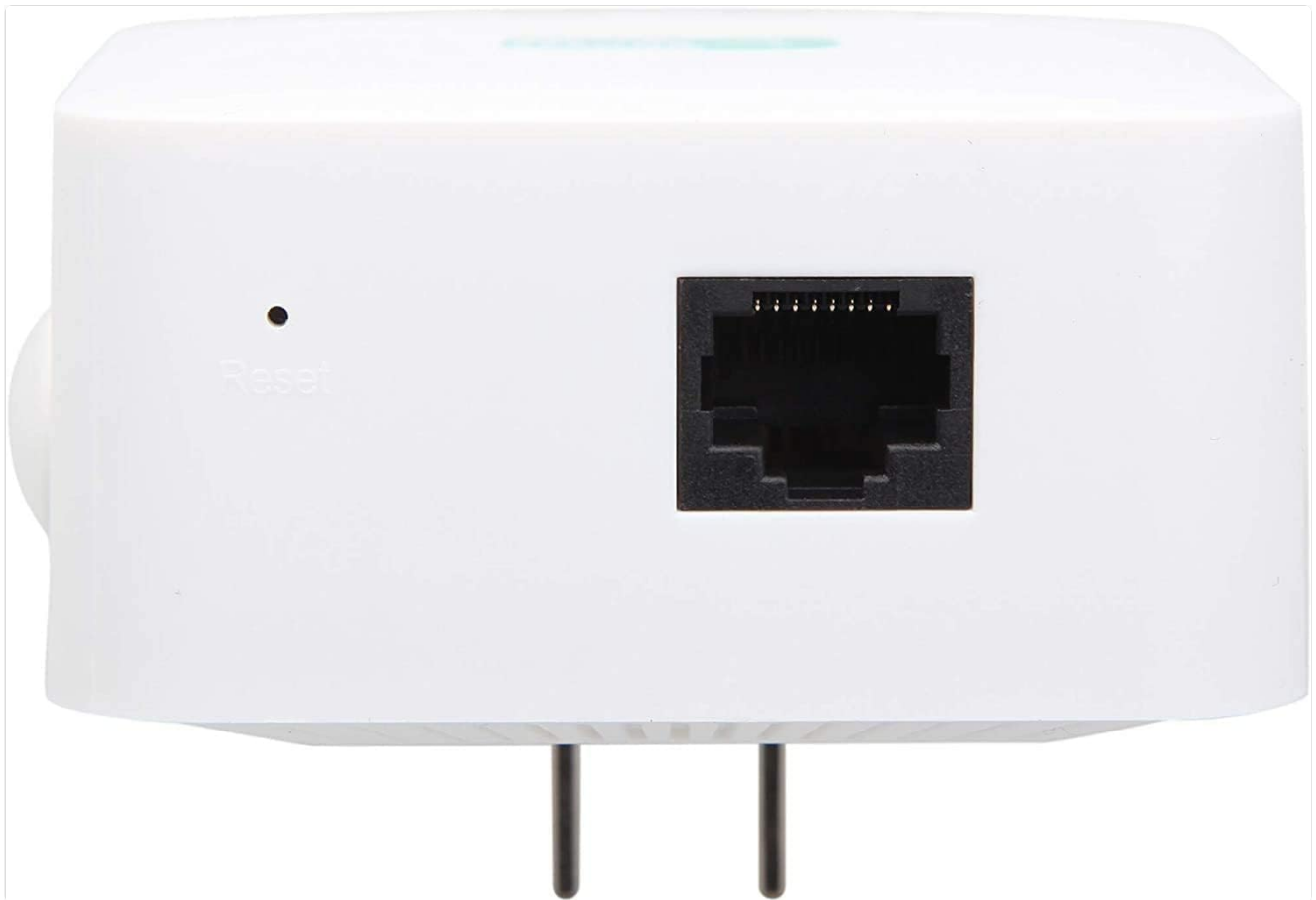
Image: Side view of the Aimery WiFi Extender, highlighting the Ethernet port and the small reset button.