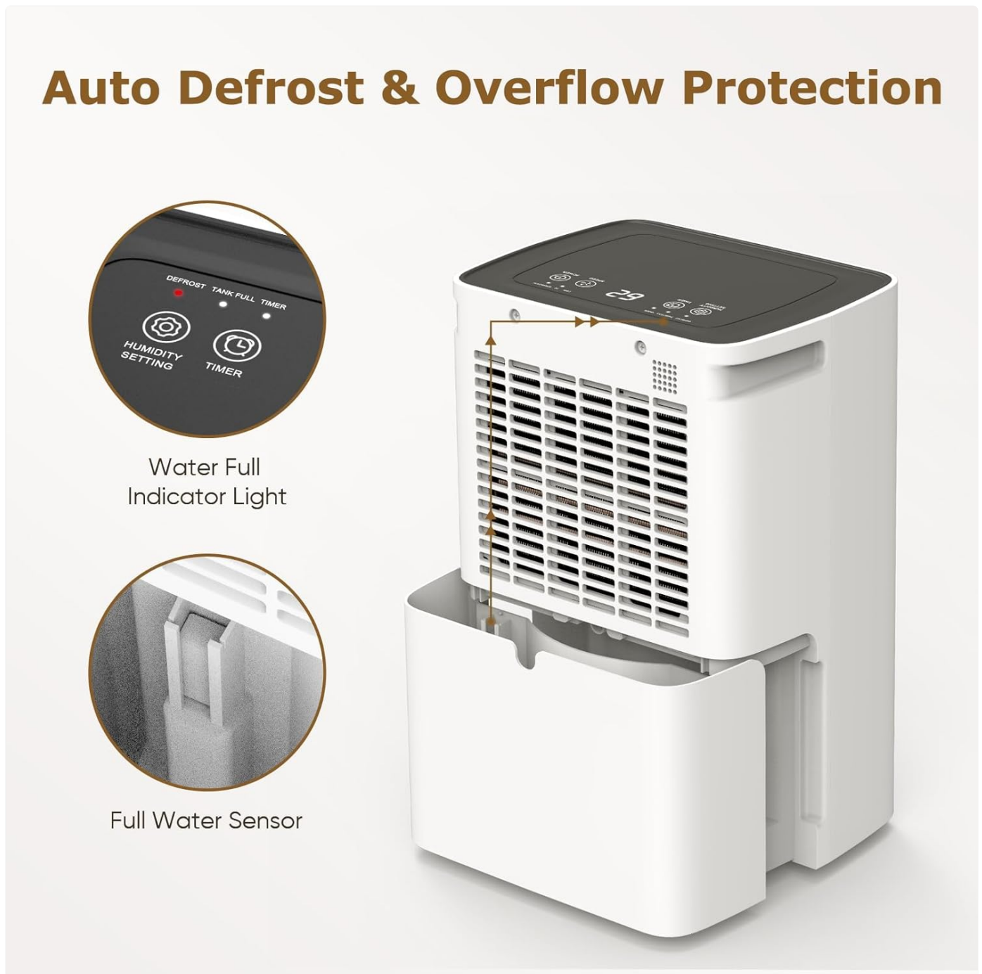
Figure 7: Visual representation of the auto defrost and overflow protection features, highlighting the water full indicator light and the full water sensor in the tank.

When the water tank is full, the dehumidifier will automatically shut off to prevent overflow. The "Tank Full" indicator light will illuminate. Empty the water tank to resume operation.