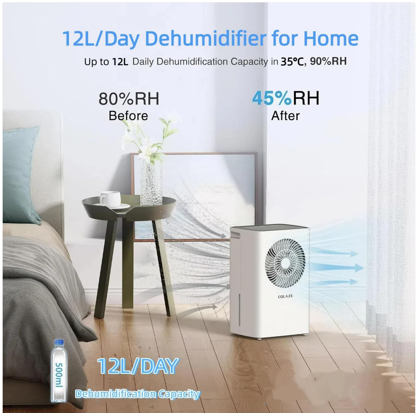
Figure 4: The dehumidifier placed in a room, illustrating its compact size and effective moisture removal from 80% RH to 45% RH.

Place the dehumidifier on a flat, stable surface in the area where moisture reduction is desired. Ensure there is at least 20 cm (8 inches) of clear space around all sides of the unit for proper airflow.