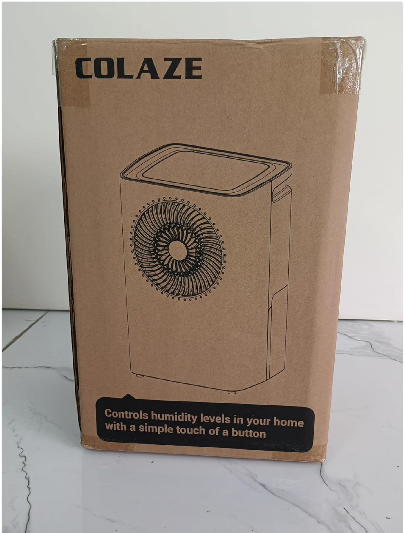
Figure 3: Front view of the COLAZE dehumidifier product packaging.

Carefully remove the dehumidifier from its packaging. Inspect the unit for any signs of damage. Retain the packaging for future storage or transport.