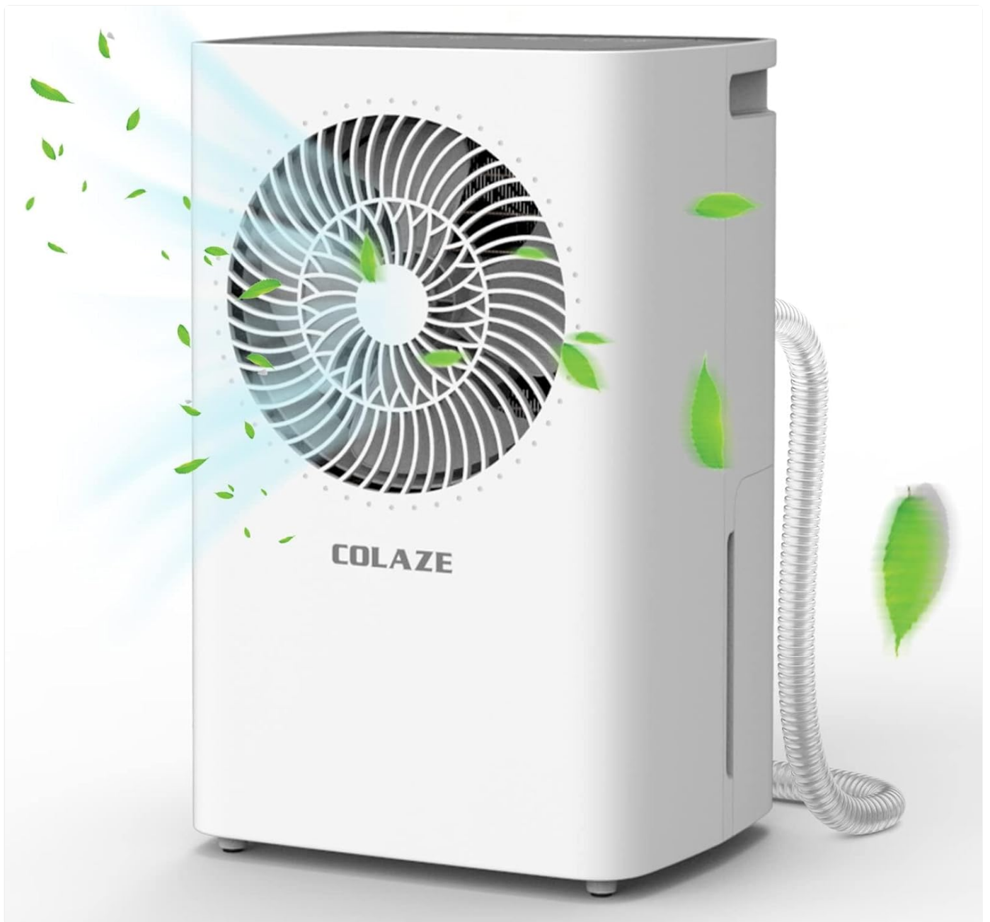
Figure 1: Front view of the COLAZE 12L/Day Dehumidifier, showing the air intake grille and control panel on top.