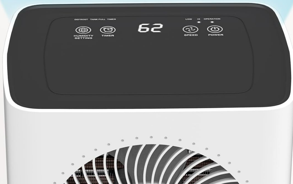
Figure 2: Close-up of the smart control panel located on the top of the dehumidifier, featuring buttons for Humidity Setting, Timer, Speed, and Power, along with a digital display.