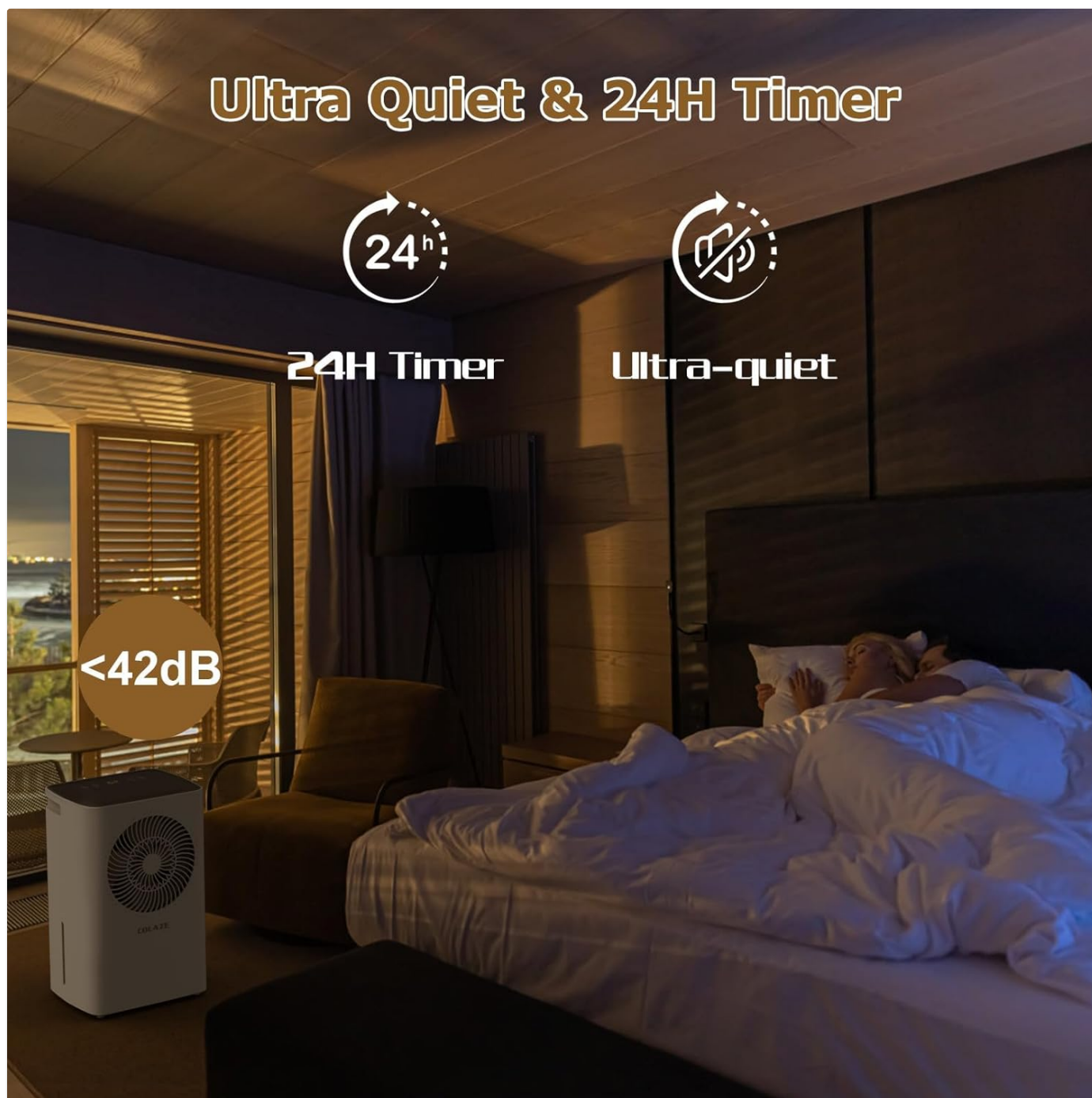
Figure 6: The dehumidifier operating in a bedroom, demonstrating its ultra-quiet operation (below 42dB) and 24-hour timer function, suitable for use during sleep.

Press the Speed button to switch between Low and High fan speeds. High speed provides faster dehumidification, while Low speed offers quieter operation.