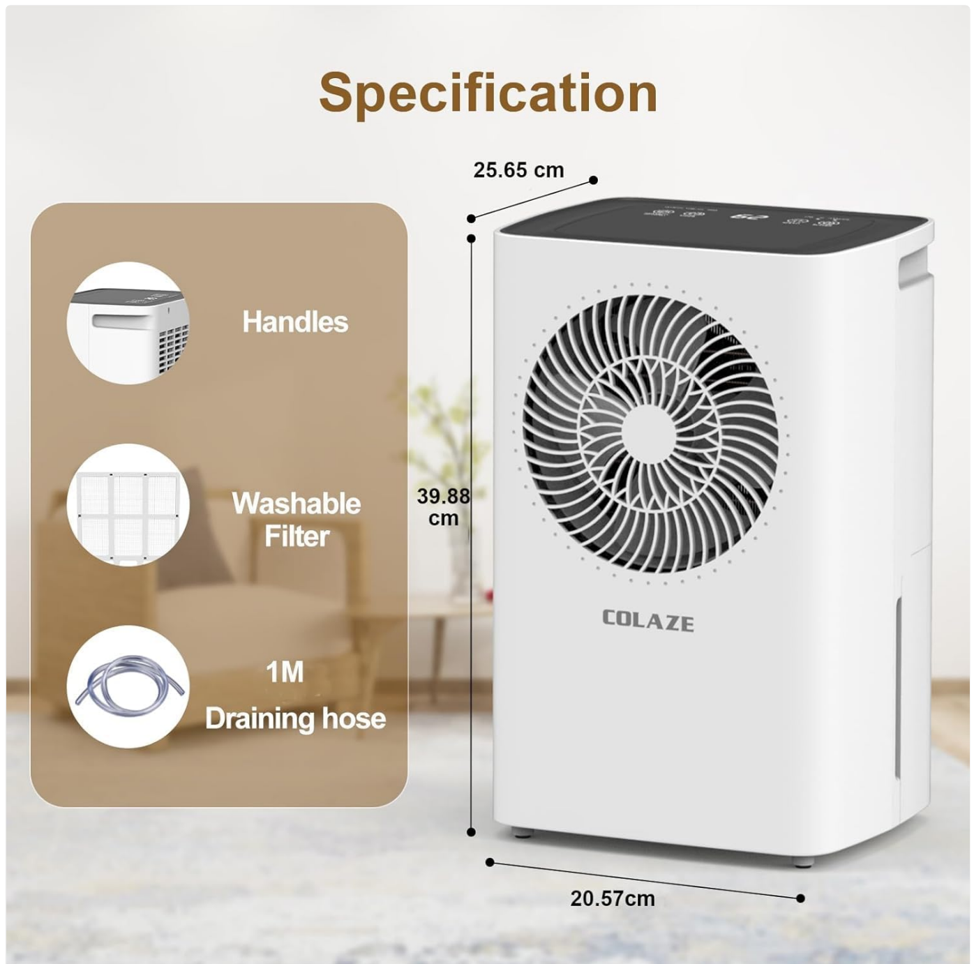
Figure 8: Image highlighting the washable filter, handles, and 1M draining hose, along with product dimensions.