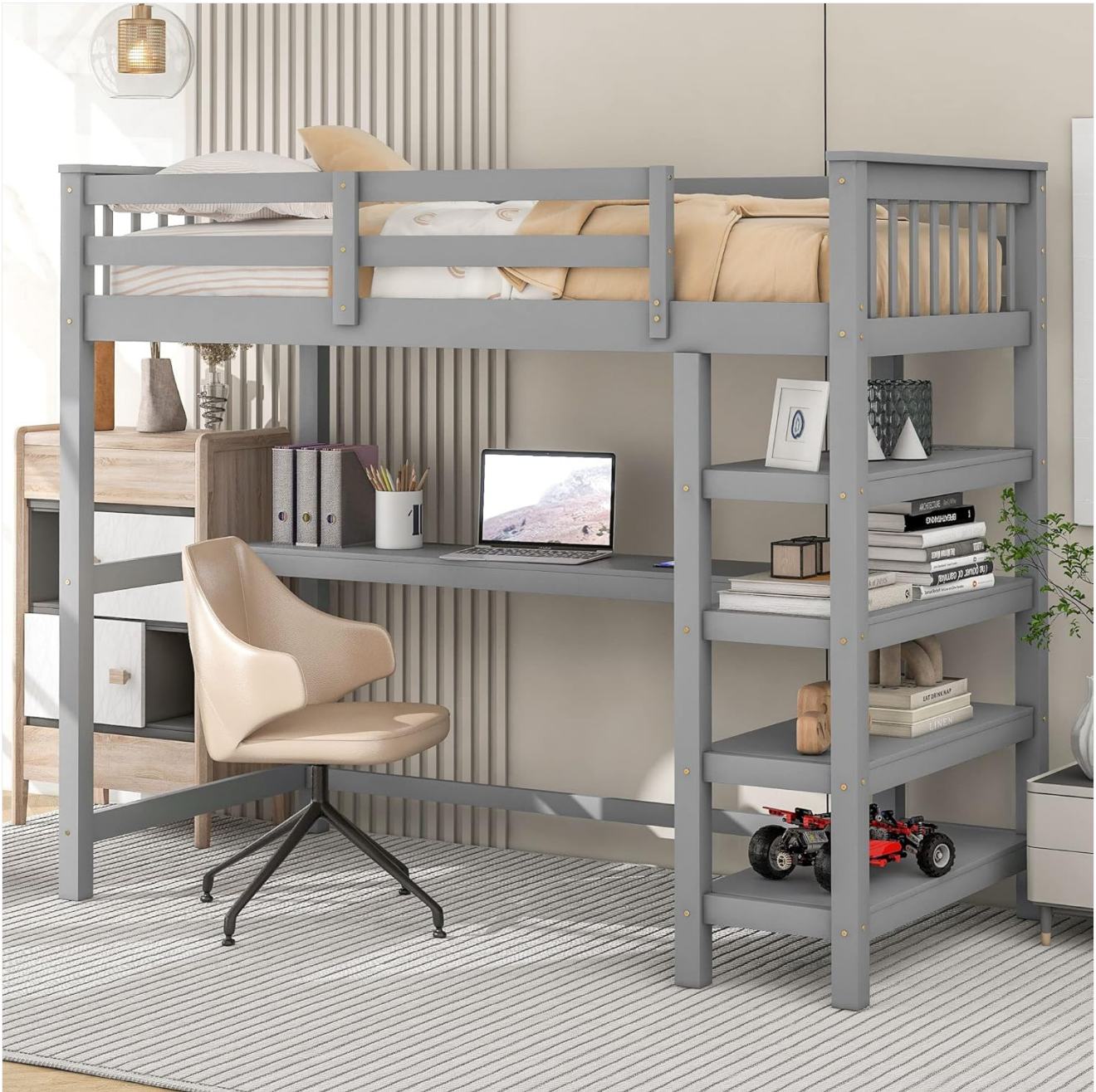
Image: Front view of the Merax Full Size Grey Wood Loft Bed, showcasing the elevated bed, integrated desk, and side storage shelves.