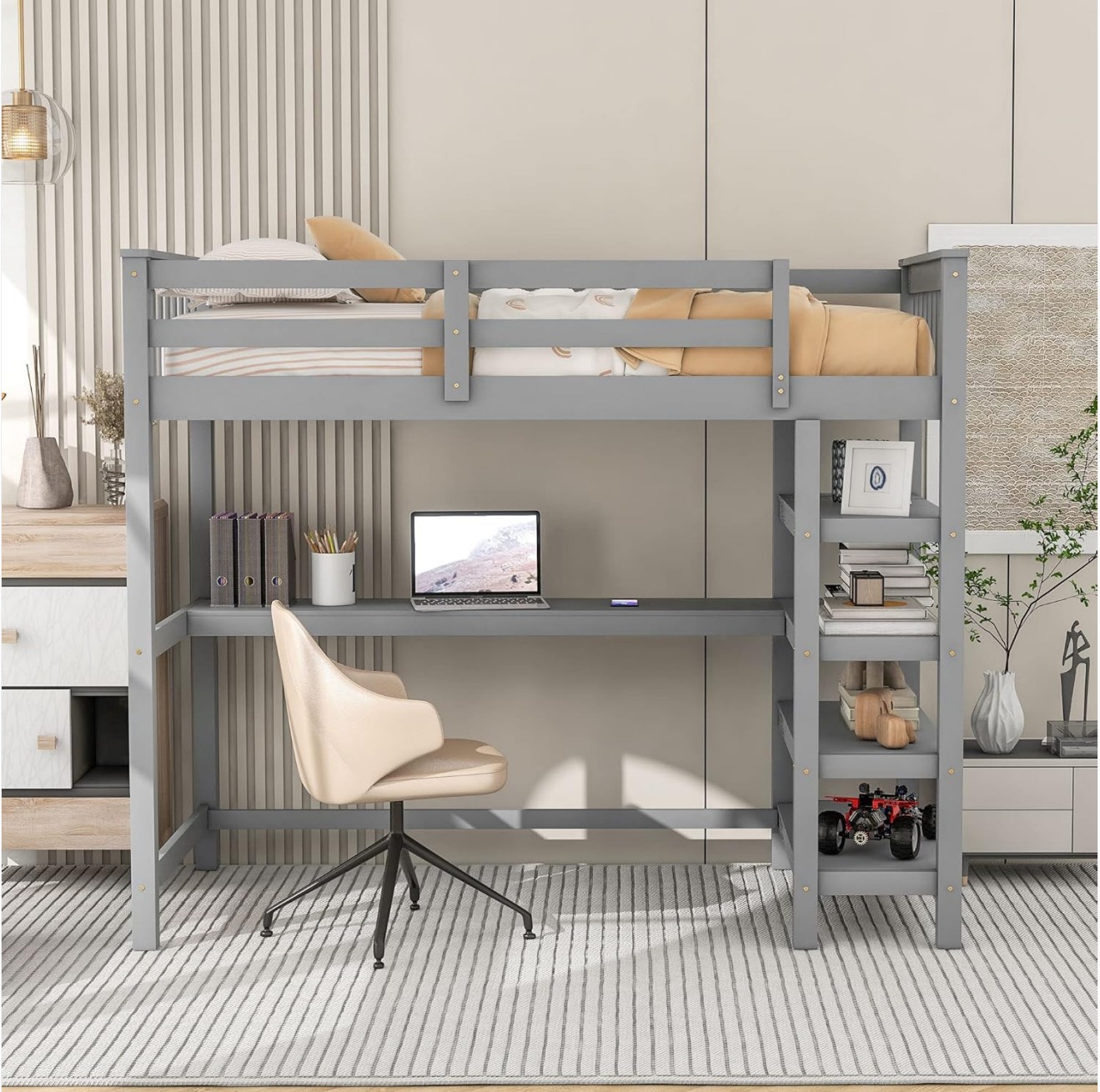
Image: Angled view of the assembled Merax Loft Bed, highlighting the desk and shelves from a different perspective.