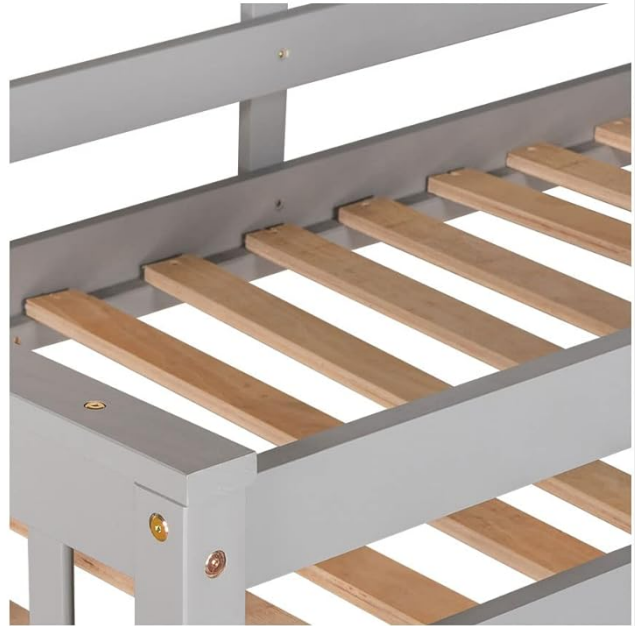
Image: Close-up showing the strong wooden construction and bed slats, emphasizing durability and noise-free design.