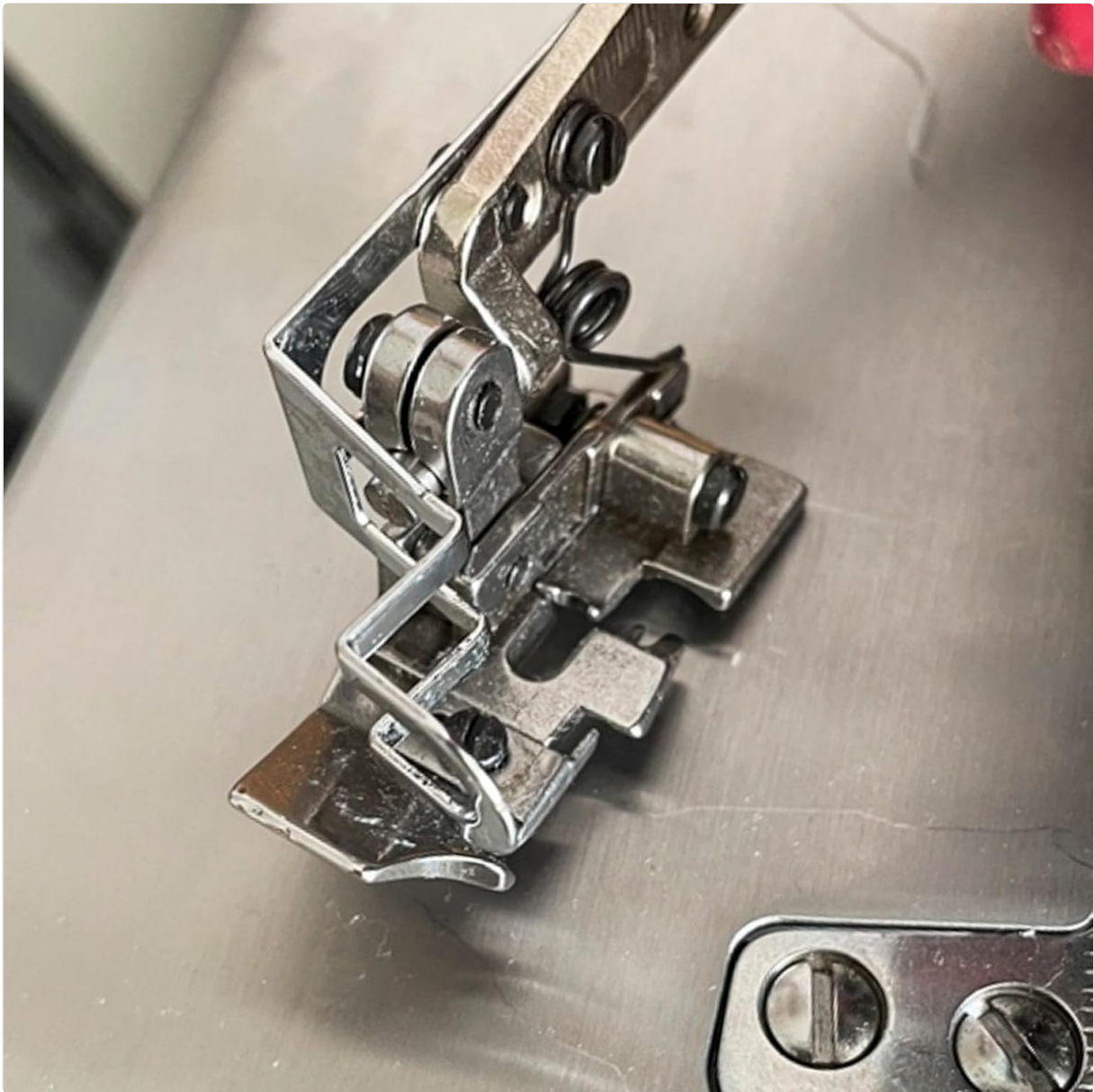
Figure 4: The Blooy 208649 Presser Foot shown installed on an industrial overlock sewing machine. This image demonstrates the foot's position relative to the needle plate and feed dogs during operation.