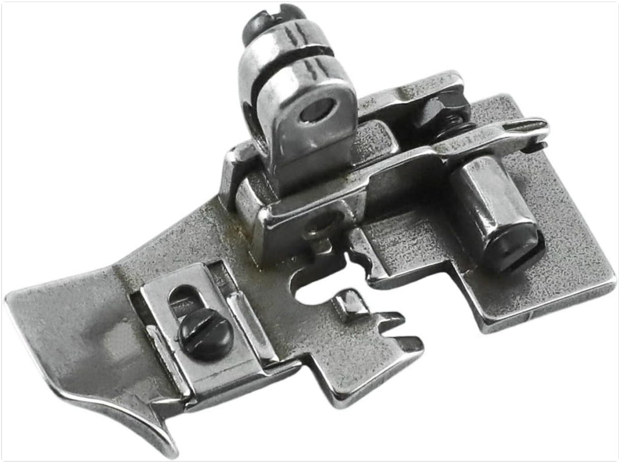
Figure 1: General view of the Blooy 208649 Presser Foot. This image shows the overall design and metallic finish of the presser foot, highlighting its robust construction.