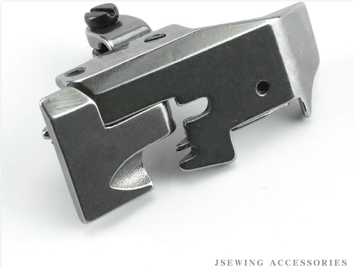
Figure 6: Bottom view of the presser foot, illustrating the contact points with the fabric and the opening for the needles.