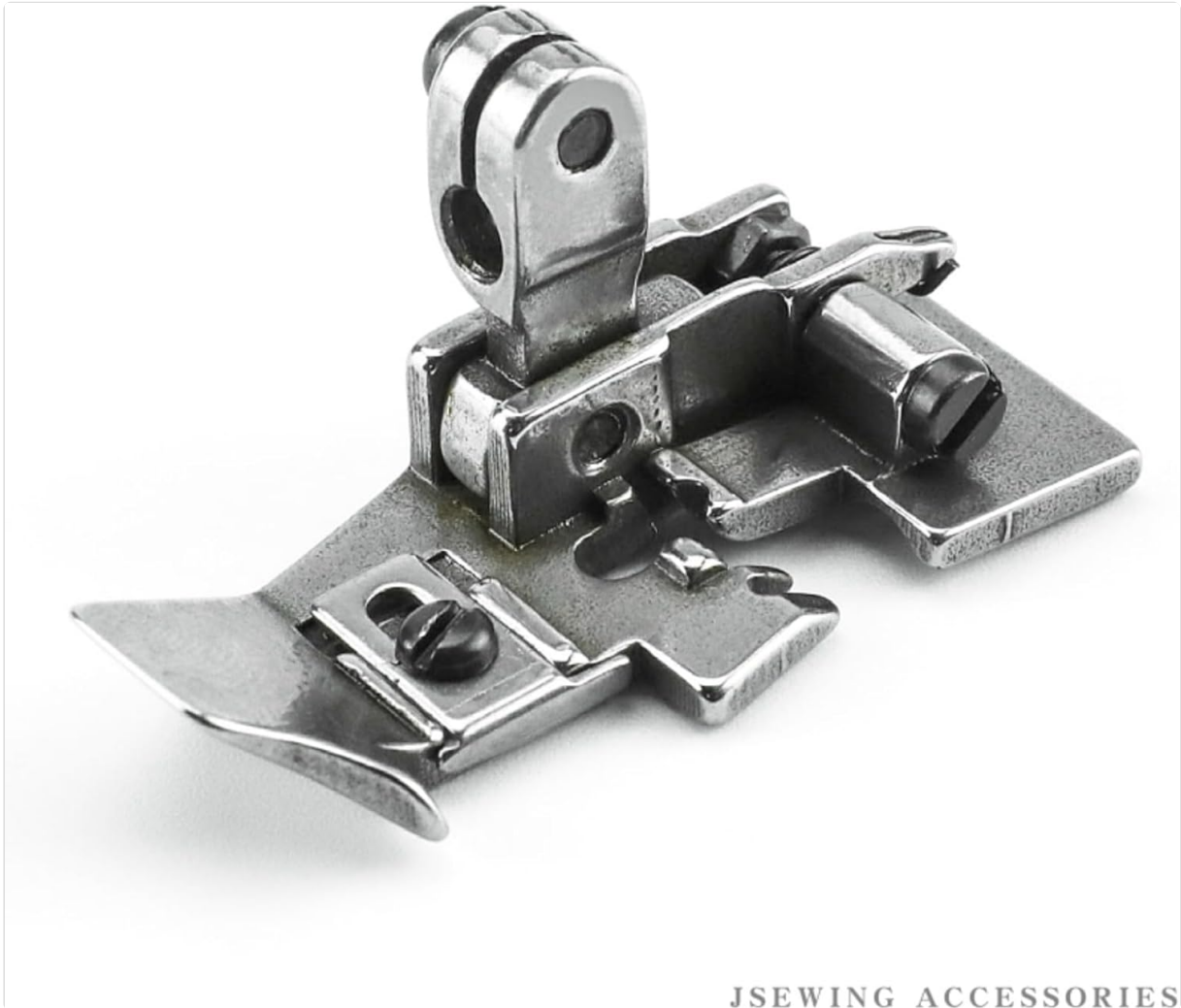
Figure 3: Angled close-up of the presser foot, showing the attachment point and screw mechanism. This view is helpful for understanding how the foot connects to the machine's presser bar.