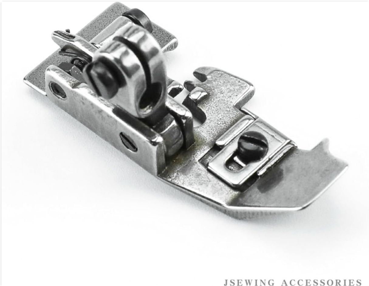
Figure 5: Underside view of the presser foot, showing the channels and surfaces that contact the fabric and feed dogs. Regular cleaning of these areas is important for smooth operation.