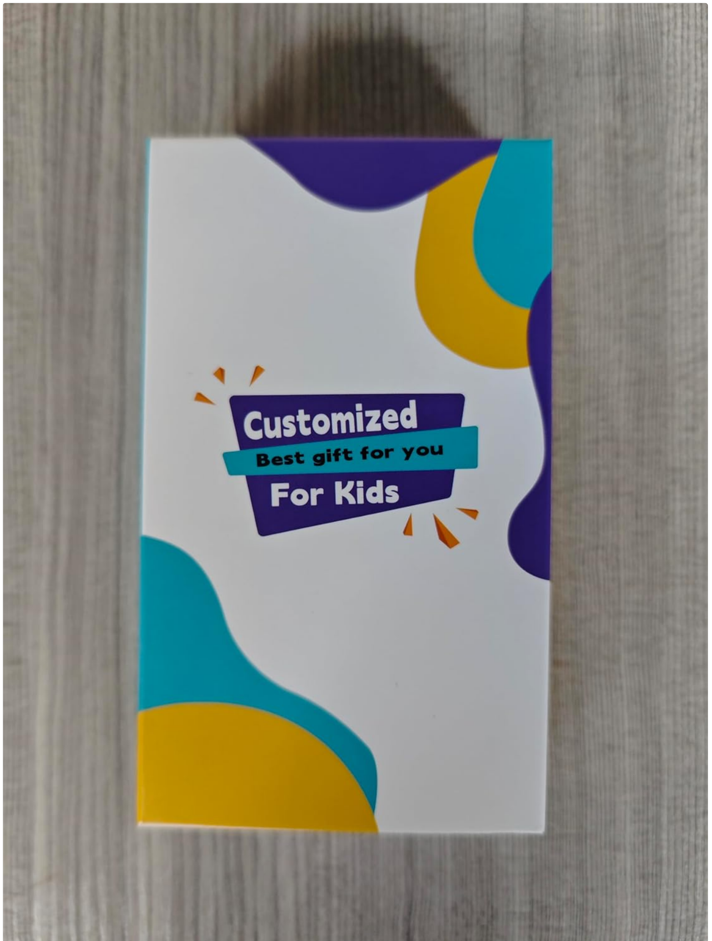
Figure 3.1: Smartwatch packaging box.