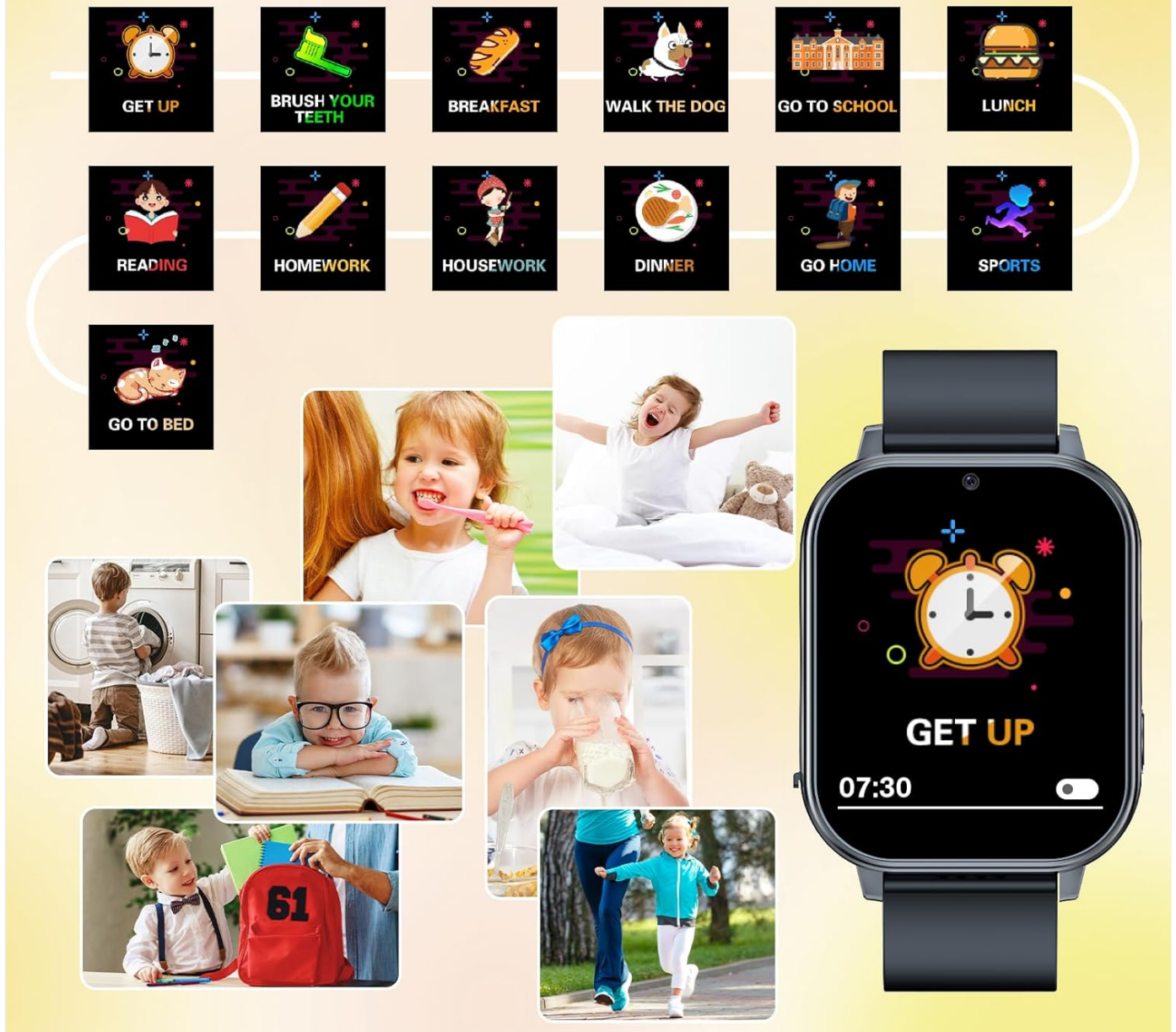
Figure 5.6: Habit Tracking feature.