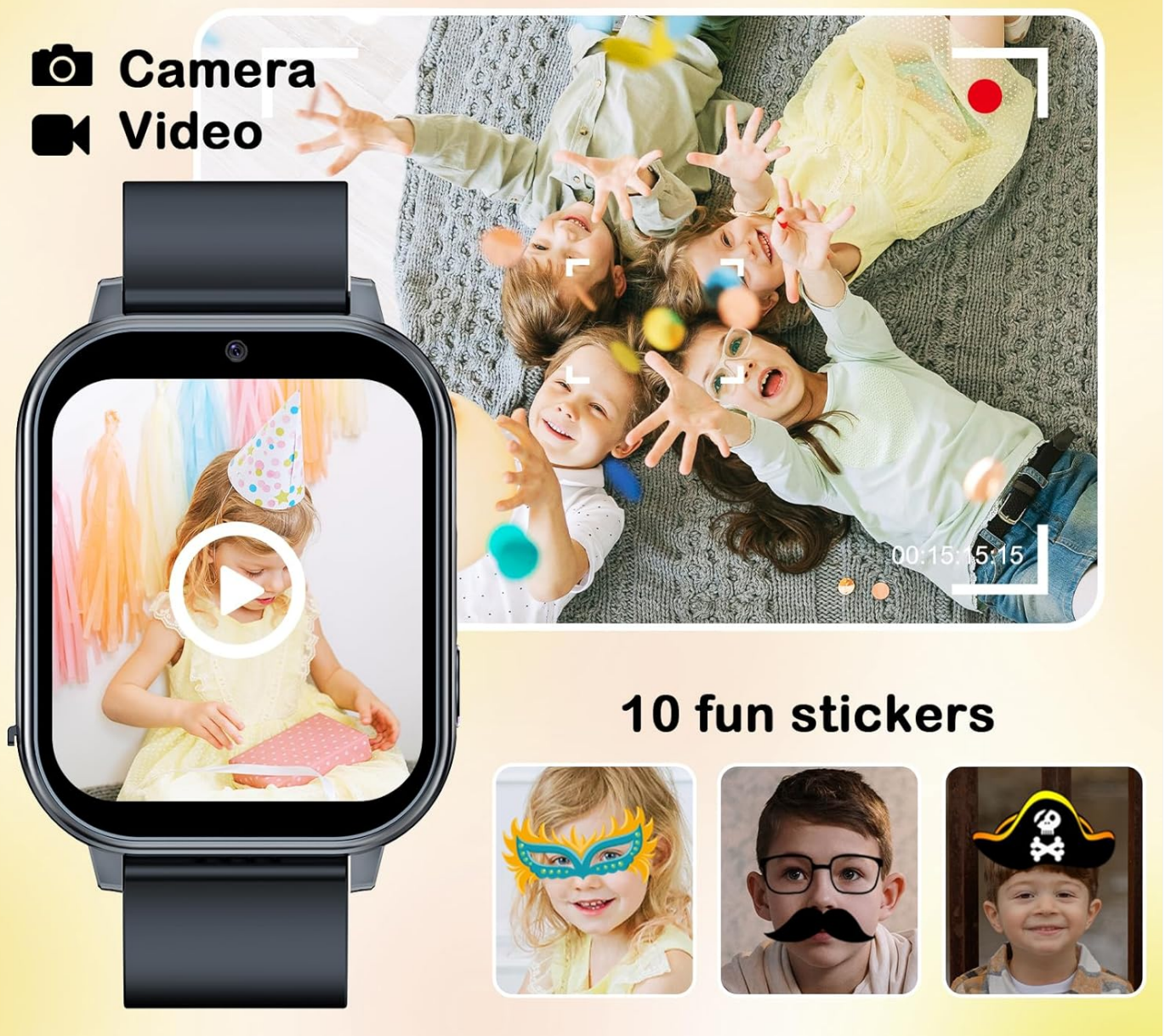
Figure 5.3: Camera and fun stickers.