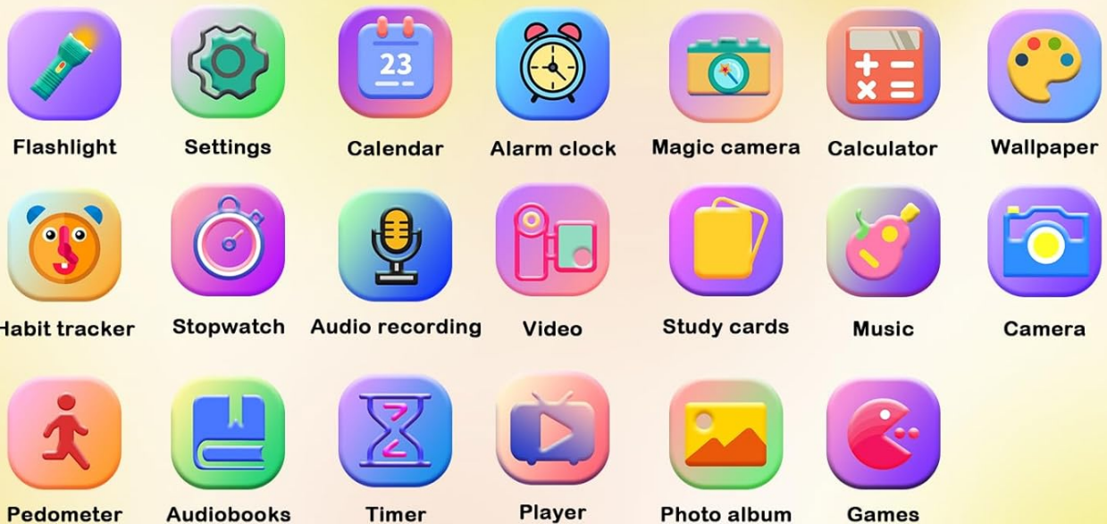
Figure 5.1: Overview of smartwatch applications.