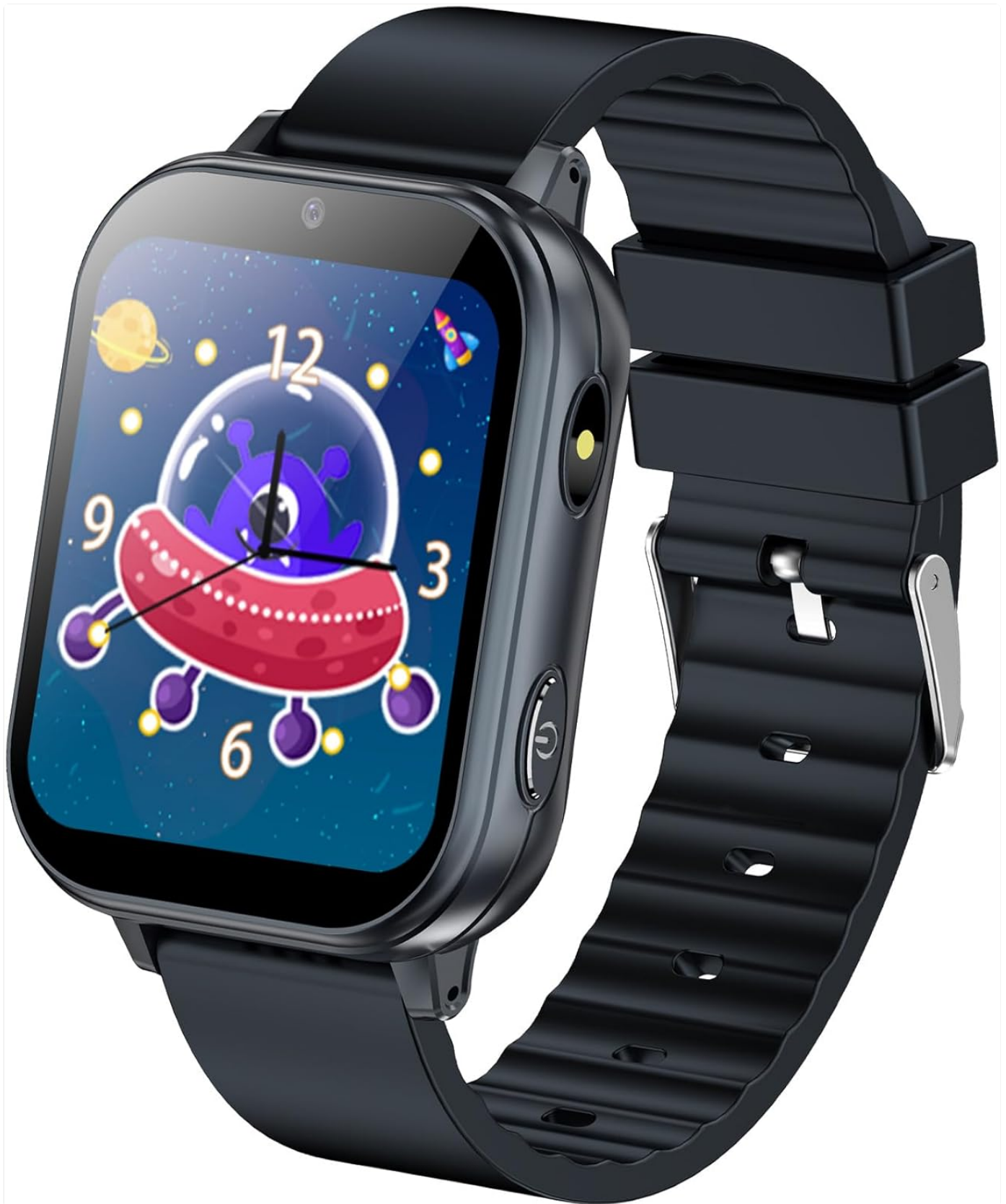
Figure 1.1: PTHTECHUS Children's Smartwatch (Model A22)