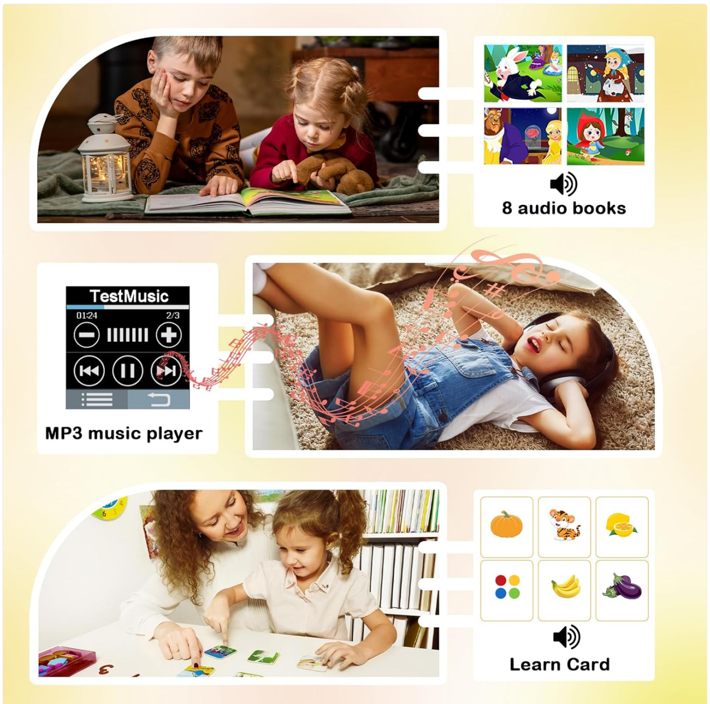
Figure 5.4: MP3 Player, Audio Books, and Learning Cards.