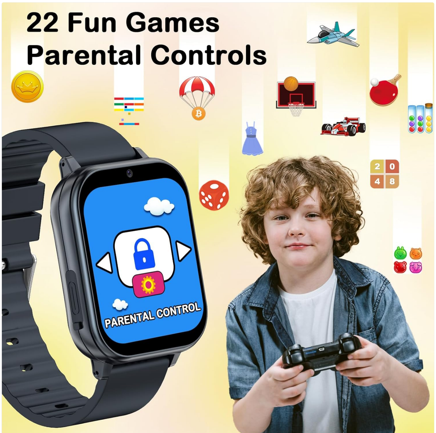
Figure 5.2: Games and Parental Control feature.

Parental Control: The watch includes a child lock feature to manage game access. Refer to the "Child Lock" section for details.