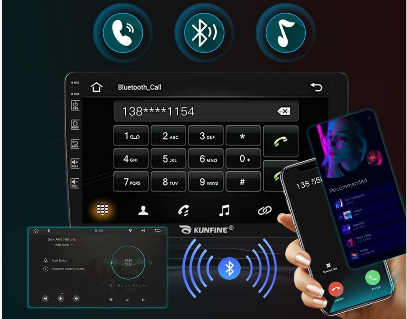
Figure 4.6: Bluetooth call and music streaming features.

Built-in BT, Enjoy Wireless Streaming Music, Hands-free Calling & Navigation