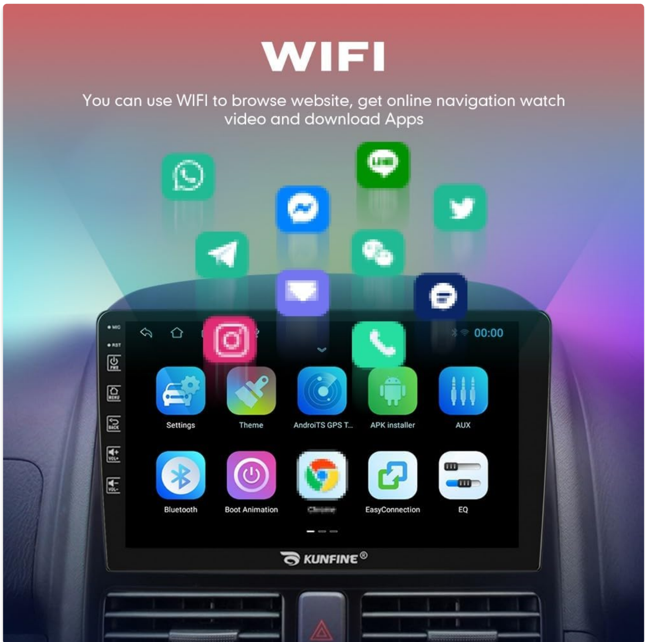
Figure 4.3: Wi-Fi functionality for app access and internet browsing.