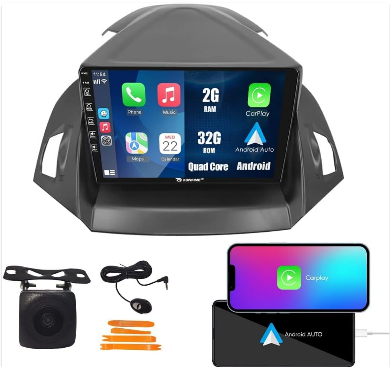
Figure 1.1: KUNFINE 9-inch Head Unit with included accessories and smartphone integration.