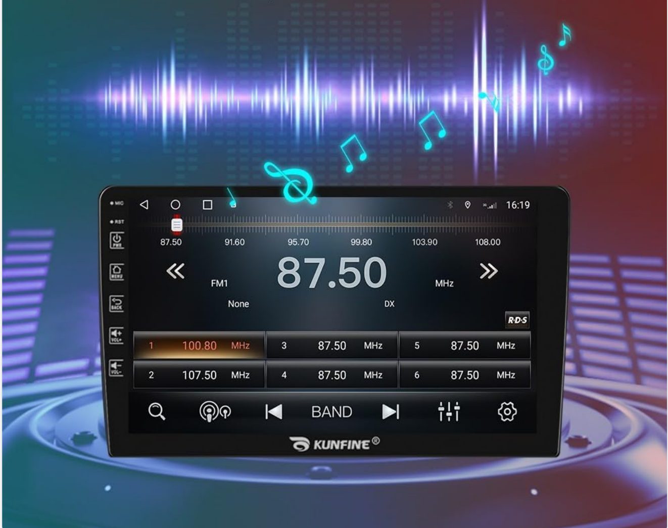
Figure 4.7: FM Radio interface.

You can transfer the music to the car stereo by FM, Long press to save your favorite radio station