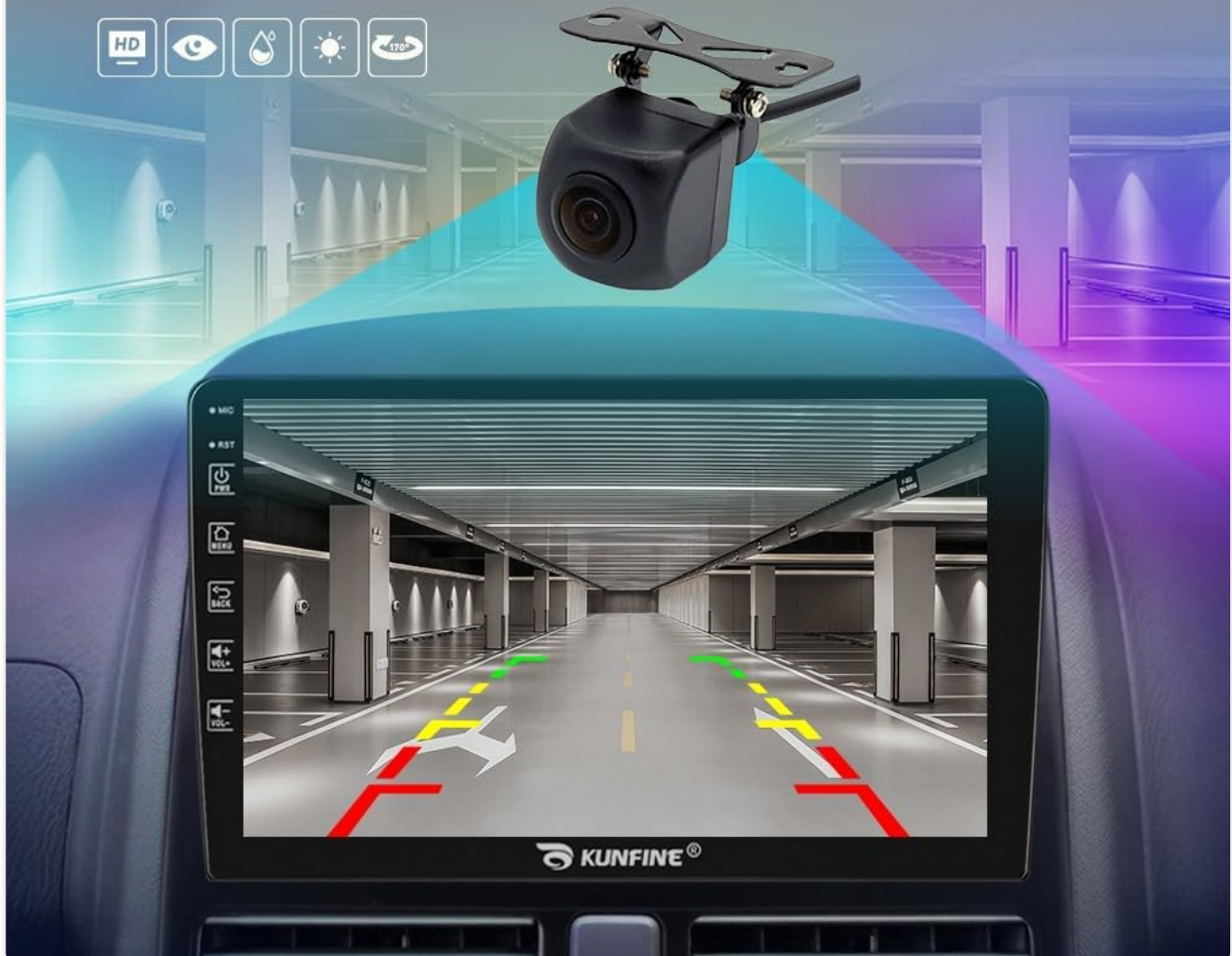
Figure 4.4: Car Reverse Camera display and functionality.