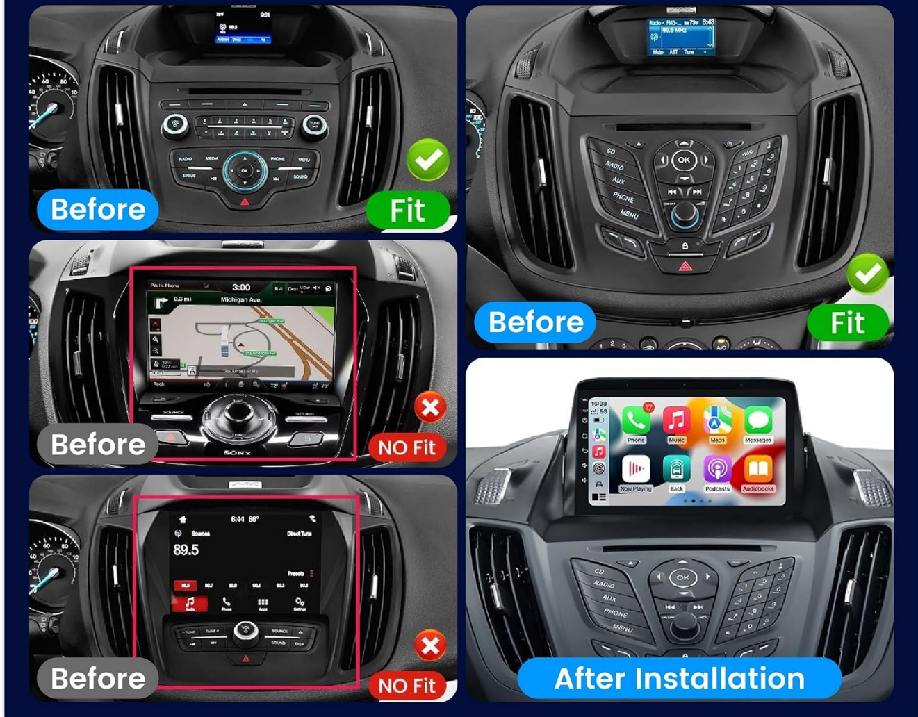
Figure 2.1: Visual guide for checking compatibility with Ford Escape dashboards. Note the warning regarding "Sony" or "SYNC" systems.

If there is "Sony" or "SYNC" on your original radio, please do not buy it!!!