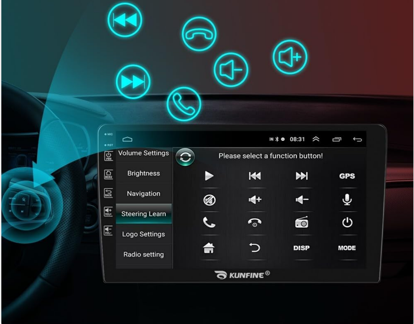
Figure 4.5: Steering Wheel Control interface for function mapping.

Quickly switch functions which you want with your car's steering wheel control