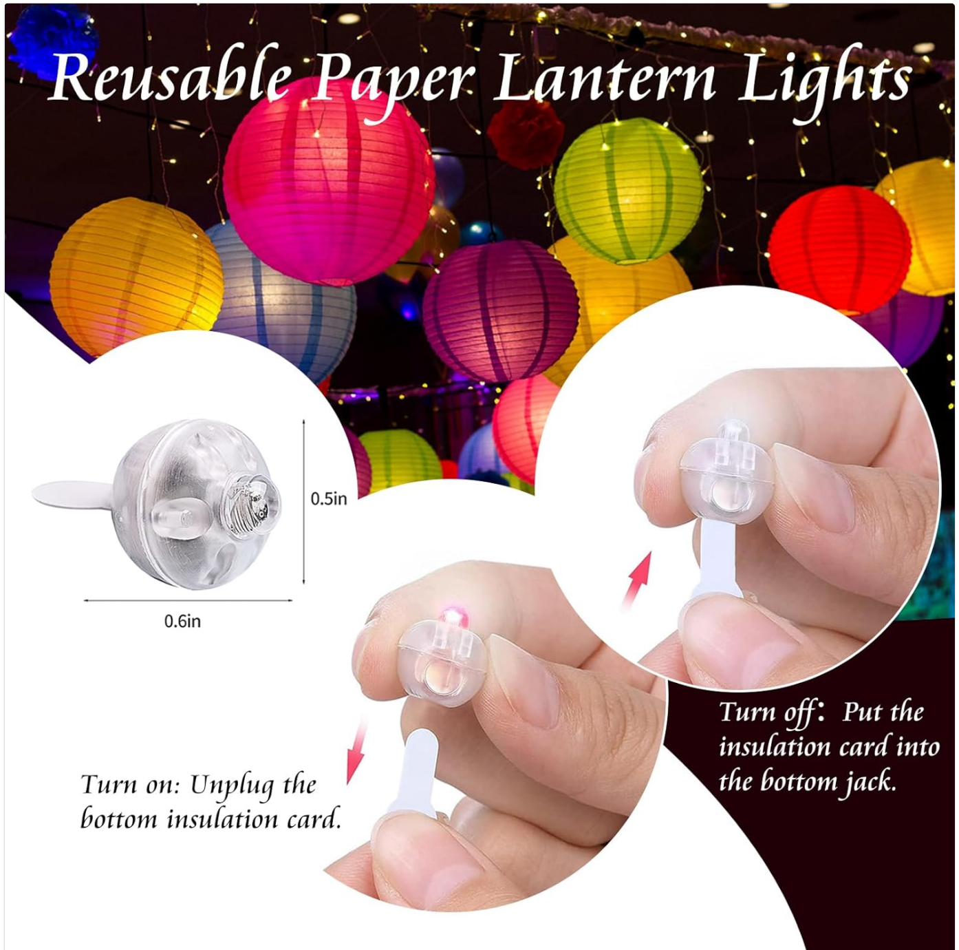
Figure 1: Illustration of pulling out the insulating tab to turn on the light and reinserting it to turn off.