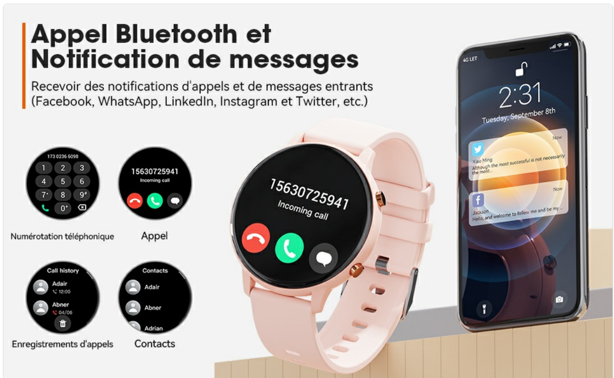
Image: The Hwagol Smartwatch G25 displaying call interface and notification icons, demonstrating its Bluetooth call and smart notification capabilities.

Once paired with your smartphone, the smartwatch supports Bluetooth calls. You can dial numbers directly from the watch, answer incoming calls, and view call history. It also displays notifications from social media platforms like Facebook and WhatsApp, as well as SMS messages.