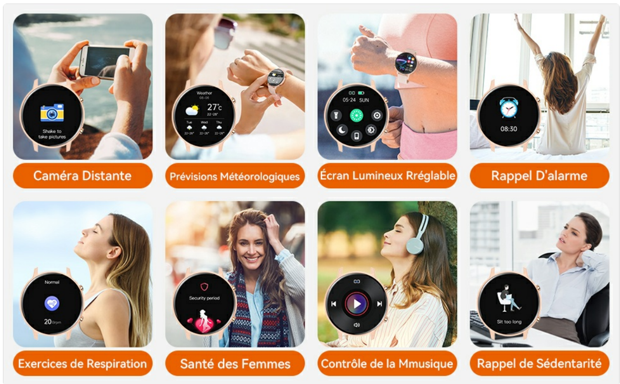
Image: A grid of icons on the Hwagol Smartwatch G25 screen, representing various functions like camera remote, weather, alarm, and music control.