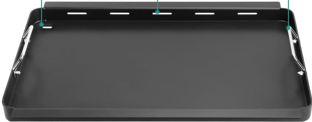
Image: Detailed view of griddle features including grease system, vents, and handles.