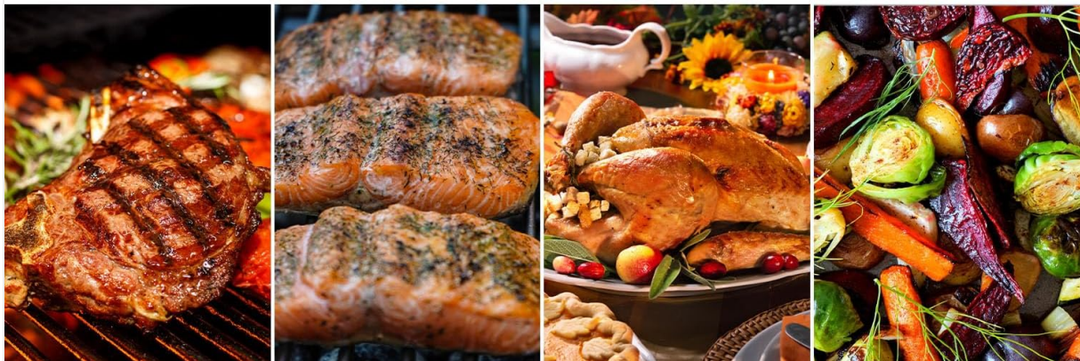
Image: Examples of meals prepared using the griddle insert.

Your browser does not support the video tag.