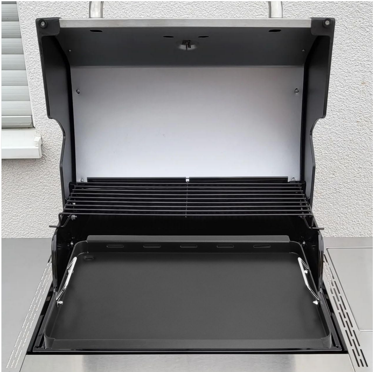
Image: Griddle insert properly installed in a grill.