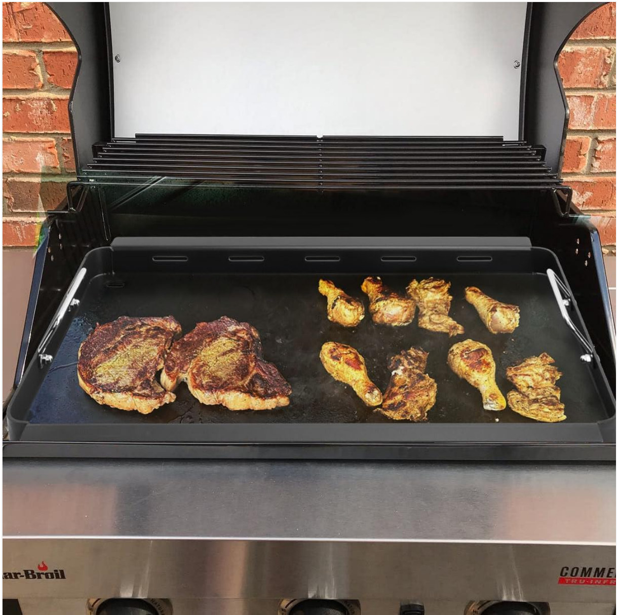
Image: Food cooking on the griddle surface.