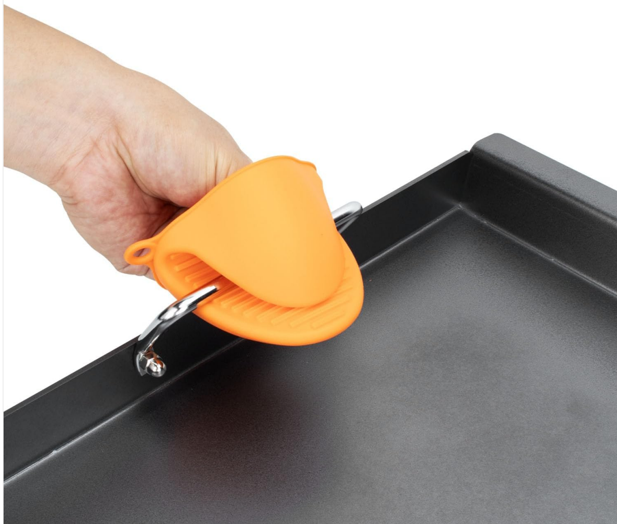
Image: Silicone gloves provided for safe handling of the griddle.

Protect Your Hands, Easy To Move And Replace