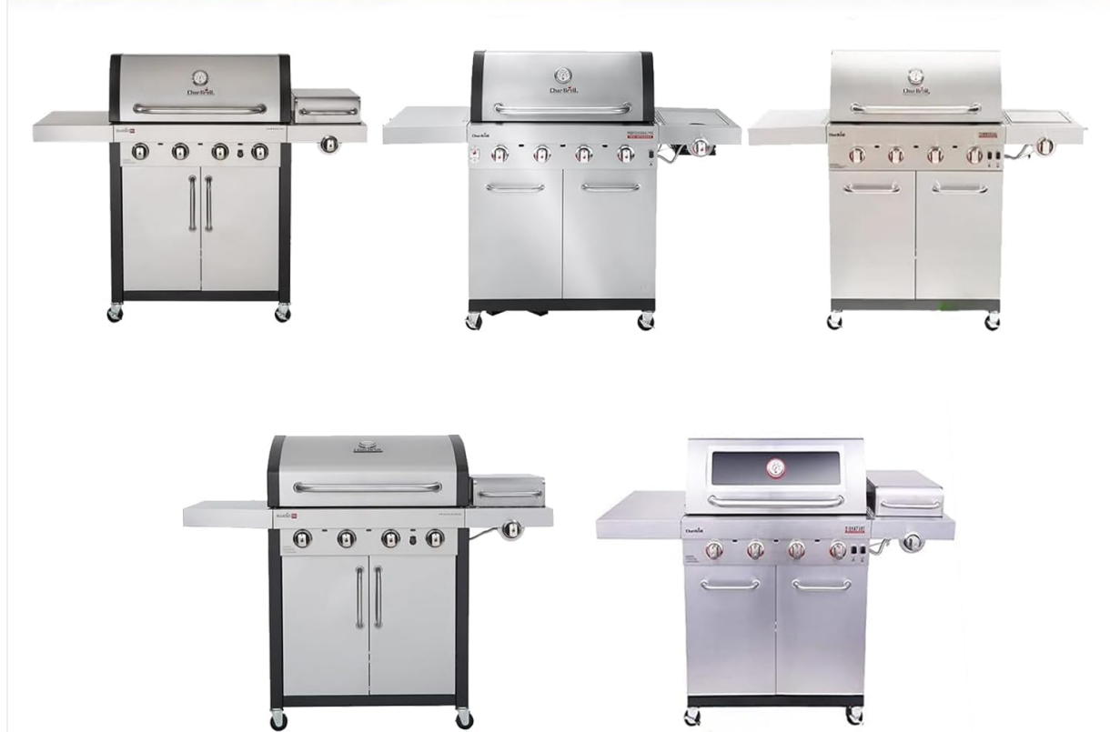
Image: Examples of compatible Charbroil grill models.